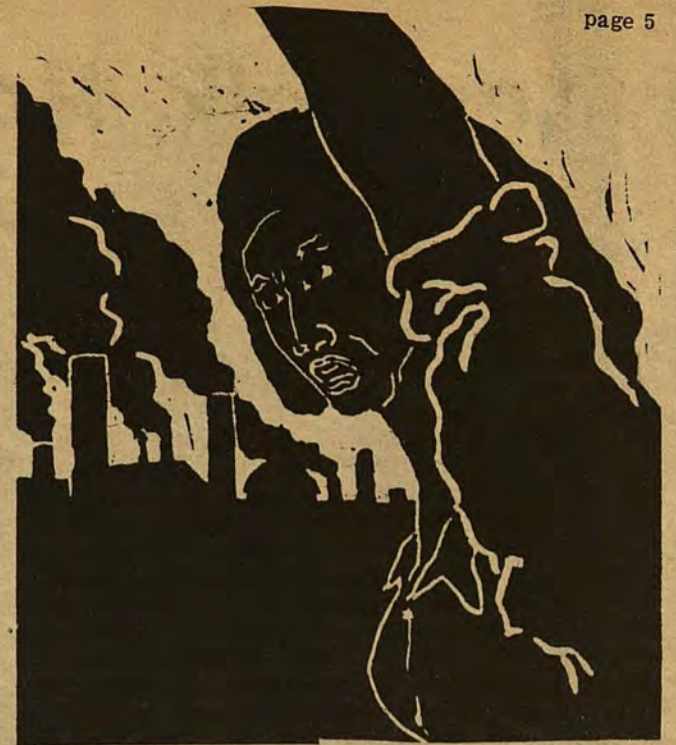
workers are women.

Since union leadership, for the most part, no longer serves the worker's interests, they help to promote bourgeois ideology, like male chauvinism, in the same way that the bosses do. To keep men and women from waging a united struggle, union misleaders have fostered the growth of separate unions based solely on sex. Specifically, this has occurred among telephone workers where men and women belong to separate unions. This separation has weakened their ability to unite and frequently they do not support one another during strikes. Male chauvinism has penetrated all levels of unionism. On the local level, women are discouraged from assuming leadership positions. This lesson was brought home to us by the SDS work-in. For example, in one office of Kaiser hospitals, where there are over fifty women and only a handful of men, the shop steward was a man. The entire local union hierarchy, in fact, except for one minor official, was composed of men. And this in an area - office and technical personnel - where the vast majority of