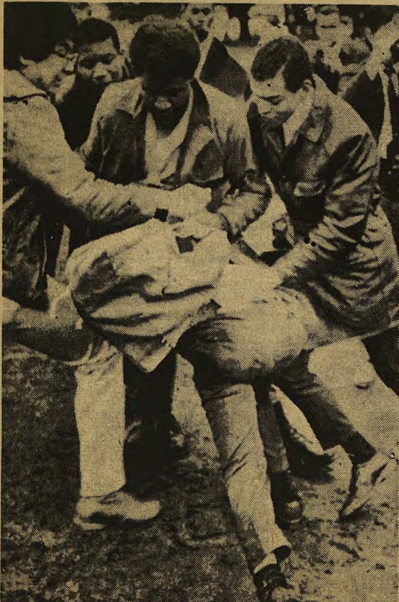
Third World activists handle pro-administration racist scab.

Taking the political offensive against attacks is not a strategy favored by lawyers. This doesn't mean we should never have lawyers. It means we should never rely on them. Instead, we should rely on the people, on winning people over politically (not out of first amendment liberalism) to support the movement. Building a fighting movement is the only strategy relevant to defense. Even while carrying on that fight in a good way in court, we should realize that this strategy must be implemented mainly outside the courtroom and directed against the Imperialists as a class, not just one of their weapons.