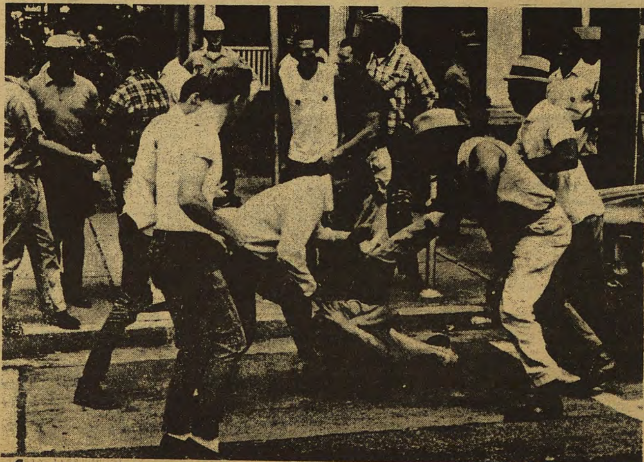
4- Black and white workers handed scabs their just desserts...

In splitting, this minority faction of the convention shamelessly distorted and lied about the positions of other SDSers. To clarify and correct these distortions, we reaffirm our complete support of the right of all oppressed nations to self-determination and give active support to such struggles as that of the Vietnamese people. By self-determination we mean the political and economic independence of all oppressed people. We demand the immediate, unconditional withdrawal of US imperialism from Viet Nam and everywhere else in the world. Furthermore, we reaffirm our support for the Black Liberation Move-