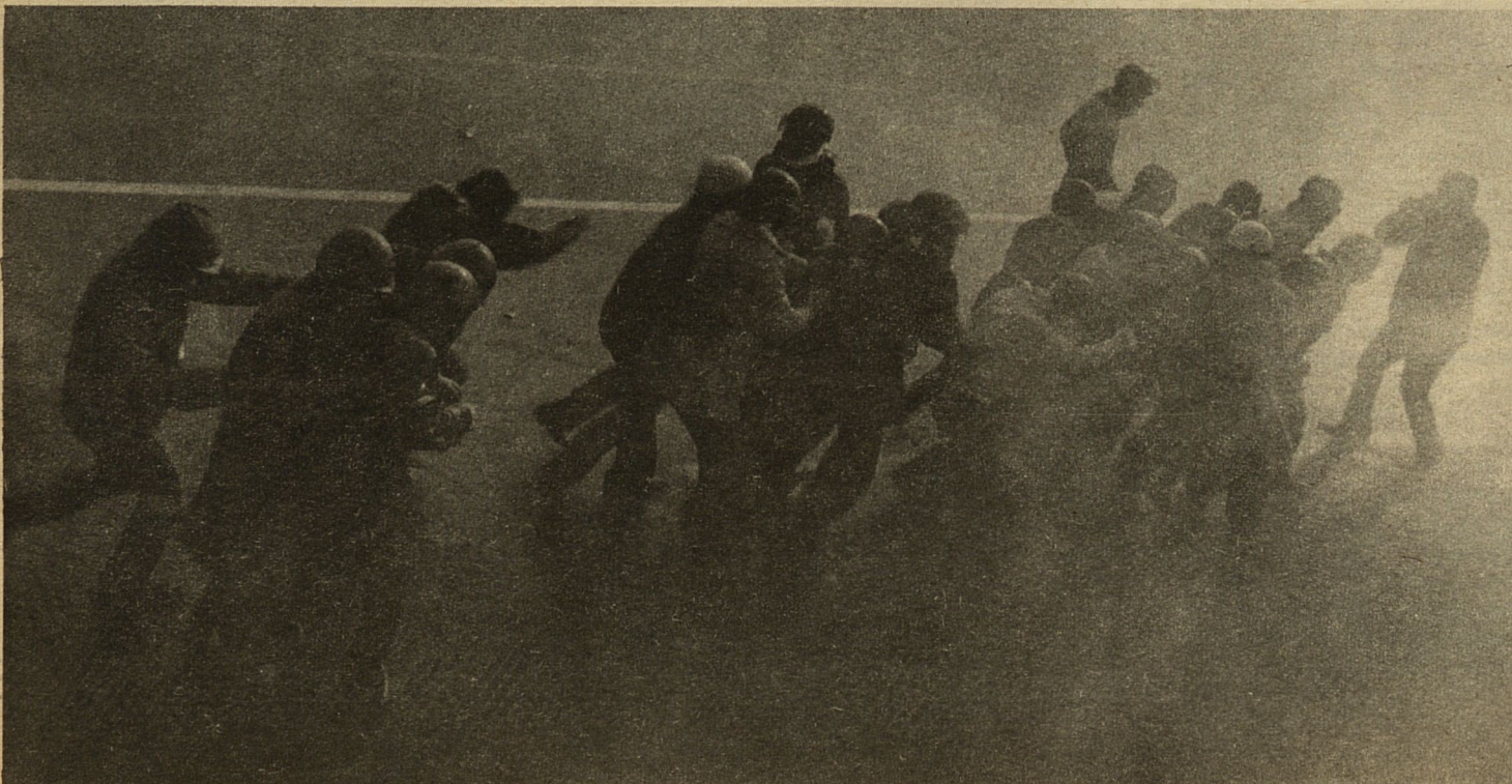
Japanese students in the streets.

The Bund was first formed in 1959, when it split from the Japan Communist Party over its failure to put forth a revolutionary line against the Japanese ruling class based on the "two stages" theory. The Bund was joined for awhile with the Japan Revolutionary Communist League (JRC), which split from the JCP primarily over the right to read and discuss works by Trotsky. The Bund split from this group in 1959 over strategic problems in the fight against the Japan-US Security Treaty. The JRC then split, first in 1960, into a Fourth International or explicitly Trotskyist faction, leaving the Marxist Student League (MSL). The MSL then, in 1963, split into two factions which later formed two of the present Zengakurens—Chukaku, or center faction, and Kakamaru, or revolutionary Marxist faction. The cause of the split was Chukaku's emphasis on the primacy of action, as opposed to Kakamaru's highly ideological orientation. Chukaku believes in the importance of engaging in struggles with the police, et cetera, as a way of raising consciousness, whereas Kakamaru insists on the importance of cadre training through