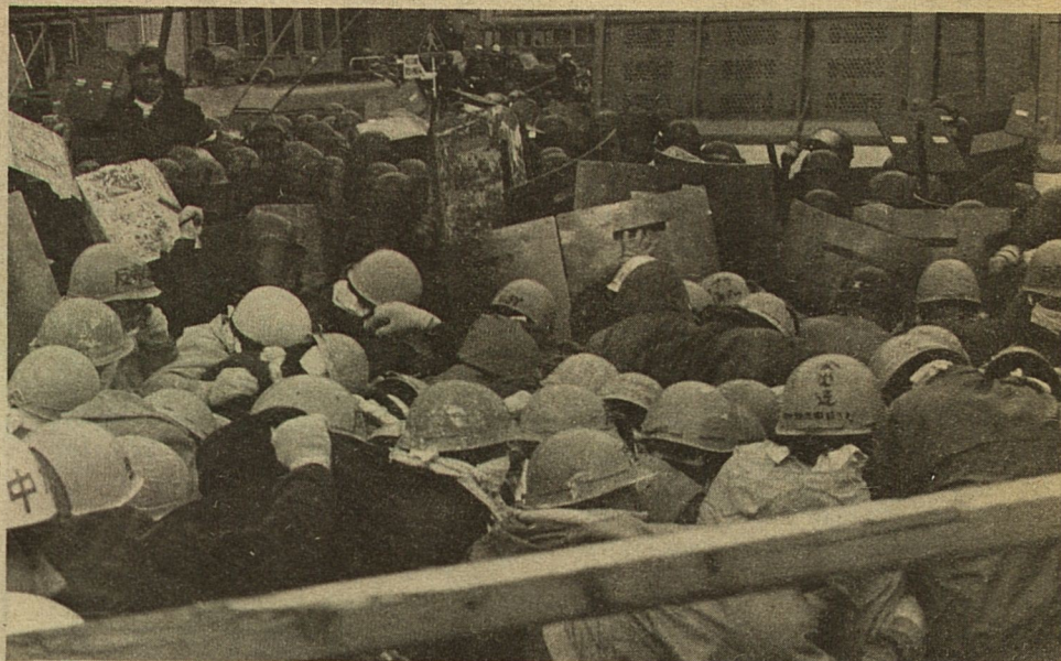
The several Zengakurens demonstrated against the USS Enterprise. Note the police helmets and shields. Note the Zengakuren helmets. Be prepared.

But 1958 and 1959 were the important years of policy formation and political splits. The national convention which adopted a Party program calling for a "two-stage" revolution was held in July 1958. The analysis behind the program held that US imperialism was the number one enemy, since it dominated Japanese monopoly capitalism—the second major enemy. Thus, the revolution must first proceed against the US, allying with nationalist elements, and then attack the Japanese ruling class.