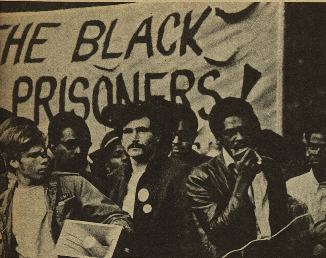
Bobby Seale speaks at Lincoln Park.