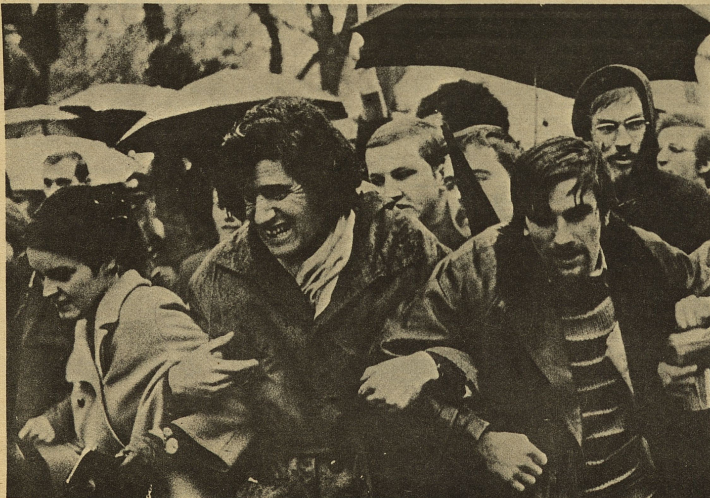
THIS WELL-KNOWN PHOTO IS OF DUTSCHKE WITH ONE OF HIS CLOSEST COMRADES, CHILEAN GASTON SALVATORE.

They set fire to cars. They demolished editors' offices. They asked neither for the committer