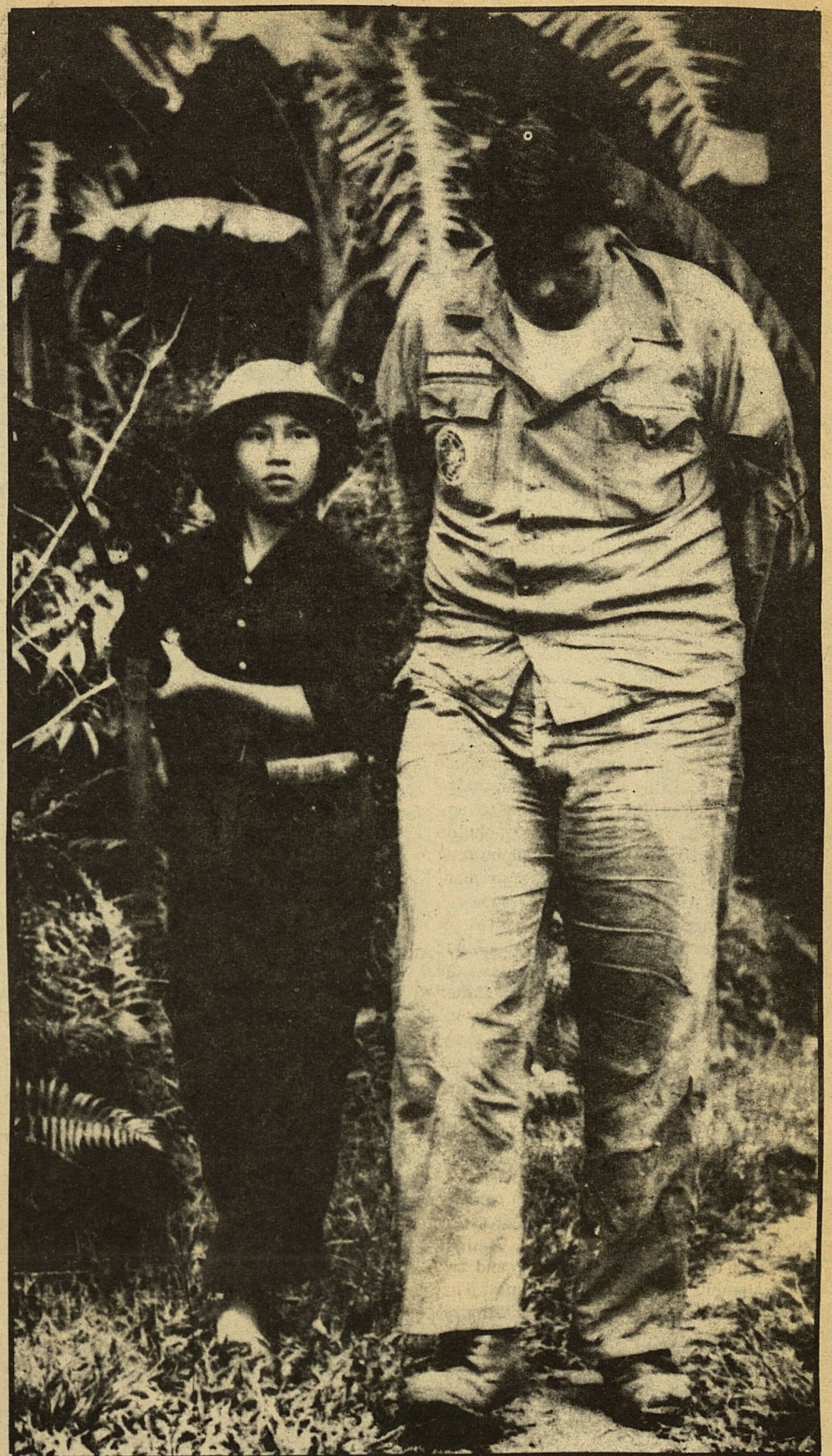
"A WOMAN'S WORK IS NEVER DONE"