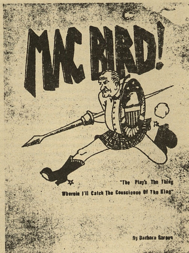
The cover of a "savagely angry work" that is a prime example of Brustein's "third theater," as published in Berkeley, Calif.

ROBERT BRUSTEIN is dean of the Yale School of Drama and drama critic for The New Republic. He has written "The Theatre of Revolt" and "Seasons of Discontent."