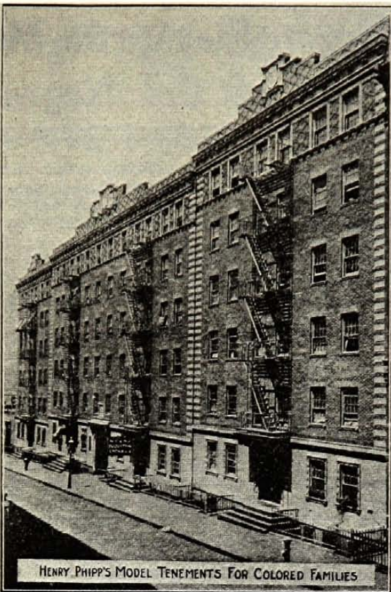
HENRY PHIPPS' MODEL TENEMENTS FOR COLORED FAMILIES