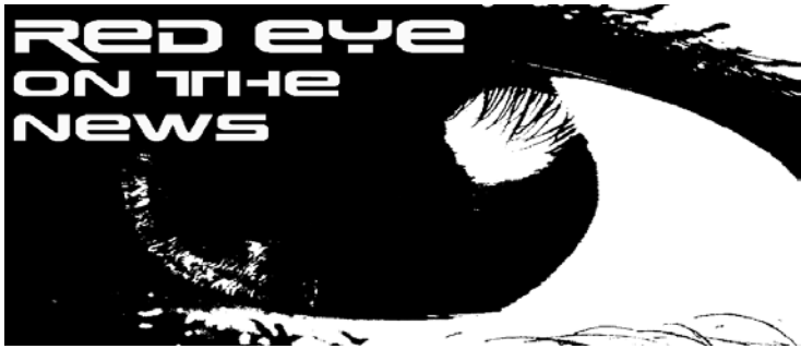
Below are excerpts from mainstream newspapers that may be of use for our readers. Abbreviations: NYT=New York Times, GW=Guardian Weekly, LAT=Los Angeles Times

Offering a clear path for revolution, Lenin states, "No number of pamphlets and no amount of preaching can enlighten the proletariat, if it is not enlightened by its own struggle against the dark forces of capitalism." Religion is one among many of these dark forces, and the struggle continues. Maher is not as clever as he seems... ☺