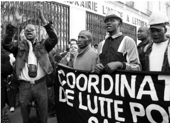
Undocumented workers at a rally.

UZES, FRANCE, Sept. 11 —The summer holiday season is over and the first strikes and demonstrations against job cuts and worsening conditions are breaking out. A case in point: high school teachers struck the whole first week of classes in this small town in Southern France (pop. 7,800, 2004 unemployment rate: 19%, average weekly household income: 275 euros), occupying the principal's office on Sept. 1. The strikers were mobilizing against obligatory overtime and over-crowded classes. The local board of education refused even to receive a parent-teacher delegation on Sept. 4.