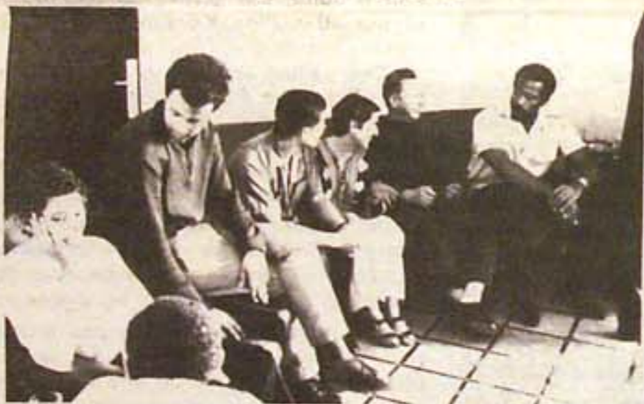
Ethiopian student, Chinese 2nd Ambassador and Eldridge Cleaver