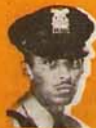
PIG GLEN SMITH DEAD