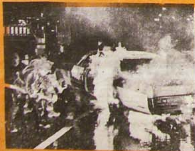
FIRE PIGS ATTEMPT TO EXTINGUISH BURNING PIG CAR THAT PEOPLE DEALT WITH

The community had come out and had witnessed both the beating of the 9 year-