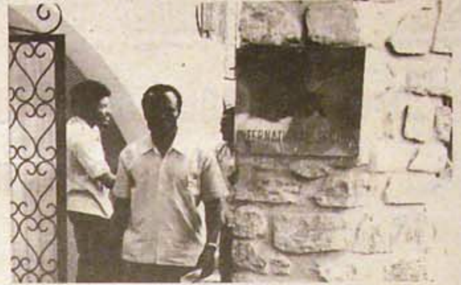
D.C. greeting African brothers