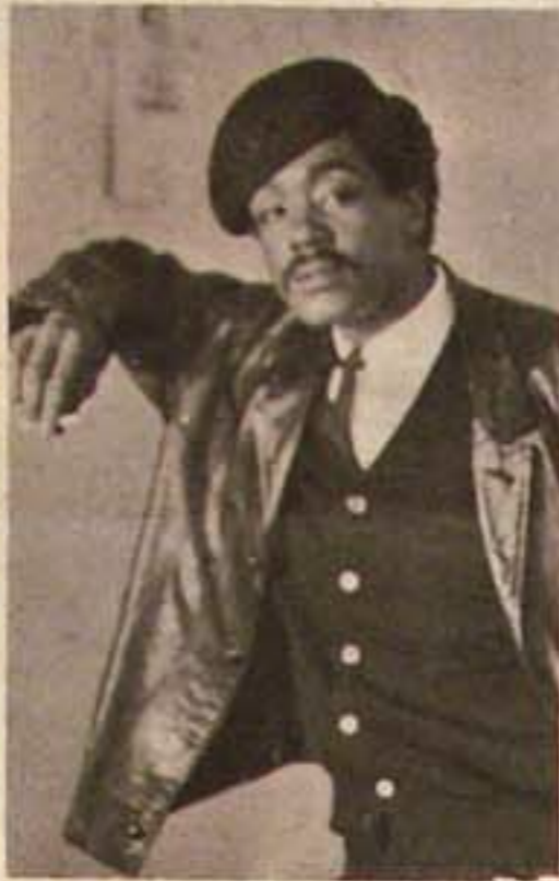
Chairman Bobby Seale

not be present to represent him. His motions were denied and the trial began as scheduled. During the proceedings Chairman Bobby repeatedly demanded his right to defend himself since his right to counsel had been denied. As the days passed and Chairman Bobby's objections increased, Judge Hoffman's fascism became more overt and blatant. Finally, the judge ordered Chairman Bobby bound, gagged and beaten in the courtroom.