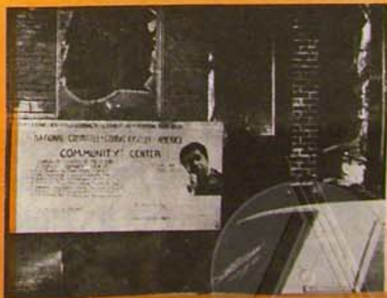
FASCIST PIG STANDS GUARD AFTER PIG ATTACK

There are 10,000 more oppressed people who will fight with the courage and determination of the Vietnamese people who have fought for more than 6 years against the highly developed technology of the U.S. aggressors.