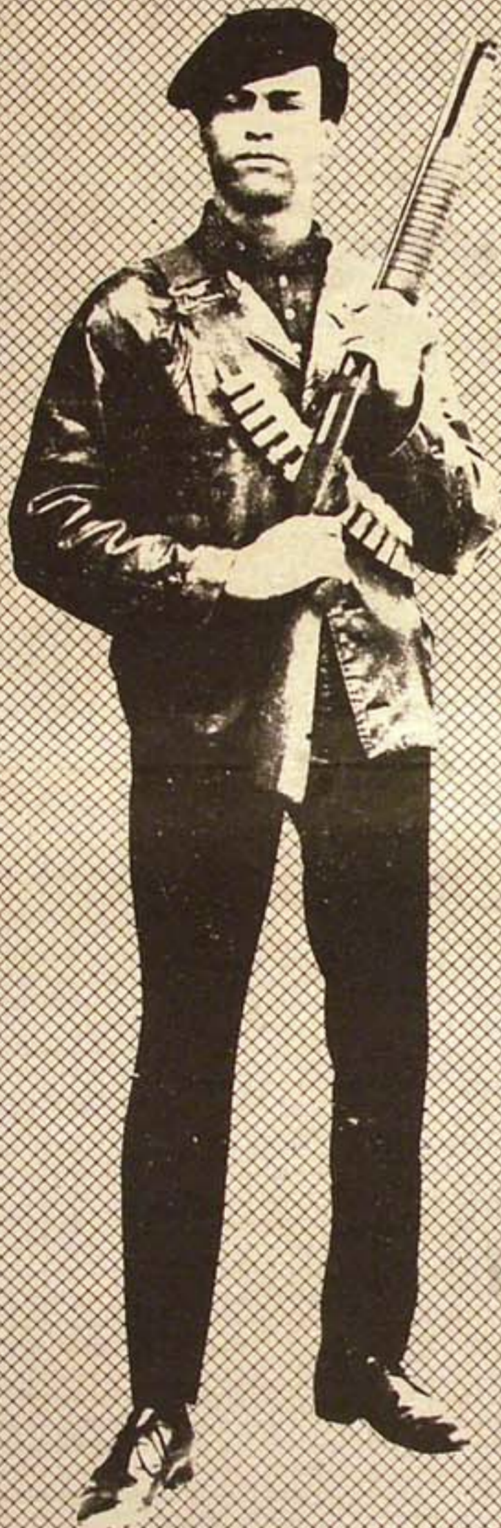
Huey P. Newton Minister of Defense Black Panther Party