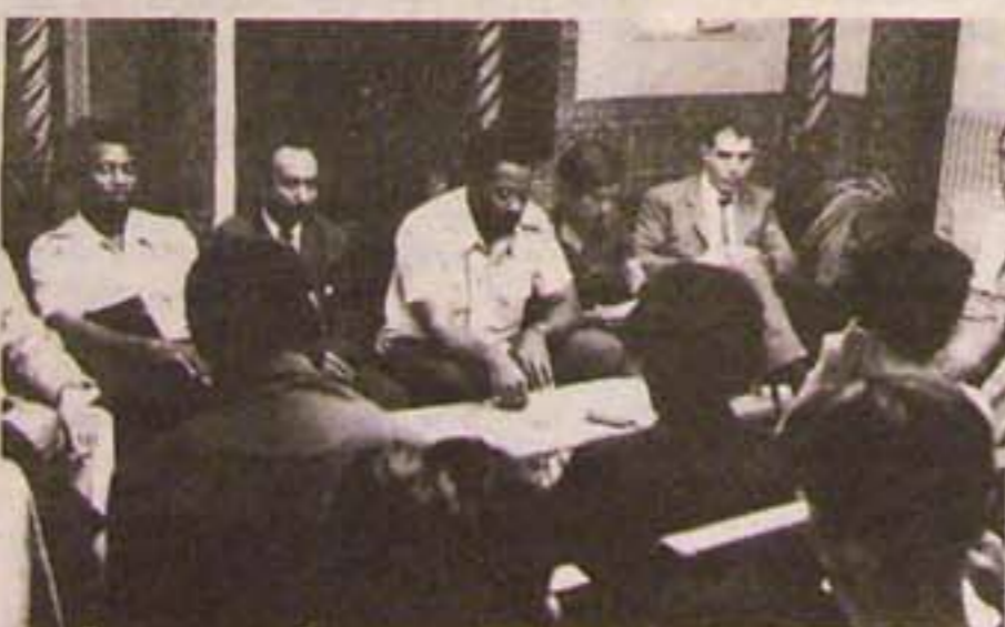
Press Conference prior to opening