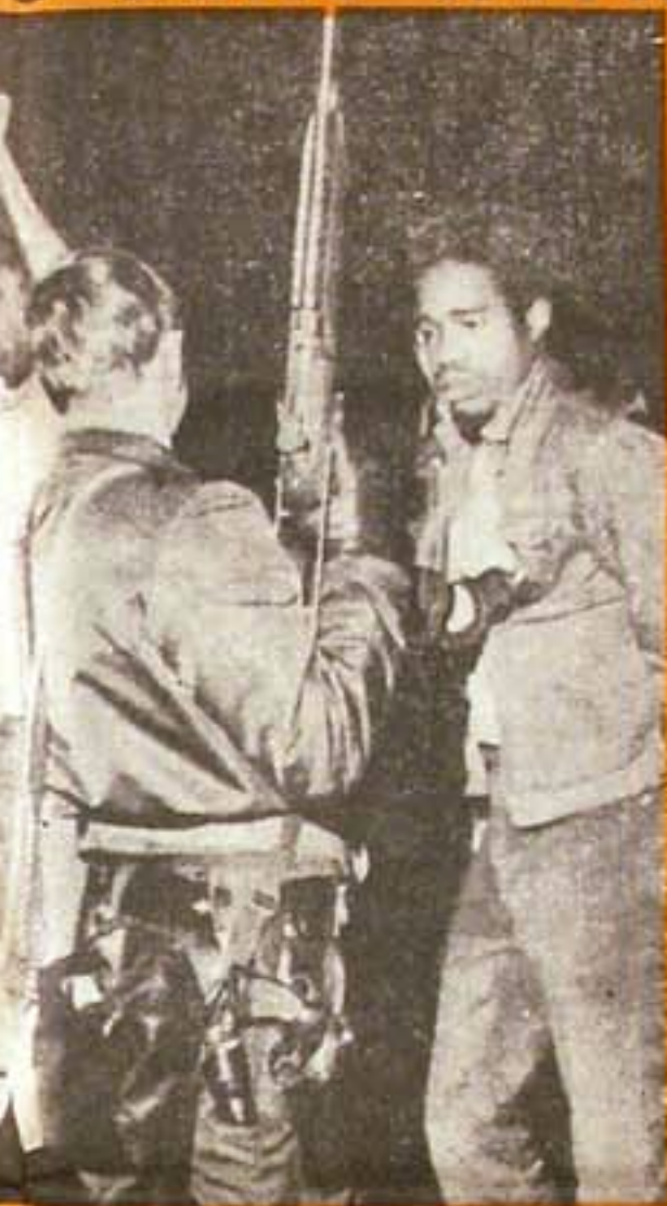
POWERED RIFLES MANHANDLE BROTHERS

old boy and that of the 2 N.C.C.F. workers. The people gathered in the street and began to show their hatred for the pigs, the oppressors and murderers in the black community, by throwing bricks and bottles at them. The pigs pulled their guns but when they saw that this had no effect on the people, they withdrew from the community.