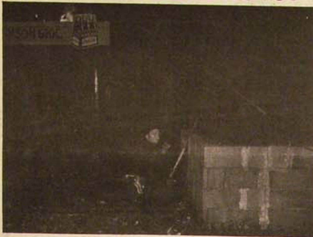
Vigilante terrorizing the Black community of Cairo, Ill.

White vigilantes have been excessively active this past week in arson and other acts of violence against the Black Community of Cairo, Ill. This week (October 10-17) has seen daily series of events in which the Black Community has been brutally terrorized.