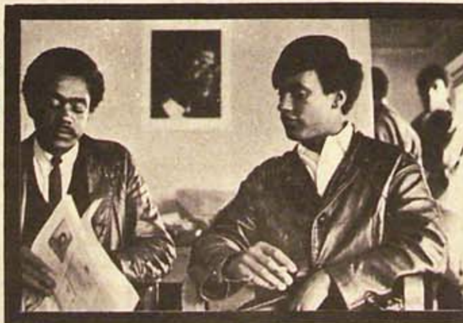
July 1967--Minister of Defense, Huey P. Newton (right) and Chairman, Bobby Seale (left), reading an early edition of B.P.P. Newspaper at the home of Eldridge Cleaver, Minister of Information B.P.P.

ALL POWER TO THE PEOPLE! SEIZE THE TIME!