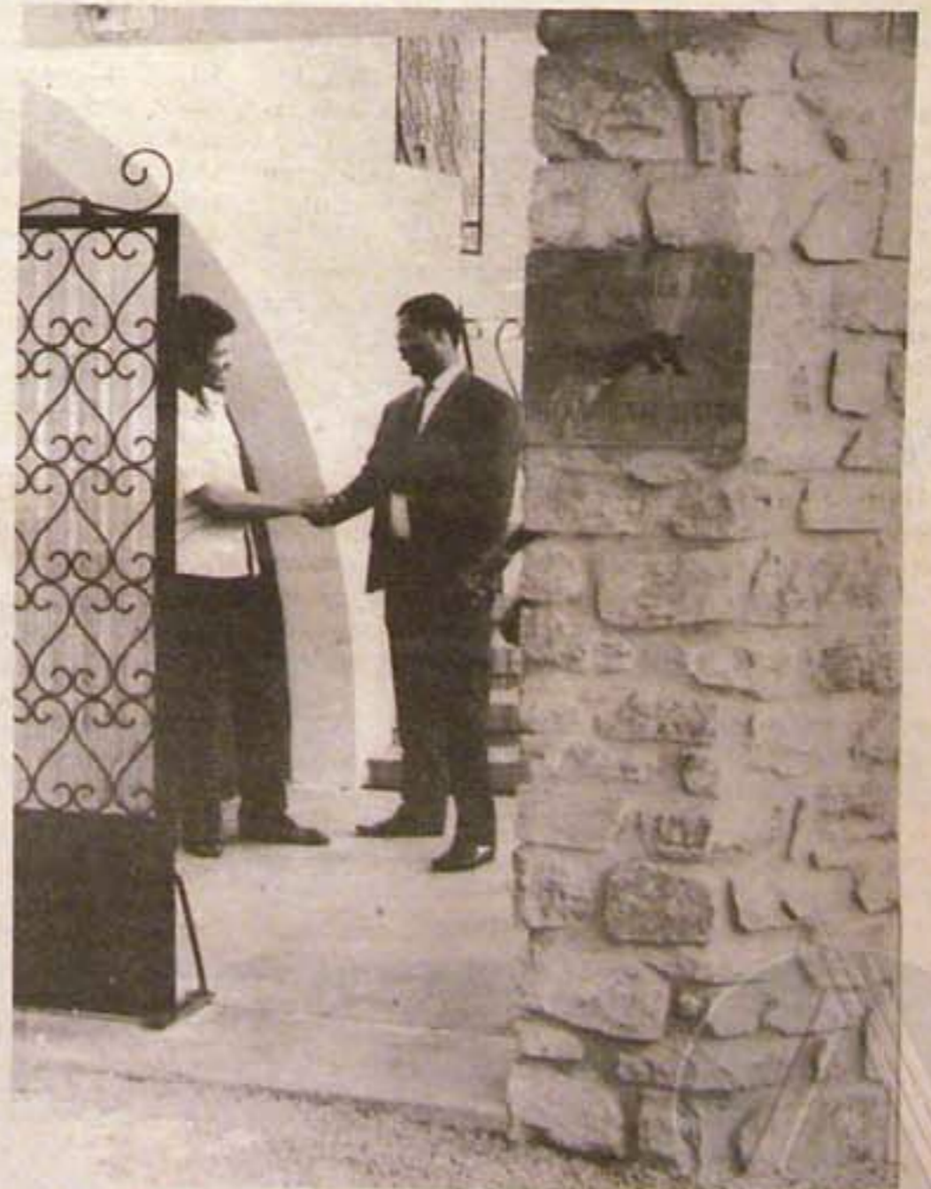
D.C. and representative from ANC (African National Congress) South Africa