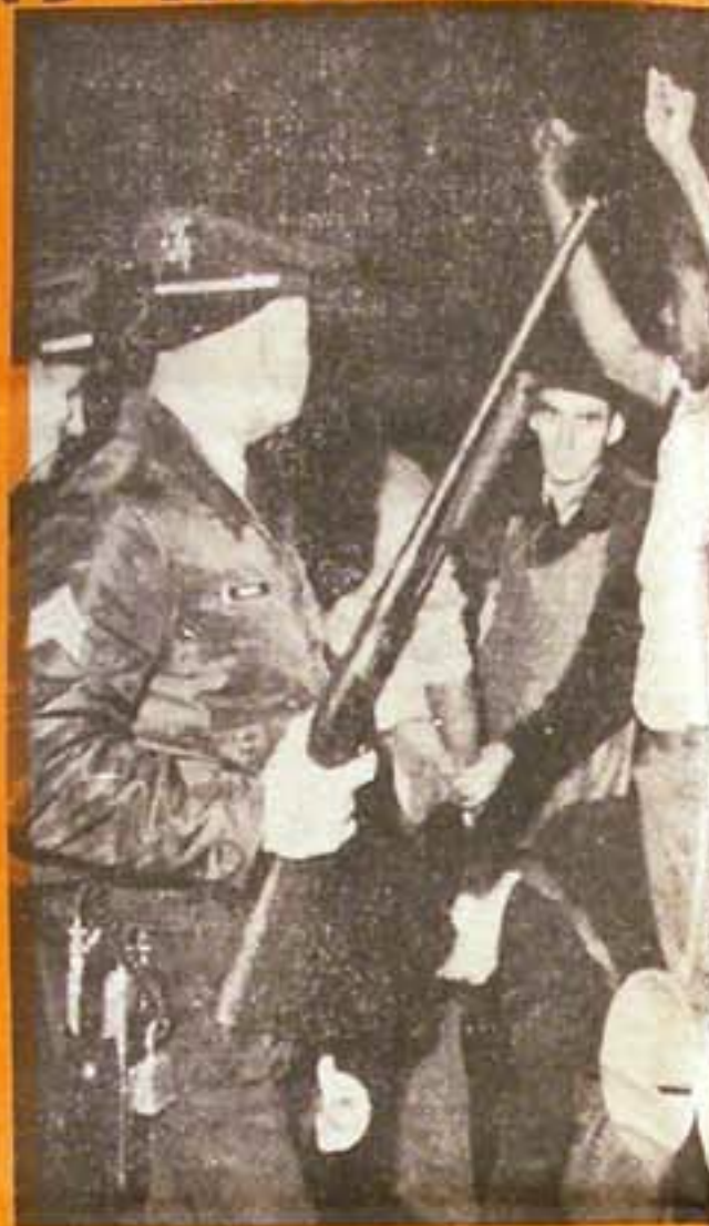
RACIST PIGS WITH SHOTGUNS AND HIGH PRESSURE WATER UNDER ARREST

The Party suffered its most recent attack on Saturday evening, October 24th in Detroit, Michigan. At the end of a pig raid that lasted a total of nine