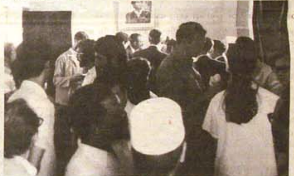
Opening attended by cross section of Liberation Movements