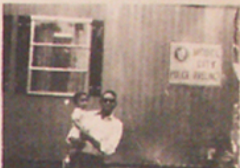
Brother and his child in front of pig mobile station.

These pigs started out by sending out newsletters to the community to store owners telling them that we misuse the money and donations that they give. They accuse us of extorting money from other store owners. To further their sabotage attempts they have started what appears to be a Free Lunch Program in various areas of the community. They pass out surplus food in