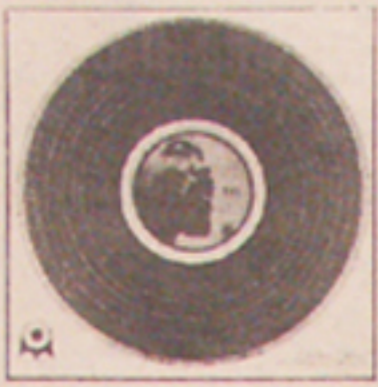
ALBUM--Dig by Eldridge Cleaver, Minister of Information of the Black Panther Party. 3.50 each