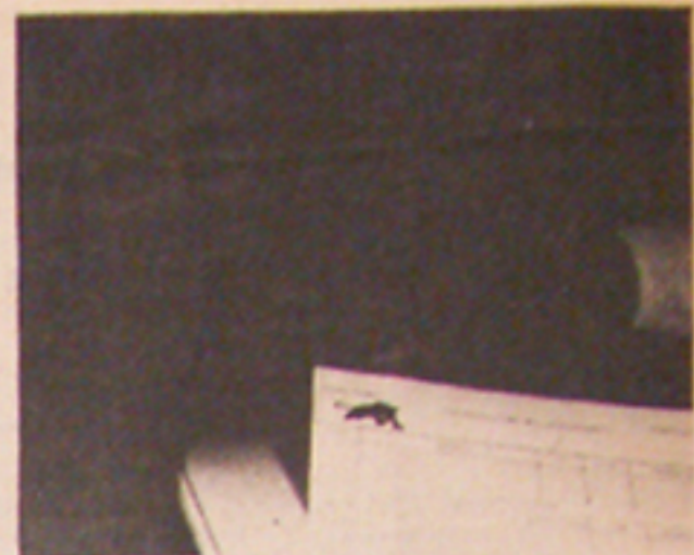
Bullet holes near receptionist desk.