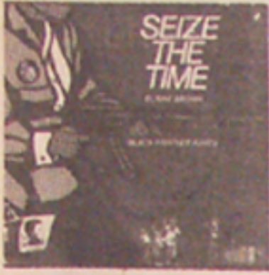
ALBUM -- Seize the Time by Elaine Brown, Black Panther Party. 3.50 each