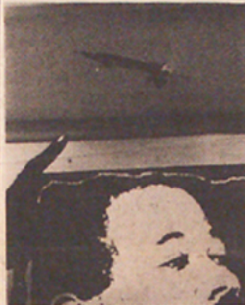
Bullet damage to inside of trailer.

On May 31, 1970, the Boston Chapter of the Black Panther Party opened the Franklin Lynch Peoples Free Health Center for the purpose of serving the people of the Black community.