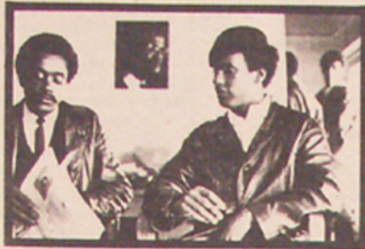
July 1967--Minister of Defense, Huey P. Newton (right) and Chairman, Bobby Seale (left), reading an early edition of B.P.P. Newspaper at the home of Eldridge Cleaver, Minister of Information B.P.P.

Huey would say, "a newspaper is the voice of a party, the voice of the Panther must be heard throughout the land."