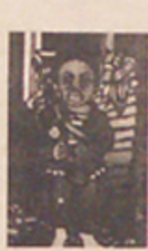
Free Huey .10 each