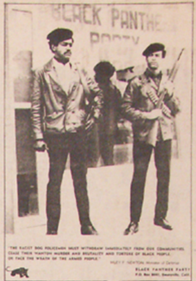
Chairman Bobby Seale, and Minister of Defense Huey P. Newton 1.00 each

"You can jail a revolutionary but you can't jail the revolution. You can run a freedom fighter around the country, but you can't run freedom fighting around the country. You can murder a liberator but you can't murder liberation." -- Fred Hampton, Deputy Chairman, III Chapter of the Black Panther Party -- Born: August 30, 1948. Murdered by fascist pigs: December 4, 1969. .25 each