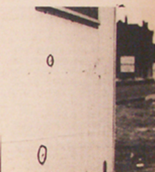
Bullet hole in exit in patient examining area.

continue to operate the Franklin Peoples Free Health Center, and with the help and cooperation of the community, we hope to expand our present facilities. This is truly socialism at work because we are moving in a collective manner to solve our collective problems with a community based and community operated program aimed at meeting the