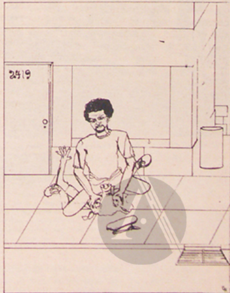
NO MORE PIGS IN OUR COMMUNITY