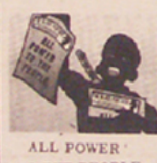
ALL POWER TO THE PEOPLE .10 each

One of our main purposes is to unite our brothers and sisters in the North with our brothers and sisters in the South. .10 each