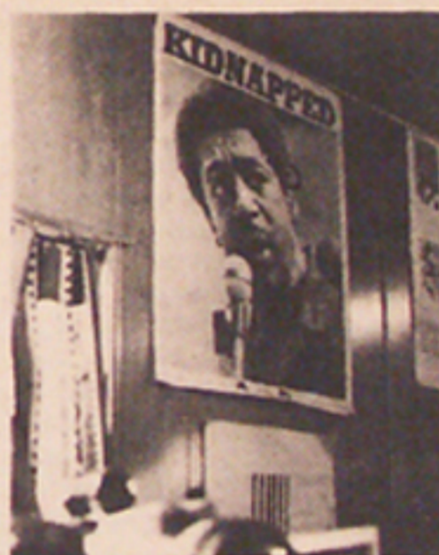
Bullet hole in laboratory

During the morning hours of Sunday, July 5th, thirteen shots were fired into the trailer that houses the Franklin Lynch Peoples Free Health Center, located at Tremont and Ruggles St. Several of the bullets passed through both sides of the trailer, but two bullets were recovered, revealing that the caliber weapon used was, a .38 special, the type of handgun that Boston's Finest Pork are known to carry on their hip. The damage done was minimal, and the Peoples Free Health Center was open on Sunday as usual. Many community people came to investigate and to ask questions about the shooting. The people were concerned about their Health Center, and were angry that some