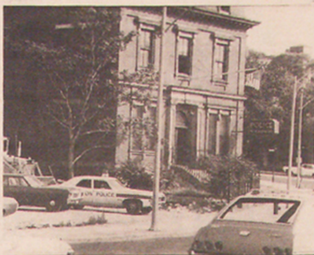
The people vamp on pig station No. 10.

It is a historical fact that when aggression and genocide is carried out on a people over a prolonged period of time, the people will inevitably strike a death blow to the oppressor through resistance which will equal the aggression. Such was the case on Saturday, June 20. The Roxbury Crossing Pig Station (Station 10) was hit with a barrage of bullets, some entering the windows of the Detectives' room and lodging in the wall, and others bouncing off the brick wall. Pig Detectives headed by Lt. Raymond Clifford, conducted an investigation which turned up nine spent cartridges on the roof of a five story brick building, several blocks from the pig station. The shells were said to have come from a British-made WW Super 303 rifle.