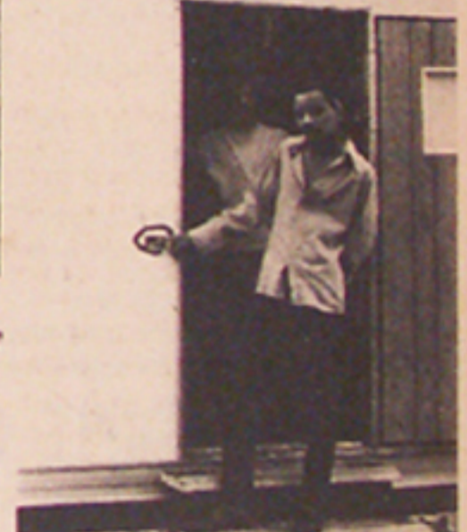
Member of community points out bullet hole.

continue to operate the Franklin Peoples Free Health Center, and with the help and cooperation of the community, we hope to expand our present facilities. This is truly socialism at work because we are moving in a collective manner to solve our collective problems with a community based and community operated program aimed at meeting the