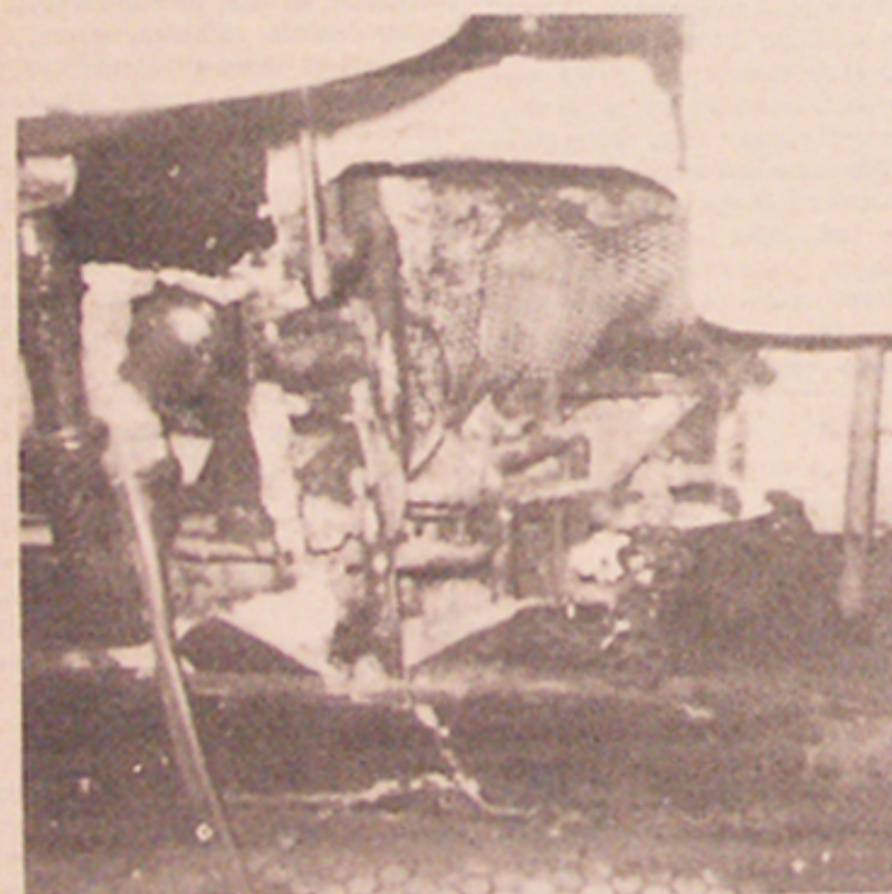
A close up of rats paradise. This is one of many holes where they emerge from.