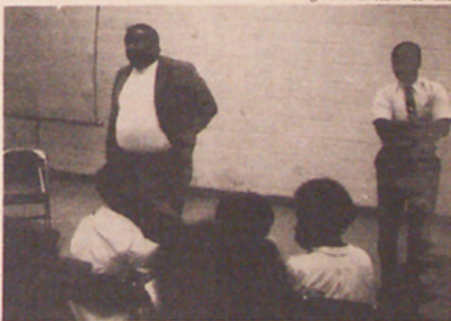
In their deceptive act, Pigs show movies to the people to pacify the people's struggle.

Black people to gain their freedom. We buy food and pay rent when we are able to, for the people in the community when they find themselves and their family in a desperate situation, about to go hungry or their welfare checks late. Once a month we assist the forgotten senior citizens get their groceries from the stores and take them home.