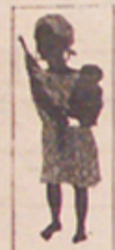
Revolutionary Mother and Child .10 each