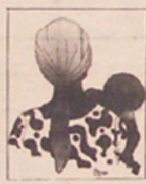
"Hope" .10 each