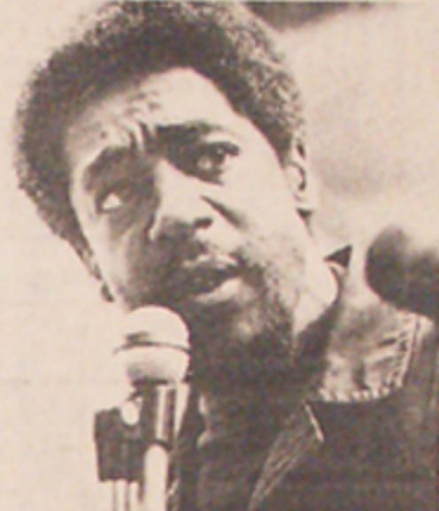
Chairman Bobby Seale, Black Panther Party 1.00 each