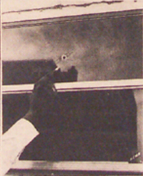
Bullet entrance in patient examining room window.

Black people can definitely relate to a Free Health Center, where we can go to have our medical needs met without going through all of the waiting, form signing and red tape that are