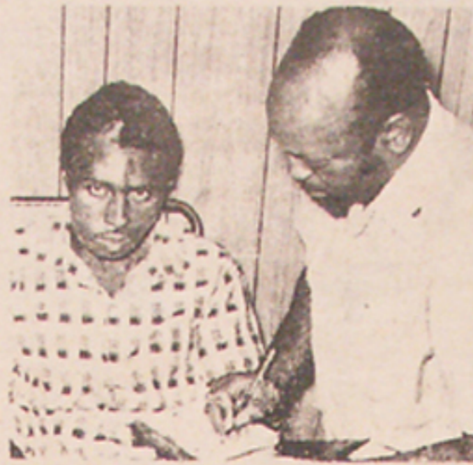
#7 WE WANT AN IMMEDIATE END TO POLICE BRUTALITY AND MURDER OF BLACK PEOPLE.