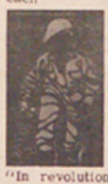
"In revolution one wins or one dies." .10 each