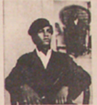
Huey P. Newton, Minister of Defense, Black Panther Party 1.00 each