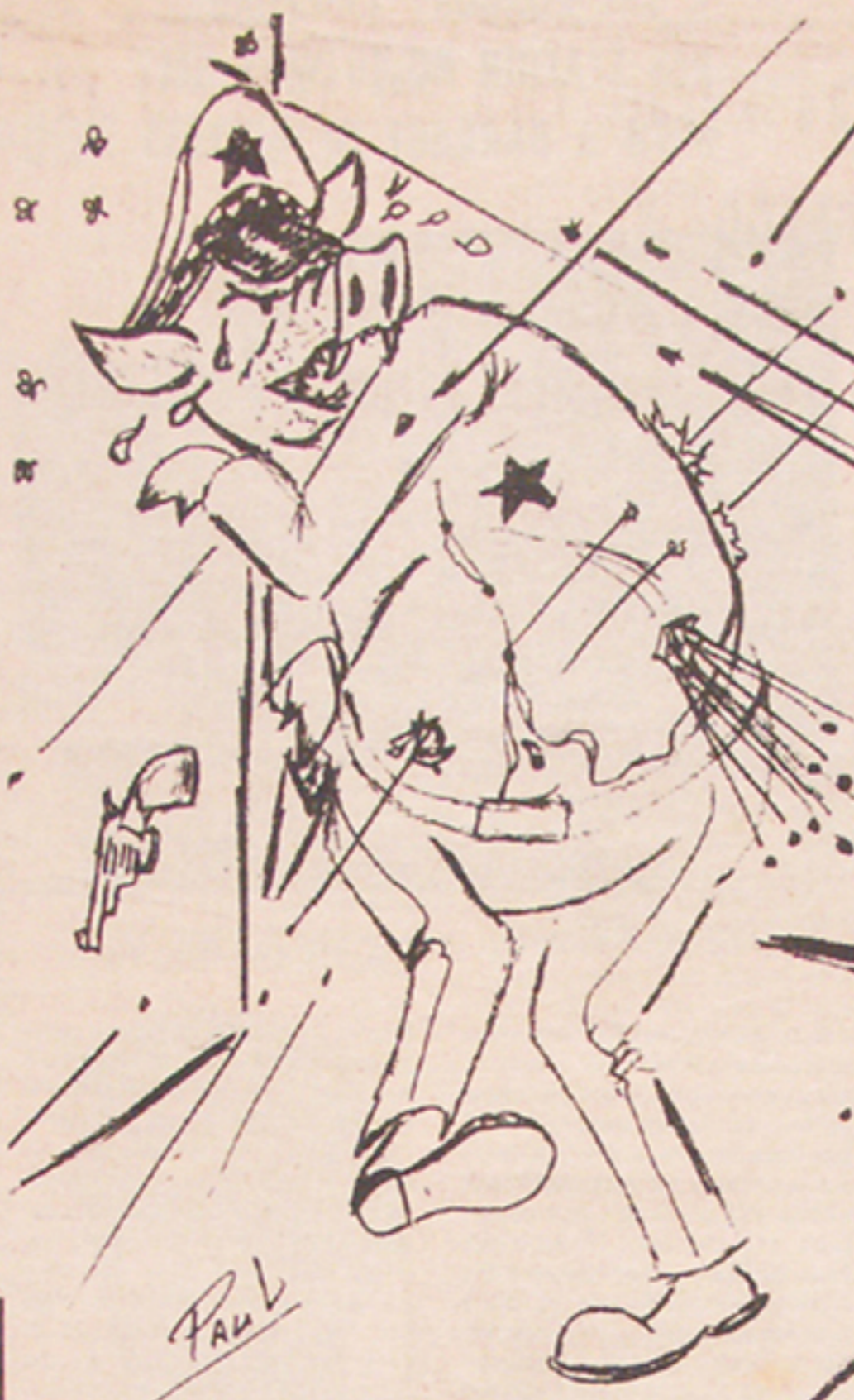
DEATH TO THE FASCIST PIGS!