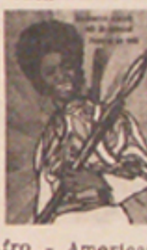
Afro - American solidarity with the oppressed people of the world .10 each