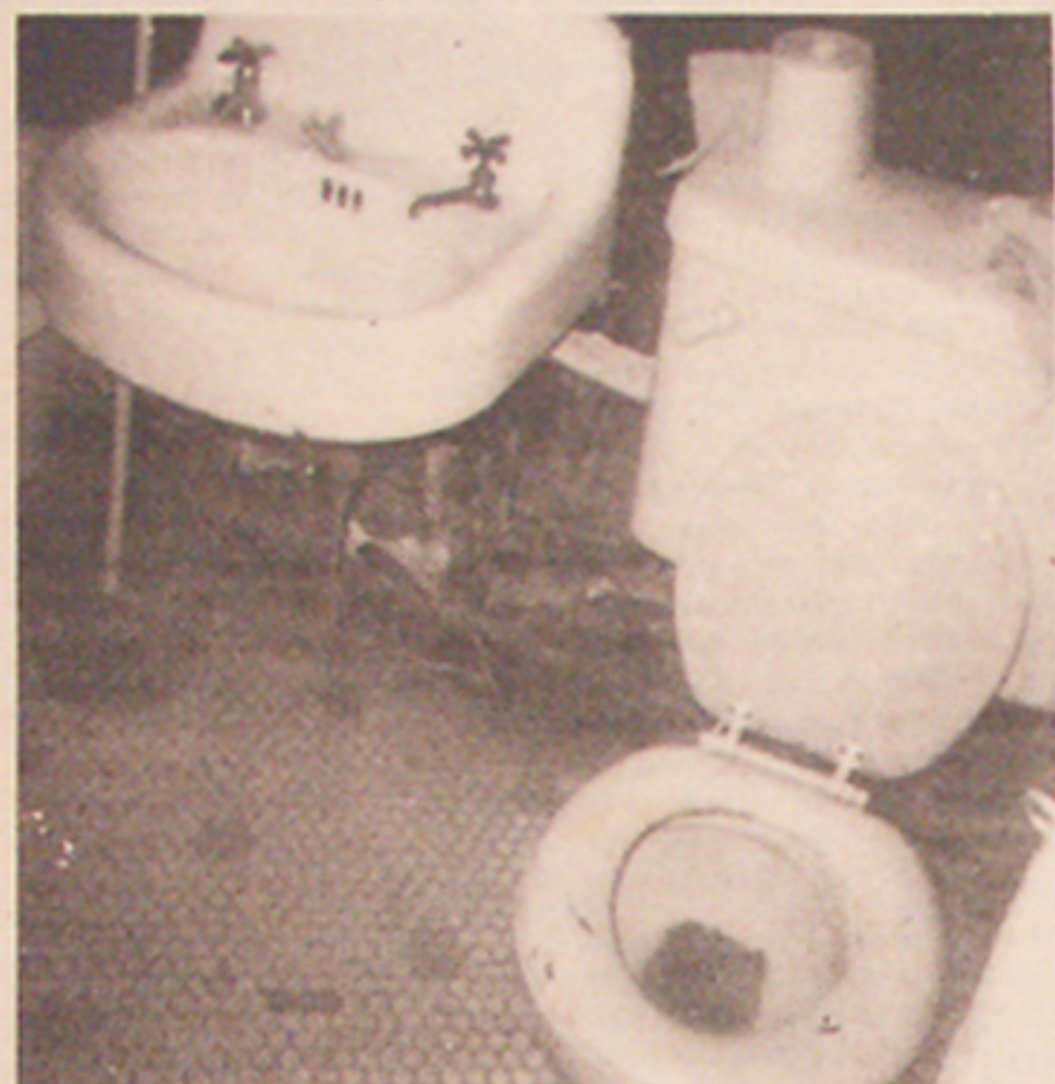
One of many bathrooms with rat holes under sinks. (Rats paradise).

Further investigation showed that the lowest rent being paid was $85 and the highest $110. We say that under present conditions the rent isn't worth $20.