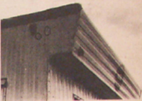
Bullet hole in patient examining area.