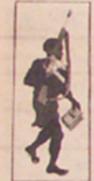
Black Studies .10 each

"Wherever death may surprise us, it will be welcome, provided that this, our battle cry, reach some receptive ear, that another hand stretch out to take up weapons and that other men come forward to intone our funeral dirge with the staccato of machine guns and new cries of battle and victory." -- Che Guevara .10 each