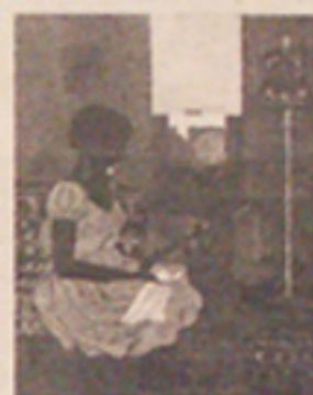
"Each one teach one" .10 each