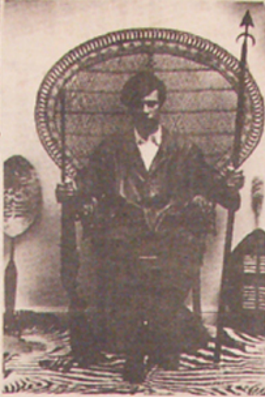
Huey P. Newton, Minister of Defense, Black Panther Party 1.00 each