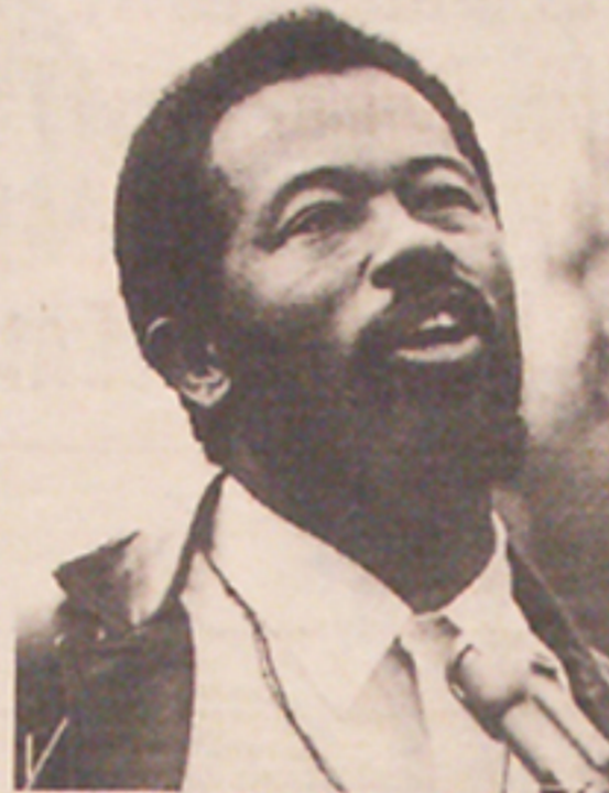
Eldridge Cleaver, Minister of Information, Black Panther Party 1.00 each