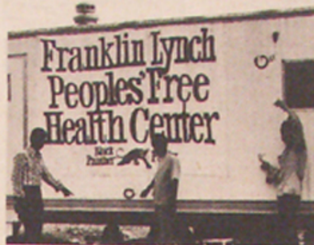
People point out some of the bullet holes.

On May 31, 1970, the Boston Chapter of the Black Panther Party opened the Franklin Lynch Peoples Free Health Center for the purpose of serving the people of the Black community.