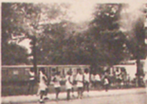
Pigs use deceptive measures to sabotage revolutionary actions of the N.C.C.F.

The Black Panther Party has always served the people. The Black Panther Party members have strove continuously to help the people get their basic needs and desires and have been an oxen to be ridden by the people. The Black Panther Party is a people's Party and exists because it is truly a Party that is of the people, by the people and for the people. The Party is made up of the people, therefore it is manifested in the people, making the people and the Party one-in-one and the same.