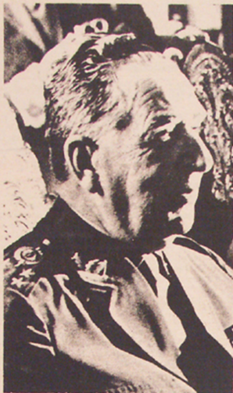
FASCIST BRAZILIAN PRESIDENT EMILIO GARRASTAZU MEDICI