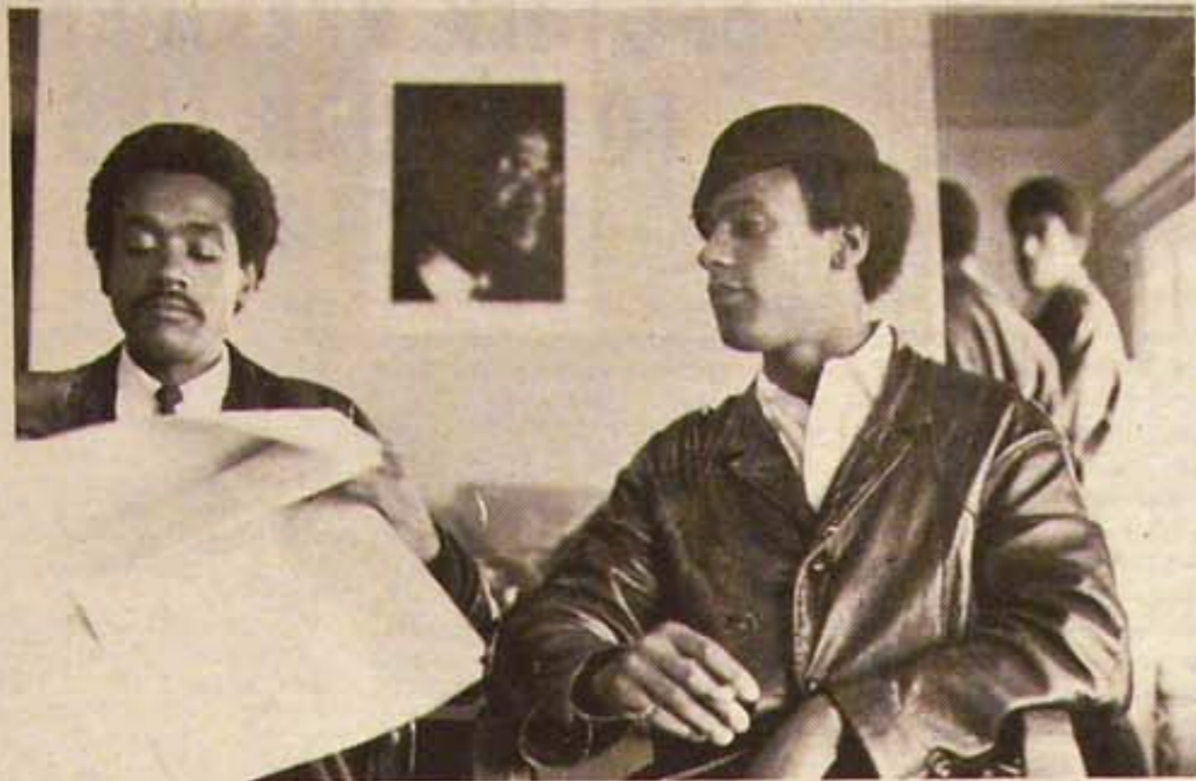
Chairman Bobby Seale, and Minister of Defense Huey P. Newton.