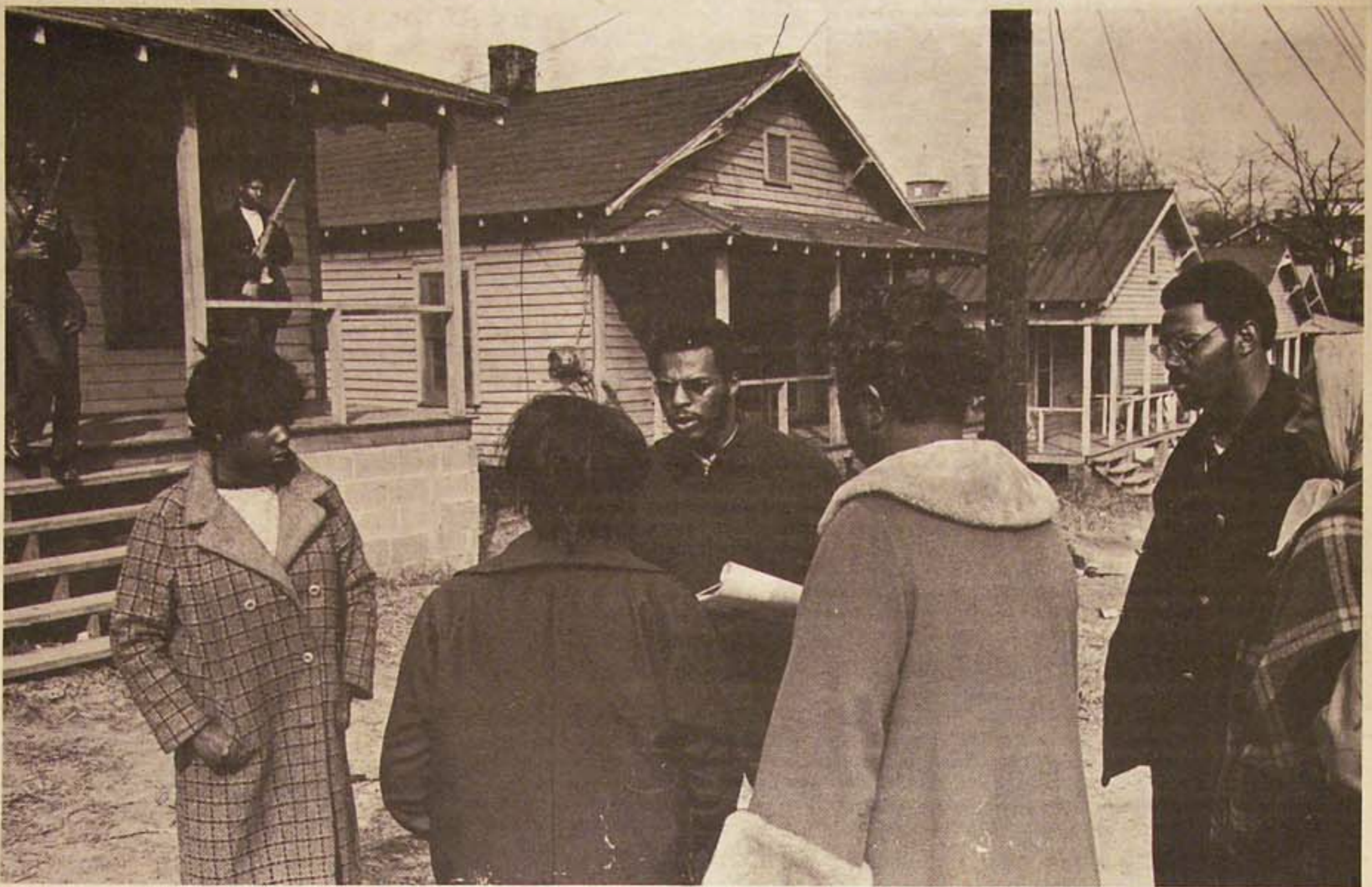
THE PEOPLE OF NORTH CAROLINA ARE READY TO DEAL WITH SLUMLORDS.