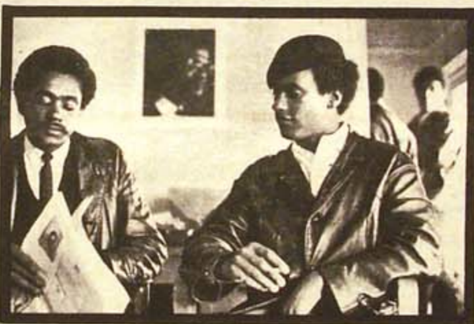
July 1967--Minister of Defense, Huey P. Newton (right) and Chairman, Bobby Seale (left), reading an early edition of B.P.P. Newspaper at the home of Eldridge Cleaver, Minister of Information B.P.P.

The Black Panther Party Black Community News Service is the alternative to the 'government ap-