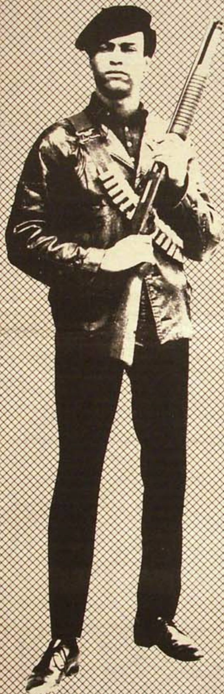
Huey P. Newton Minister of Defense Black Panther Party

1. We want freedom. We want power to determine the destiny of our Black Community.