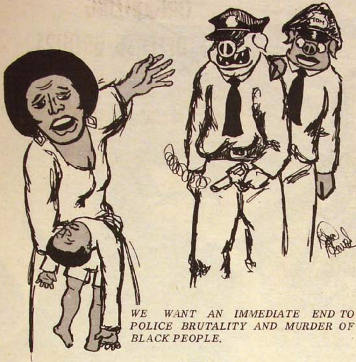
WE WANT AN IMMEDIATE END TO POLICE BRUTALITY AND MURDER OF BLACK PEOPLE.