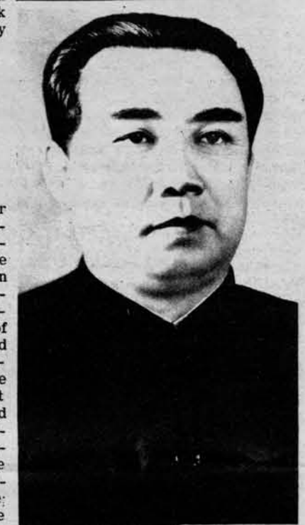
KIM IL SUNG

The Panthers and their lawyer, Garry, have vowed to fight these additional pernicious attempts to crush the Black Panther Party. The greatest possible support is needed to carry out this fight.