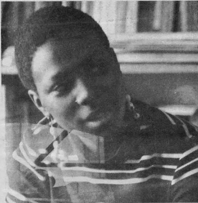
AFENI SHAKUR - N. Y. 21

The week of February 2-5 marked the beginning of what will probably be one of the best satires on ameriKKkan justice in the history of fascism. The plot, scenes, and characters of this mock trial are described below.