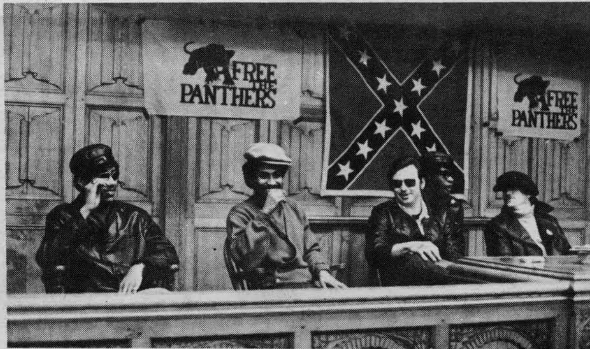
SOLIDARITY BETWEEN THE BLACK PANTHER PARTY AND THE PATRIOT PARTY

rather relate to some old bar-room friends than the masses of the people. So, a few of the Y.P.O. members said "we've got to move with the people. We can't relate to old friends that are actually hurting our people." We knew that a revolutionary Party could not tail behind the people, but has to lead, and show the people by example. So we left the Y.P.O. and formed the Patriot Party. Let it be clear that we did not leave the people of Uptown Chicago, only