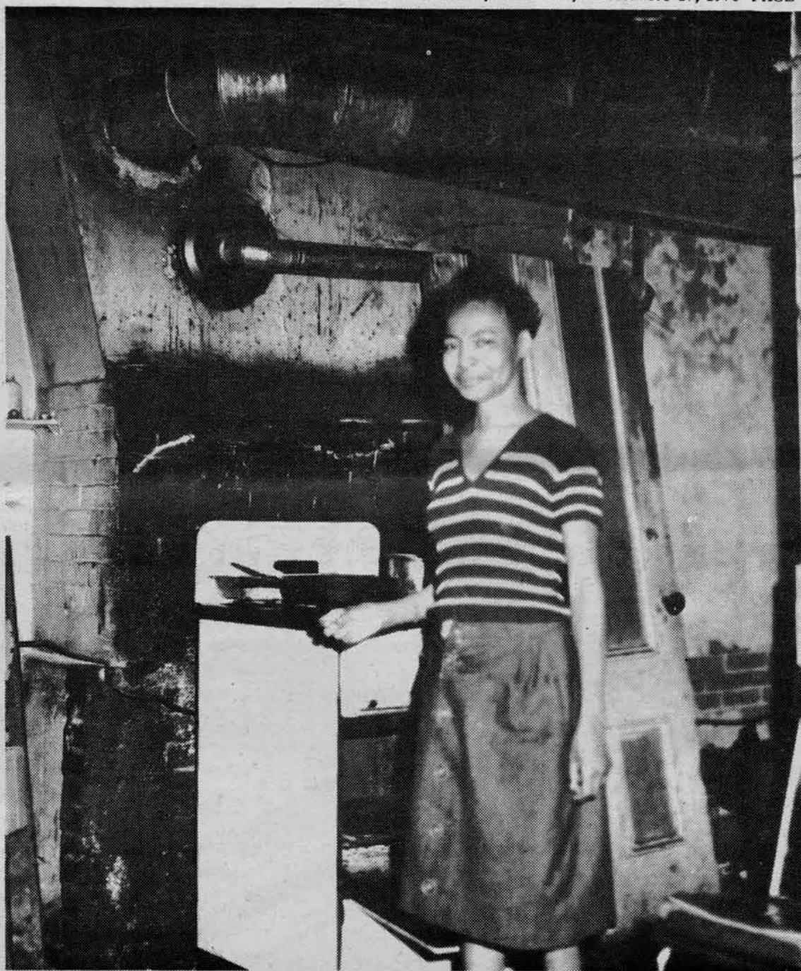
Point No. 4. We want decent housing, fit for shelter of human beings.

REVOLUTION IN OUR LIFETIME BLACK PANTHER PARTY Boston Chapter