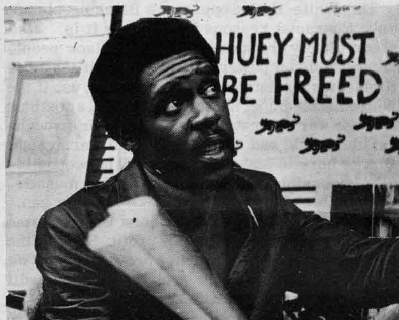
DAVID HILLIARD, CHIEF OF STAFF, BLACK PANTHER PARTY