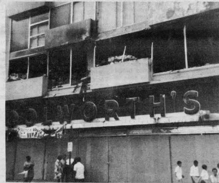
IN PUERTO RICO, STORE BLOWN UP BY REVOLUTIONARIES

ROLAND: Was it just the motivation of one cat that brought about the change or was it a lot of different cats?