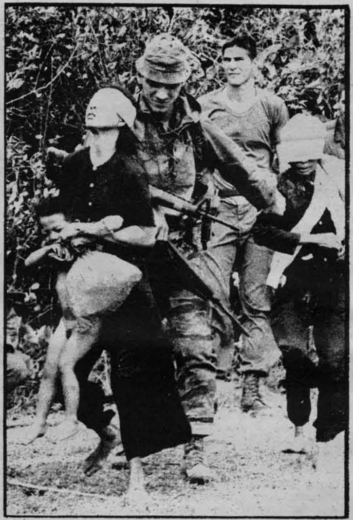
U.S. TACTICS IN VIETNAM

Along with these criminal acts, the Thieu Ky Khiem administration tries its best to press gang young men and wrest property from the population