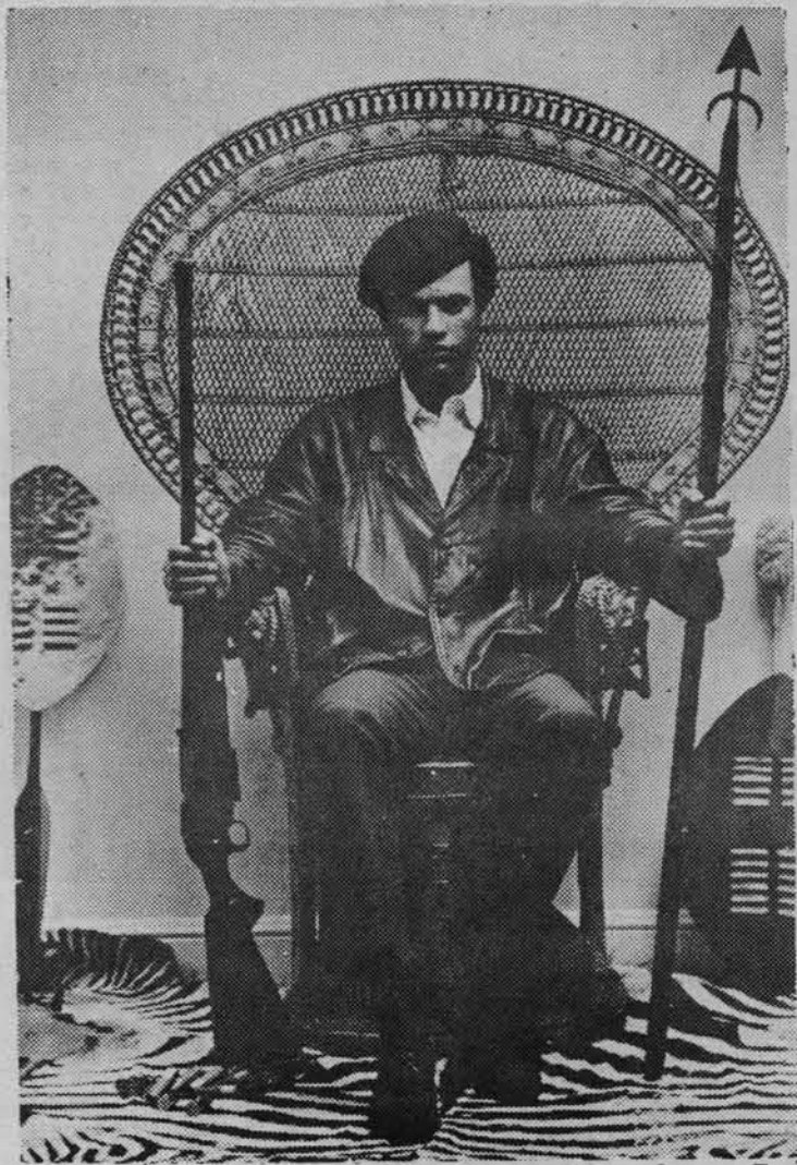
HUEY P. NEWTON, MINISTER OF DEFENSE BLACK PANTHER PARTY

Many would-be Black capitalists do not understand the relationship of the Black bourgeoisie to the military - industrial complex controlling this nation's economy. Most of the Black bourgeoisie class is made up of people who are in professions such as education, social service and the like. They are also controlled subjects of the military-industrial complex and have to follow the orders of the rulers.