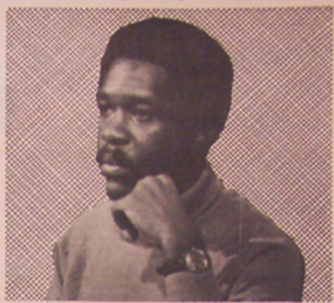
DAVID HILLIARD, CHIEF OF STAFF, BLACK PANTHER PARTY

Plaintiff by way of verified complaint, alleges: