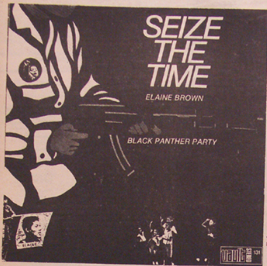
Designed By Emcoy