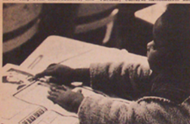
LITTLE SISTER LEARNS ABOUT HUEY, BECAUSE HE MADE LIBERATION SCHOOL POSSIBLE.

Liberation School started last summer, and was from Monday through Friday, since the schools have started again, we are only able to have classes once a week on Saturday. Many of the sisters and brothers that attend classes now have been participating since the beginning. The ages range from 2 to 13 in the S. F. Branch, and we have some very heavy 2 and 3 year old students. We relate to each other as one big family. Many of the brothers and sisters that have been around since last summer, teach the class. They run down the Ten Point Platform and Program, fascism, capitalism, racism, cultural nationalism and