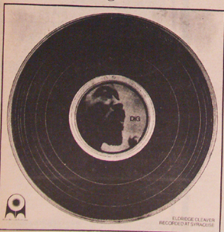
ELDRIDGE CLEAVER RECORDED AT SYRACUSE