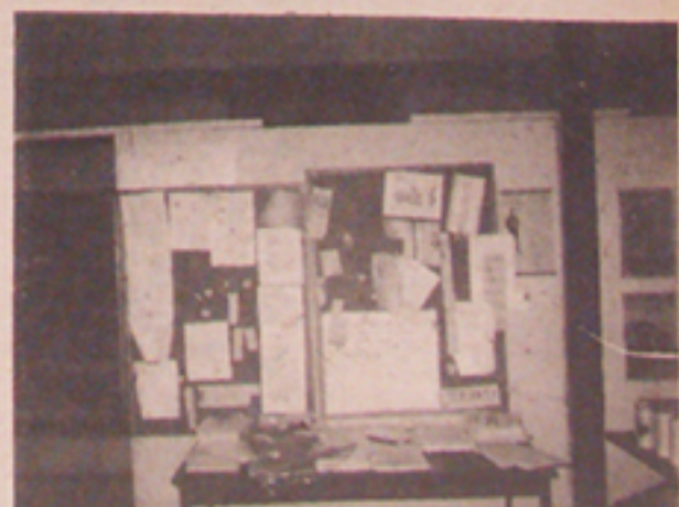
INSIDE OF JERSEY CITY PANTHER OFFICE

By Black people arming themselves from house to house, block to block, community to community all across the country, we can end this systematic genocide that is being perpetrated against Black people by the racist, fascist ameriKKKan government. We believe that Black people should exercise their constitutional rights. It is entirely within the law to get a gun for self-defense. Huey P. Newton, our Minister of Defense, says: