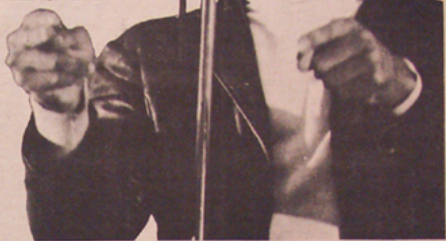
BOBBY SEALE, CHAIRMAN, BLACK PANTHER PARTY POLITICAL PRISONER

For instance, Seale said, 64 per cent of Oakland cops don't live