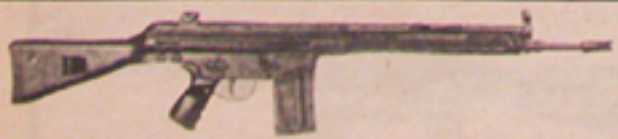
"OUR CHILDREN WILL CARRY ON THE STRUGGLE AND THEIR CHILDREN AFTER THEM IF NECESSARY"