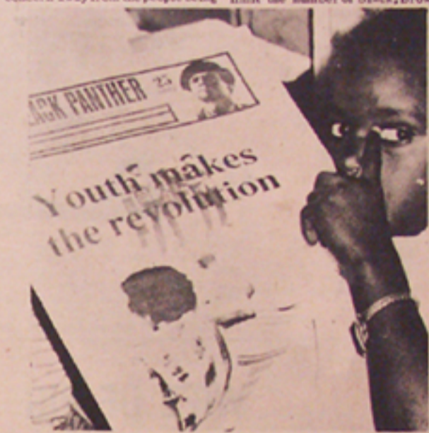
THE CHILDREN WILL GO ON TO COMPLETE GREATER AND MORE GLORIOUS TASKS.

Schools, and Free Health Clinics; these are socialist programs and they point out the fact that, contrary to the messages consistently dished at us, all children can be properly fed and cared for if the people are given control of their own destiny. Contraceptive measures are an attempt to limit the number of Black, Brown,