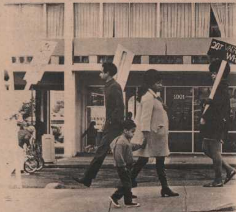
PICKETERS AT GENEVA TOWERS