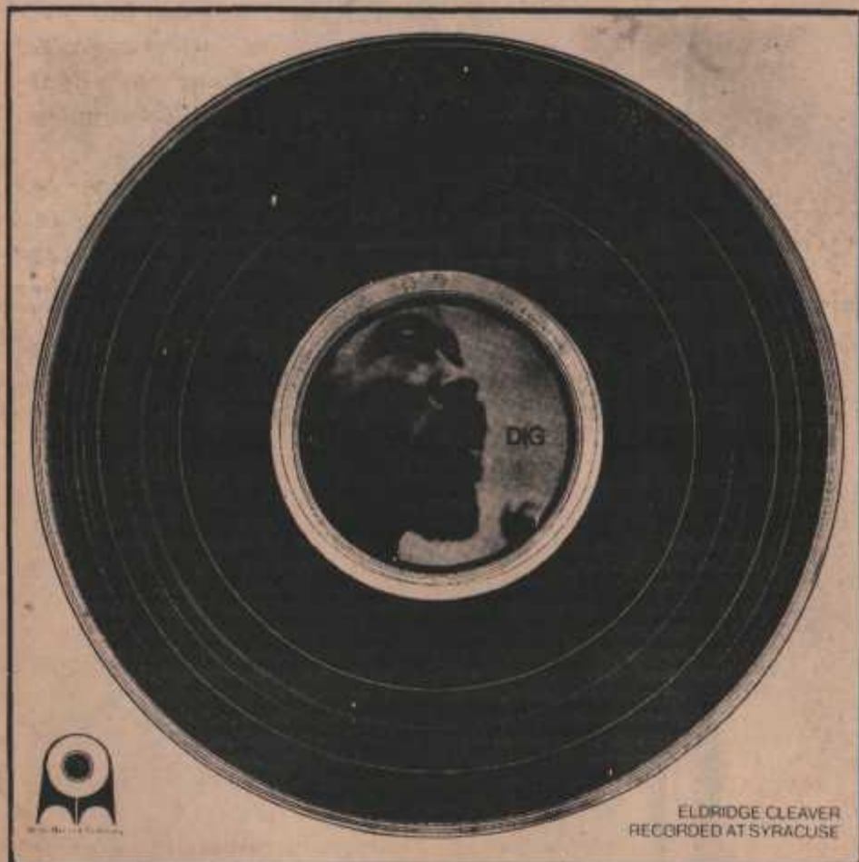
ELDRIDGE CLEAVER RECORDED AT SYRACUSE