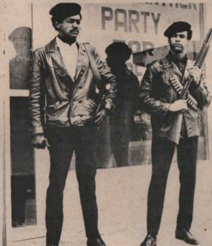
BOBBY SEALE AND HUEY P. NEWTON POLITICAL PRISONERS OF US FASCISM