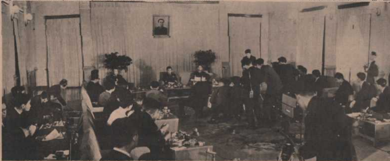
PRESS CONFERENCE — SOUTH KOREAN PILOTS HIJACK PLANE TO NORTH KOREA

as "patriotism" and dependence as "independence", as you know. You must have already heard about the incident of the "Pueblo" and the incident of the spy plane. In the incident of the "Pueblo" and the incident of the spy plane, the U.S. imperialists signed letters of apology for their brigandish, aggressive acts against the northern half of the Republic, and firmly pledged not to perpetrate such acts again. But how did things go? As you know, they have kept committing since then the manoeuvres for the provocation of an aggressive war against the northern half of the Republic. Have you anything to say about this?