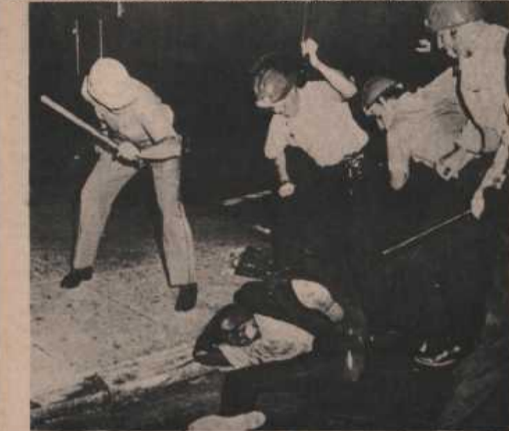
SLAVES WERE FREED BY A PROCLAMATION, NOT BY OVERTHROWING THE SLAVEMASTER -- WHO STILL PRACTICES SLAVERY

Our fight will not be waged without support, but a friend, an ally, can only help with your problems: support is worthless if there is nothing, no action, to sup-