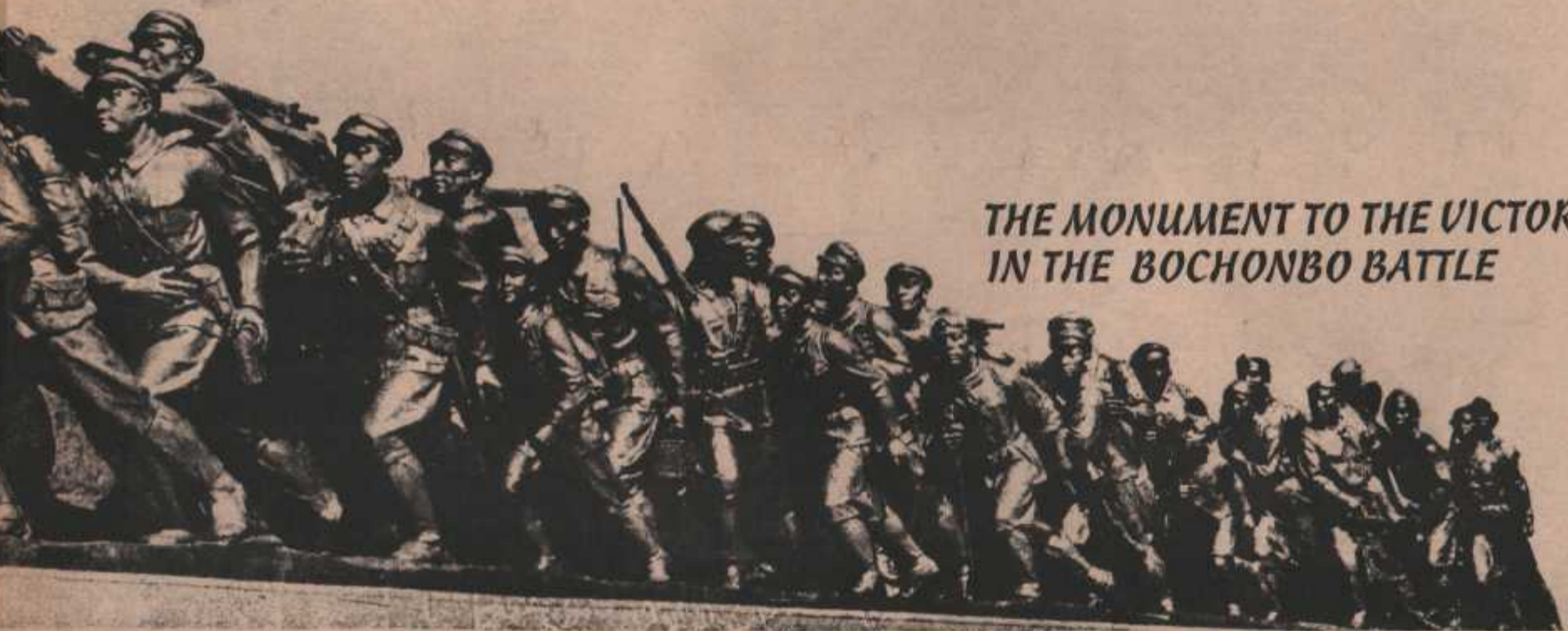
THE MONUMENT TO THE VICTORY IN THE BOCHONBO BATTLE

from generation to generation the great revolutionary ideas and and beloved leader Comrade Kim Il Sung