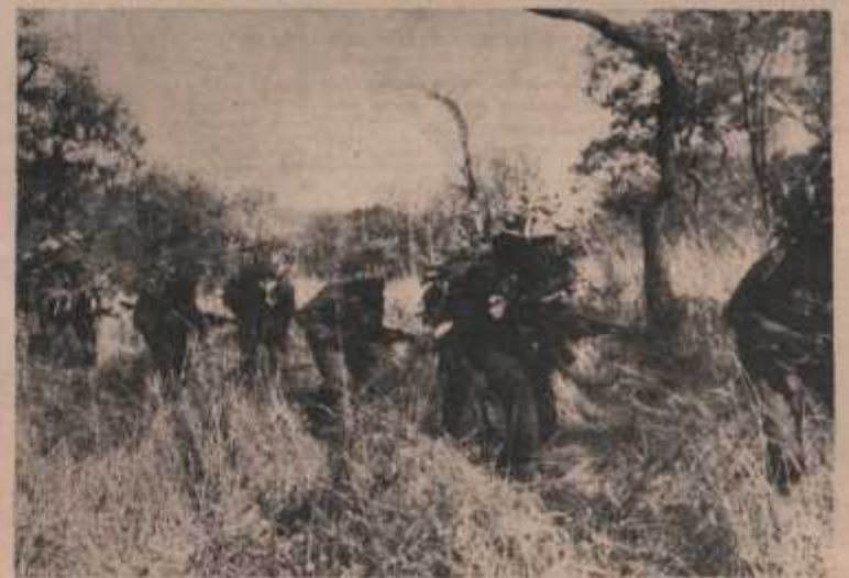
ZIMBABWE LIBERATION FIGHTERS

after all, is a people's struggle, not a platform for ideological diplomats. As such the people, the true heroes of this revolution, have a right to ask themselves the question: What after independence? And those who would seek refuge in militant racism ("We must have our country from the Whitemen") must be exposed with courage for the opportunists they are, because of such stuff are born the wealthy Black bwanas of the era of post independence. What after independence? is a question so crucial it can only be answered