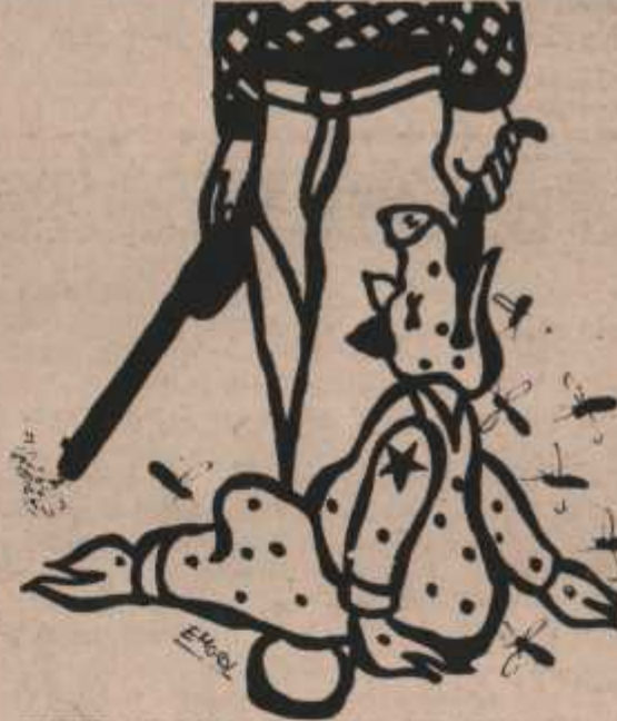
USING SELF-RELIANCE THE MASSES OF BLACK PEOPLE WILL RISE UP AND OVERTHROW THEIR OPPRESSOR

experiences in relation to the people for whom they are a part of history, but taking those things beneficial and rejecting those things unnecessary to our struggle. It has been our history as a people and our situation in the existing society that has brought us to the unique position which we occupy today-- the most oppressed people living in the body of the world's number one oppressor. The Black Panther Party recognizes the merits of con-