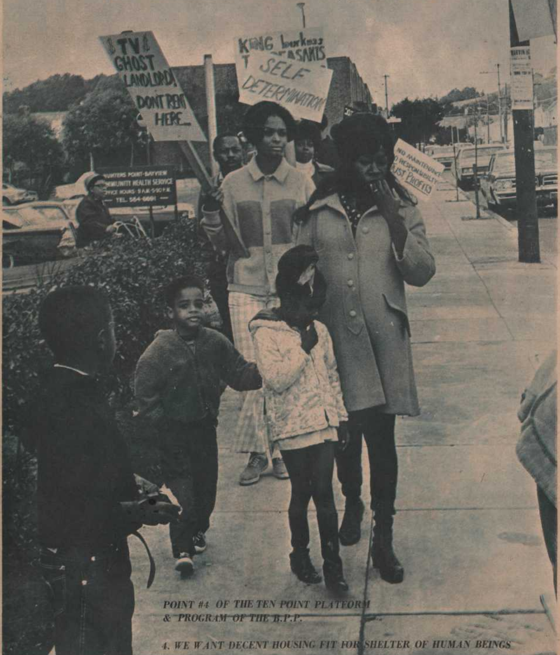
POINT #4 OF THE TEN POINT PLATFORM & PROGRAM OF THE B.P.P.

4. WE WANT DECENT HOUSING FIT FOR SHELTER OF HUMAN BEINGS