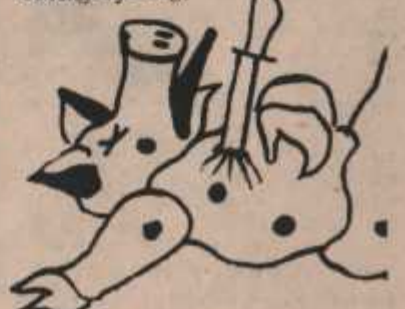
BLACK PANTHER PARTY Minister of Culture Emory Douglas

Revolutionary art is a returning from hell and of the blind, we no longer let the oppressor lead us around acting as our seeing-eye dog.