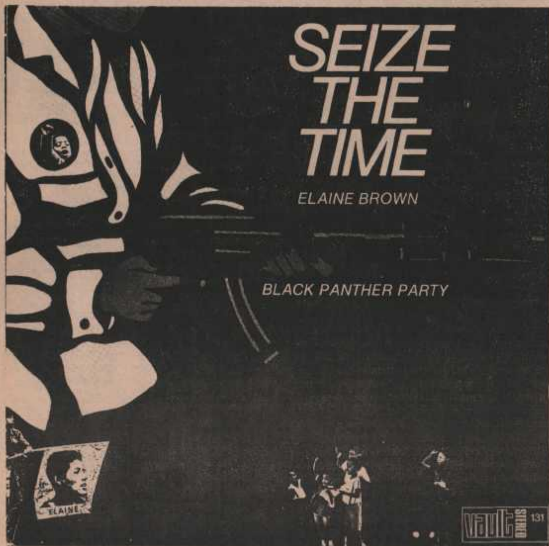
Designed By Emory