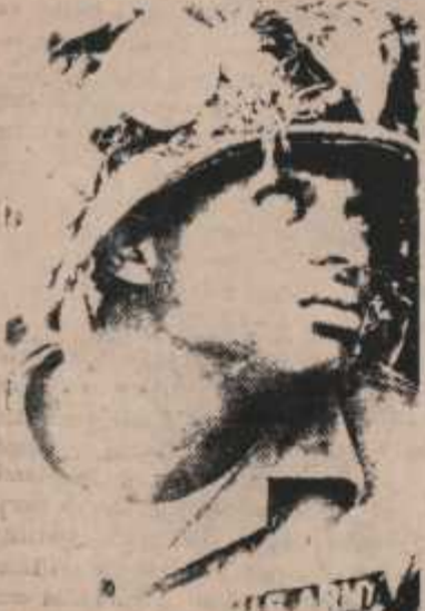
PRISONERS OF WAR FOR POLITICAL PRISONERS

You, the wives of American Prisoners of War, should go to the people that your husbands have been oppressing and beg for forgiveness. The wives and children and love ones of Black Political Prisoners have asked the rulers of this fascist system for justice and they have never received any. ALL POWER TO THE PEOPLE POW'S FOR PANTHERS "ABU" (Shakur) Father of Political Prisoner in