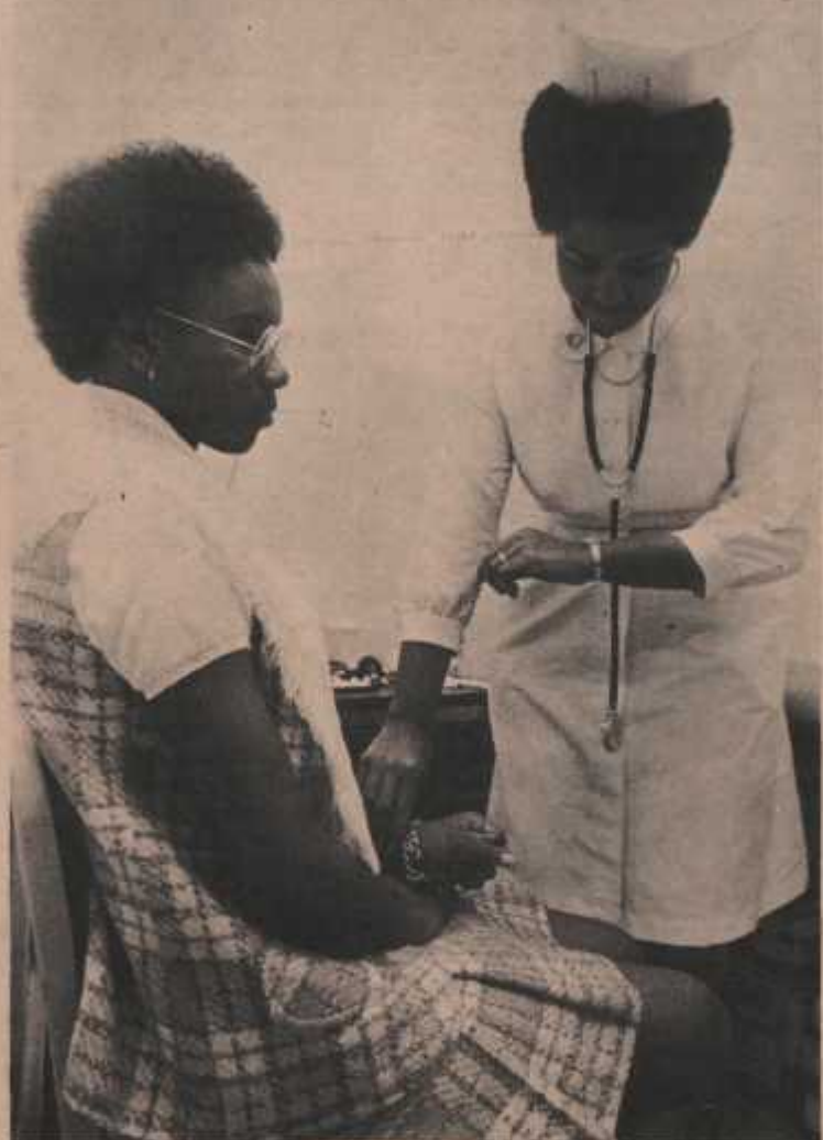
FREE MEDICAL CARE FOR OUR PEOPLE

this as something separate from society at large; this is merely an extension of the genocide being practiced on the streets of this country. If something is not done to stop this brutality at this present level, then the practice of shooting directly into a crowd of unarmed people may be adopted by the "guards" on the streets. The killing of convicted criminals may seem removed from us here who do not live looking out of prison bars, but who knows when prison methods will be used against us. We must move now to halt this type of behavior that shows absolutely no regard for human life on the part of public servants or face the disastrous results. ALL POWER TO THE PEOPLE Judi Douglas