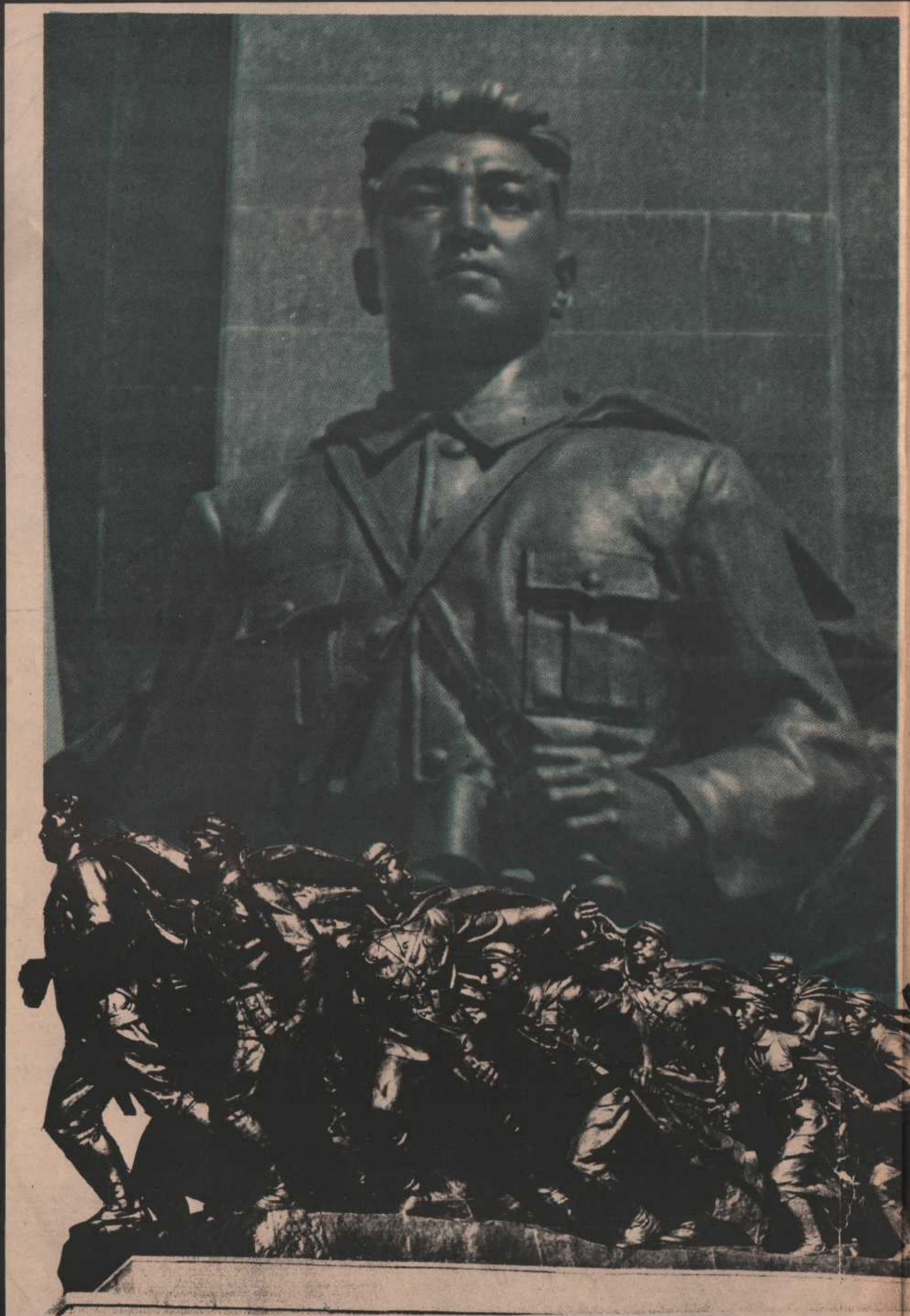
Reflecting the unanimous desire of the entire Korean people to convey immortal revolutionary exploits of the respected