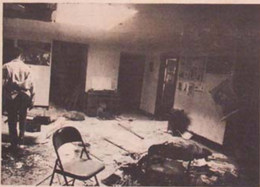
12/8/69 -- L.A., Central Office Meeting Room, After Pig Attack