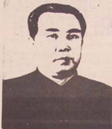
KIM IL SUNG

they plot to sway these countries to the right and detach them from the anti-imperialist front one by one.