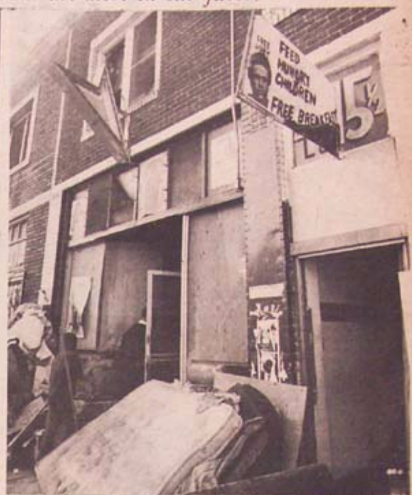
12/9/69 -- L.A., Masses Begin to Enter Central Office