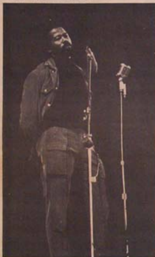
ELDRIDGE CLEAVER MINISTER OF INFORMATION, BPP

Do the American people have a remedy or do we just have to accept this even after it becomes obvious? What are we supposed to do? Do we accept this, do we sit around and watch our comrades being murdered even when it becomes obvious? Do we have no remedy must we accept this? We're not going to accept this, and we say that our comrades must be avenged, and those who are responsible for these vicious murders must be punished and we must have justice."