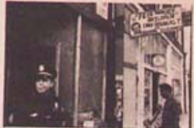
12/8/69 -- L.A., Afternoon, Central Office