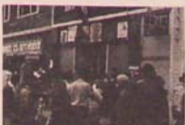
12/10/69 -- L.A., Central Office