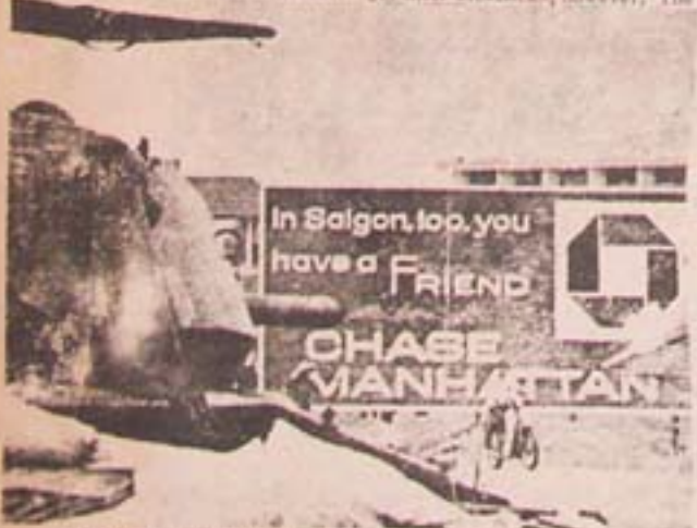
EXPLOITATION BY ROCKEFELLER-- U.S. IMPERIALIST

"The plight of the policeman and his wife -- who must work for the family's survival -- is similar to that of hundreds of Saigon families."