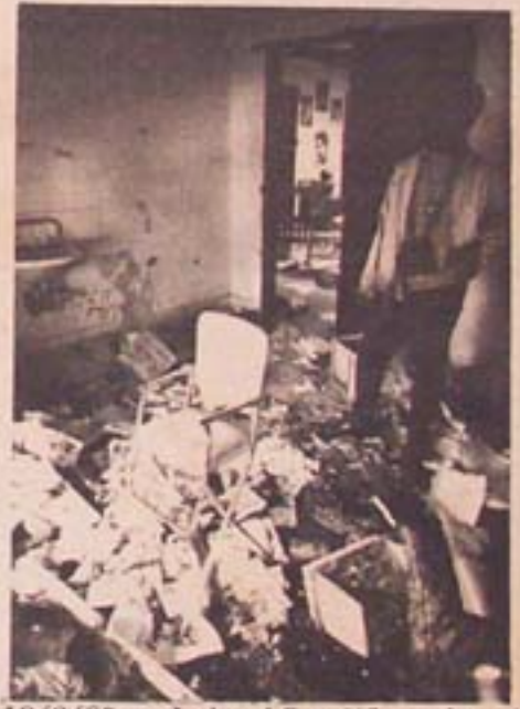
12/8/69 -- L.A., After "Search and Destroy" Mission, Central Office