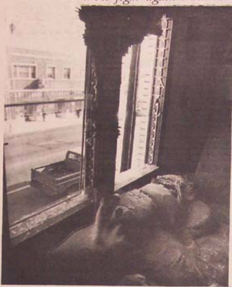
12/8/69 -- L.A., Ministry of Information Rm. After Vamp

"We gave up because it's not the right time. We'll fight again when the odds are more in our favor."