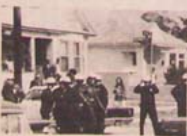
LAPD RUN AMUCK