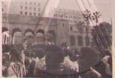
12/10/69 -- L.A., Rally at City Hall