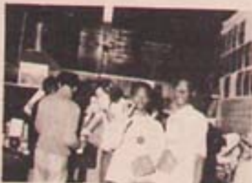
12/9/69 -- L.A., People Enter Central Office