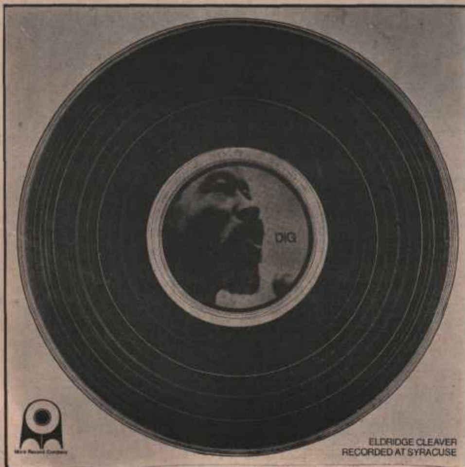
ELDRIDGE CLEAVER RECORDED AT SYRACUSE