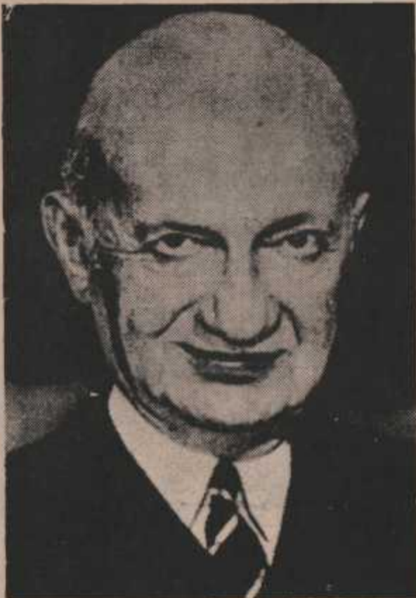
"THE HANGING JUDGE" PIG JULIUS J. HOFFMAN