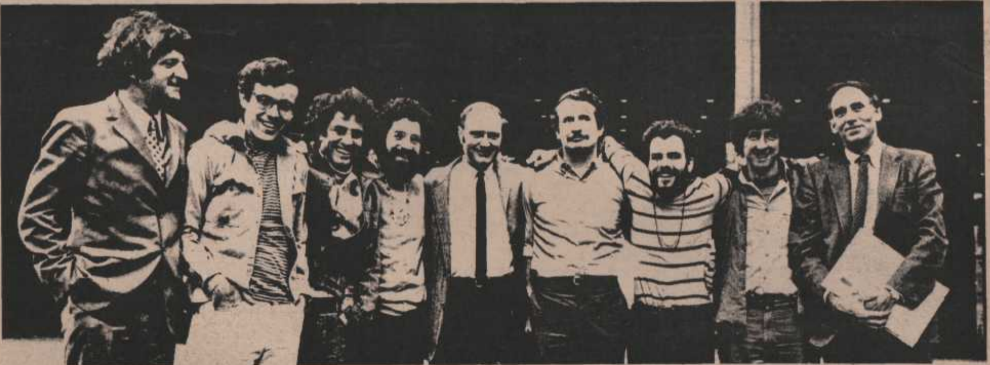
SEVEN OF THE CONSPIRACY 8 WITH ATTORNEYS; LEONARD WEINGLASS (FAR LEFT) AND WILLIAM KUNSTLER (FAR RIGHT).

THE COURT: Ladies and gentlemen of the jury, there remains only a short time in ordinary circumstances before the Court would recess. I have concluded to recess court until two o'clock with my usual order to you, not to talk with anybody about this case, not to let anybody speak with you about it, not to discuss the case among yourselves. If anybody attempts to communicate with you in any manner whatsoever, please comm-