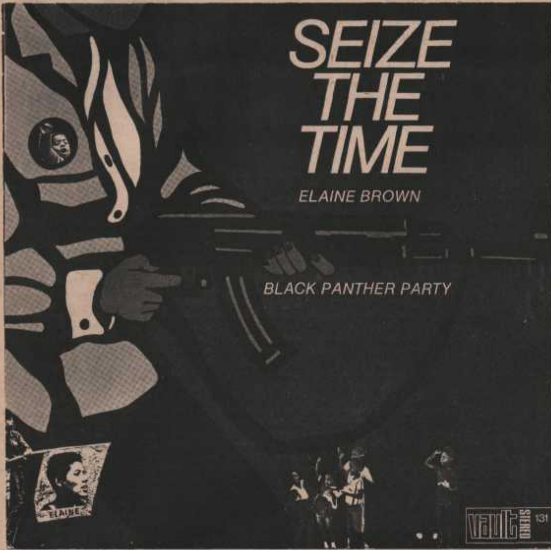
Designed By Emory