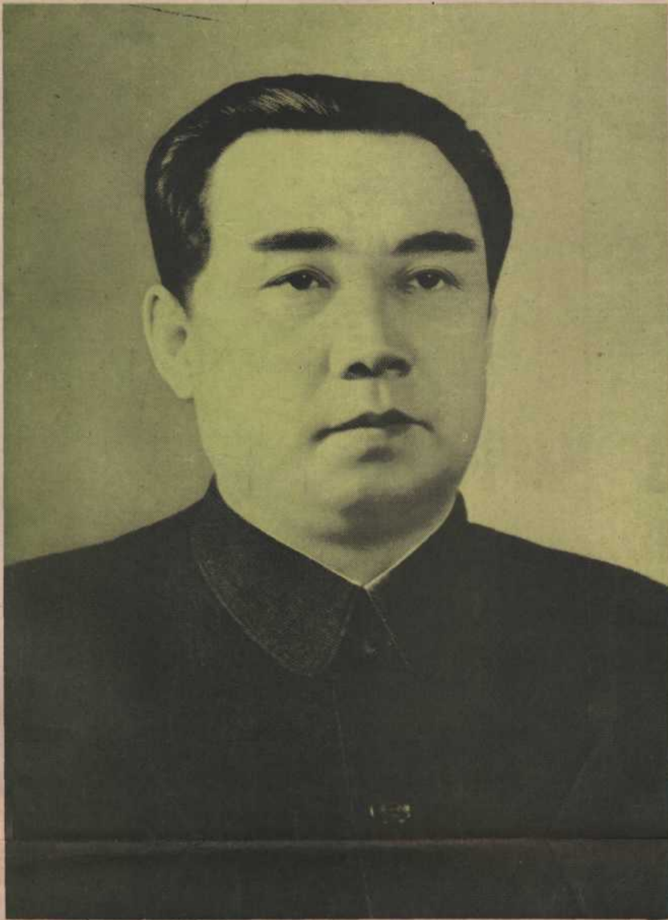
Kim Il Sung