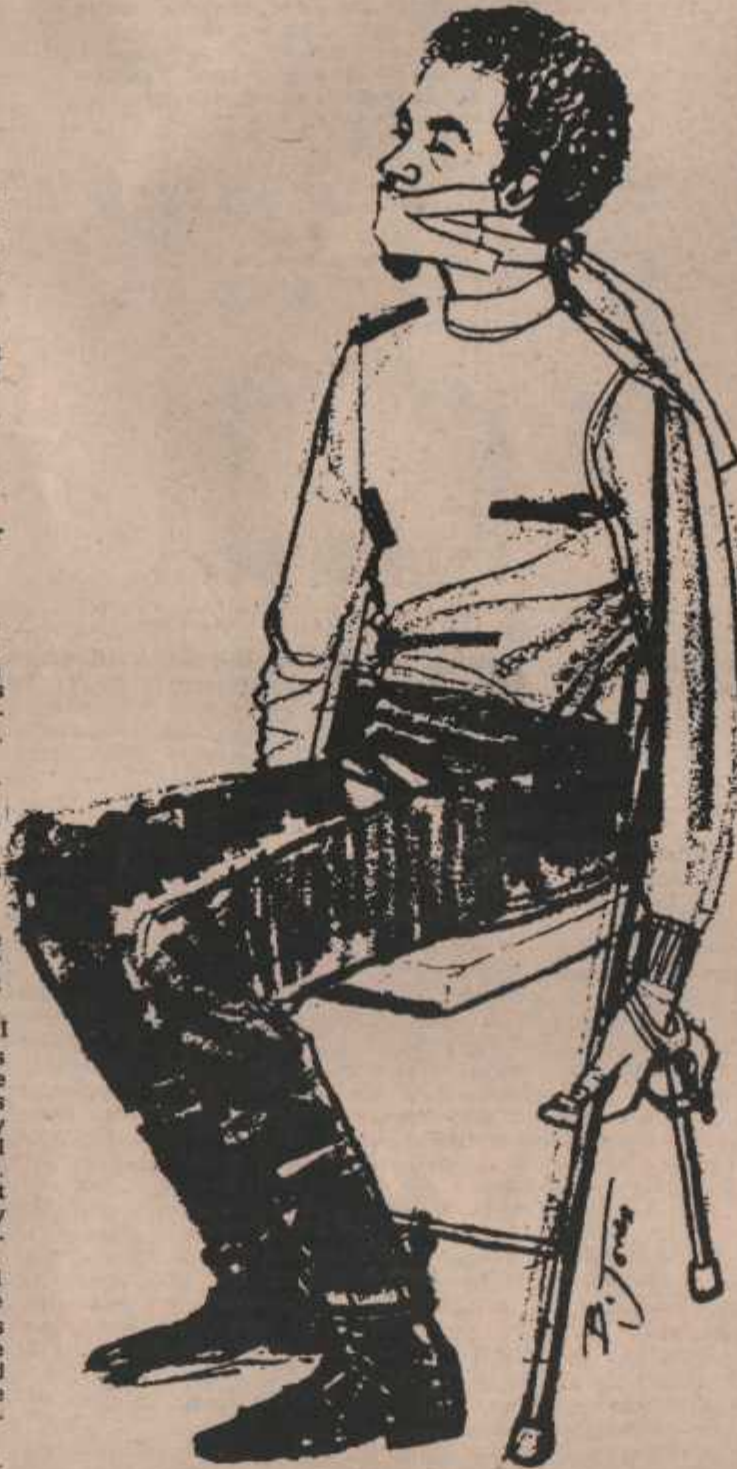
Bobby shackled in fascist courtroom.

MR. WEINGLASS: I think if your Honor is going to instruct the jury it will be that Mr. Seale continues to assert that he has the constitutional right to defend himself and that is why he is in shackles and that is why he is gagged.