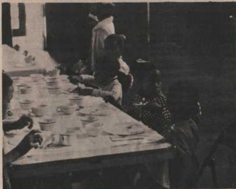
Youth Make the Revolution!!!

ALL POWER TO THE YOUTH San Francisco Branch, Black Panther Party