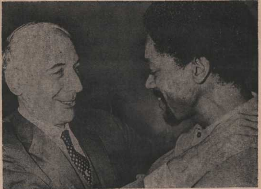
CHARLES GARRY & BOBBY SEALE AT S.F. COUNTY JAIL