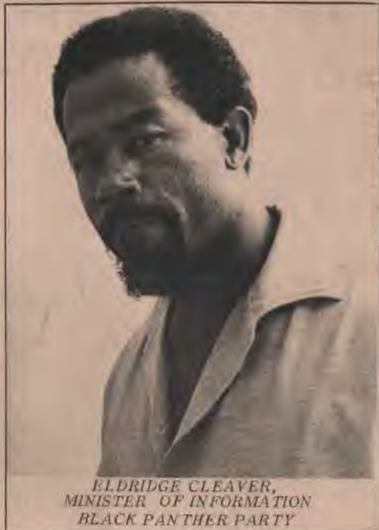
ELDRIDGE CLEAVER, MINISTER OF INFORMATION BLACK PANTHER PARTY

In times of revolution, just wars and wars of liberation, I love the angels of destruction and disorder as opposed to the devils of conservation and law-and-order. Fuck all those who block the revolution with rhetoric—revolutionary rhetoric or counter-revolutionary rhetoric.