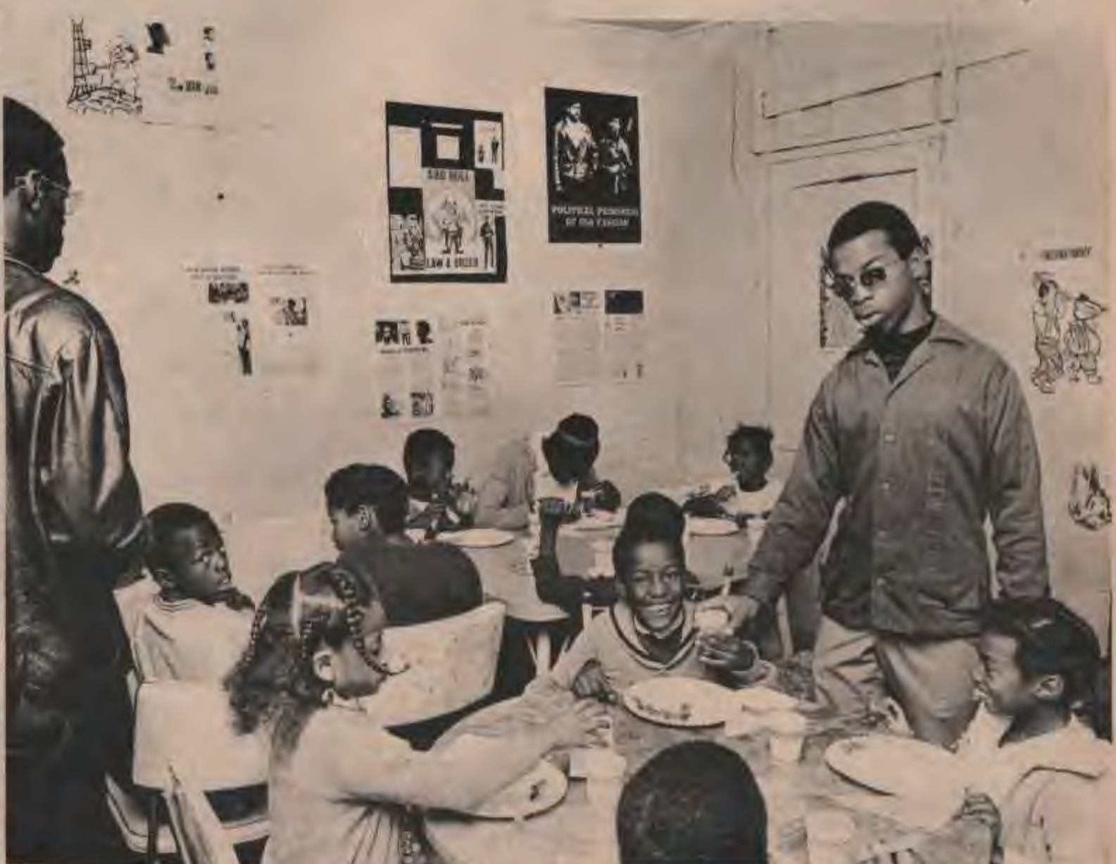
N. C. Branch of the National Committee to Combat Fascism Feeds Our Children.

The Black Panther Party, for simply trying to meet the needs of the poor oppressed people. And for educating the people by example