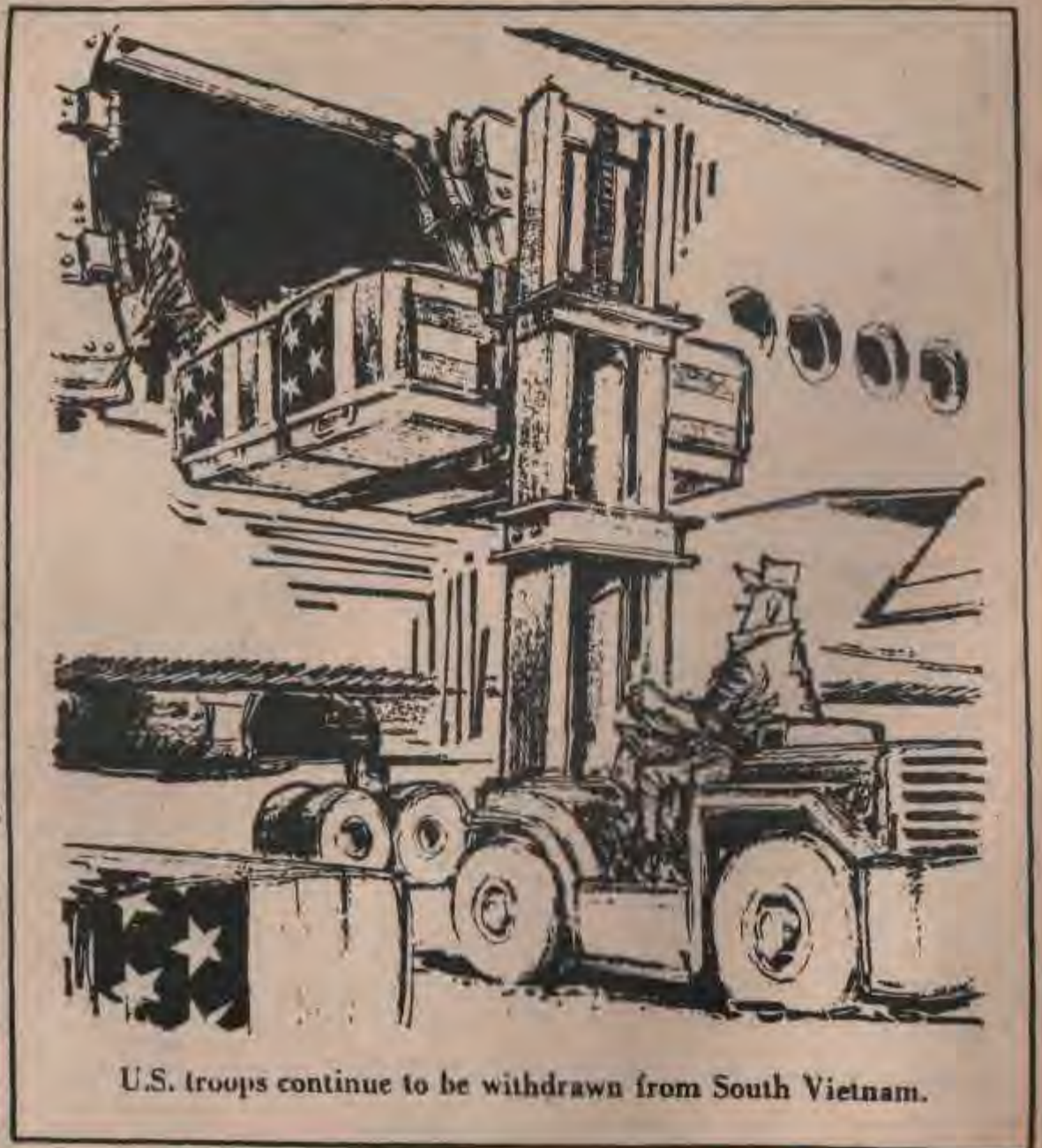
U.S. troops continue to be withdrawn from South Vietnam.

Mr. Nixon calls on "both sides to turn their faces towards peace". Yet up to now, the people and the Provisional Revolutionary Government of the Republic of South Viet Nam have spared no effort in the search for a correct and peaceful solution to the South Viet Nam problem. It is only the United States which has turned its back on peace, by prolonging and intensifying its war of aggression. This is why, the U.S. is the only one that must "turn its face to peace". Let it renounce its wicked design of aggression and its out-dated deceitful trickery of peace! It must give a serious response to the 10-point overall solution of the National Front for Liberation and the Provisional Revolutionary Government of the Republic of South Viet Nam. Only in this way can peace be promptly restored in South Viet Nam.