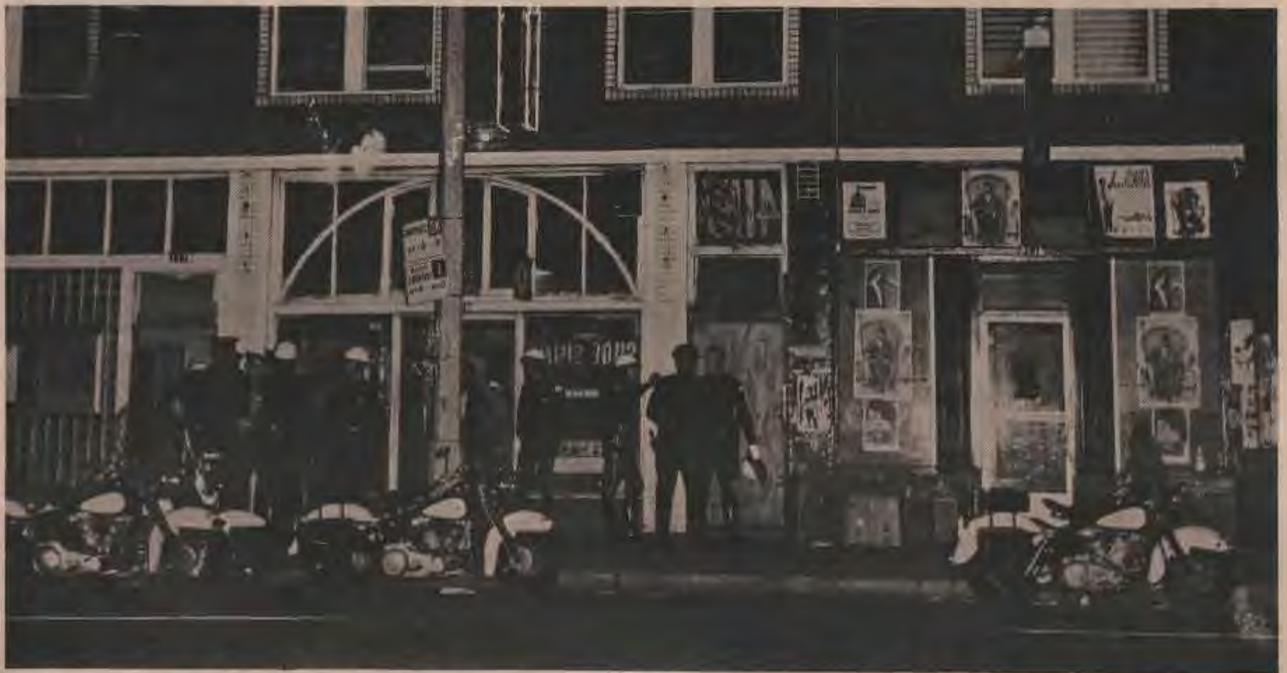
HISTORICAL EXPERIENCE--FASCIST PIGS OCCUPY THE BLACK COMMUNITY

For the first time since our office has been active, the F-troop fascists of Los Angeles made an attempt to vamp on the Southern California Chapter's Central Headquarters. On Wednesday, November 12th, the L.A. pig department under the direction of those fascist storm-troopers (otherwise known as metro squad) attempted to launch an attack.