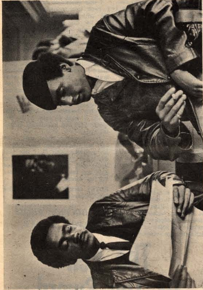
CHAIRMAN, BOBBY SEALE AND MINISTER OF DEFENSE, HUEY P. NEWTON

Presently now the fascist pig headed Judge Hoffman has taken the shackles off trying to smokescreen the situation. He's taken the shackles off because the fascist hogs, Nixon, the administration, Mitchell, and others have ordered him to do so behind the scene. It's obviously clear that he's trying to lay dead and think that I'm going to call him a fascist and a pig which I am going to do anyway because that's the way I see him and that's exactly what he is.