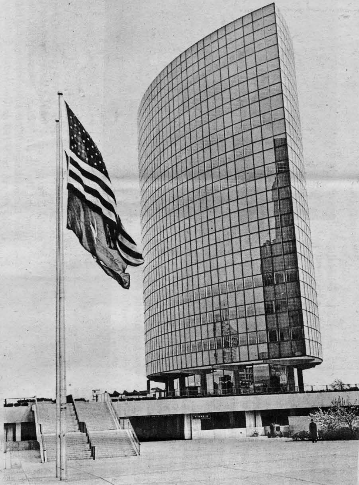
TRUE SYMBOLS OF FASCISM

ALL POWER TO THE PEOPLE AND DEATH BLOWS TO THE PIGS