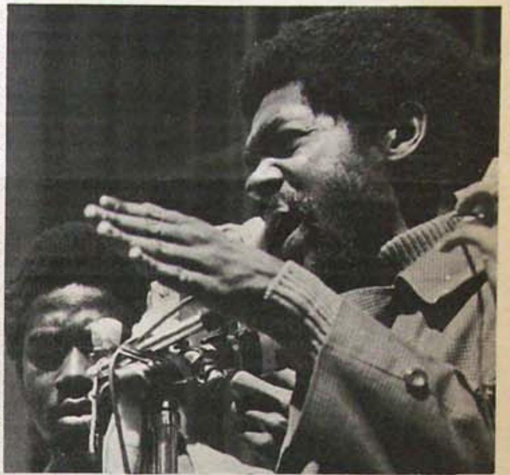
CHARLES BURSEY AND BOBBY SEALE

Because of the basic Ten Point Platform and Program that was put together that deals with the need for full employment for our people, that spells it out; that deals with a need for decent housing, fit for shelter of human beings; that deals with a decent education that teaches us our history and our place in the world and in society; that deals with the need to have fair trials by our peer groups or people from our Black communities or the districts where we live--because of a program that talks about land, bread, housing, education, clothing, justice, and peace; because of