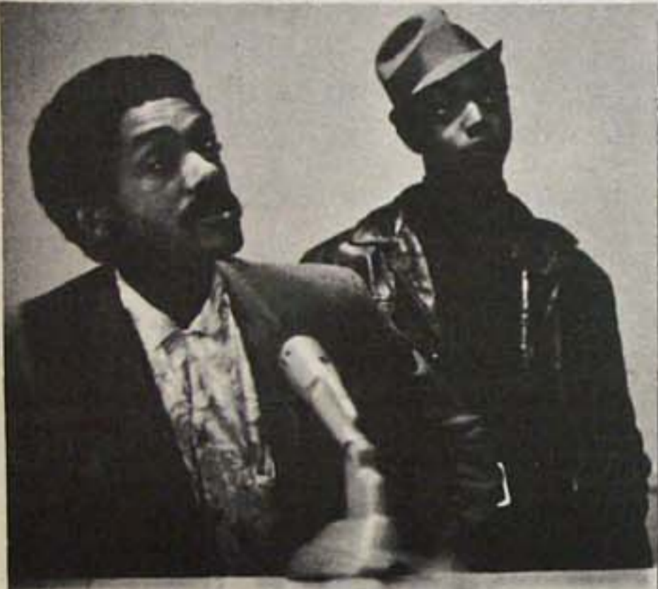
BOBBY SEALE AND L'L BOBBY HUTTON