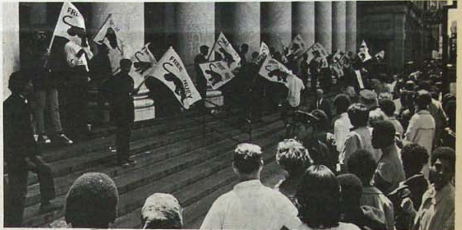
NEW HAVEN PANTHER RALLY, MAY 1, 1969

We want to make clear our deep concern that the Panthers not be denied equal process under law because they are both radical and Black. We therefore pledge our full support to all efforts to insure that they go into the court room without the verdict and sentencing