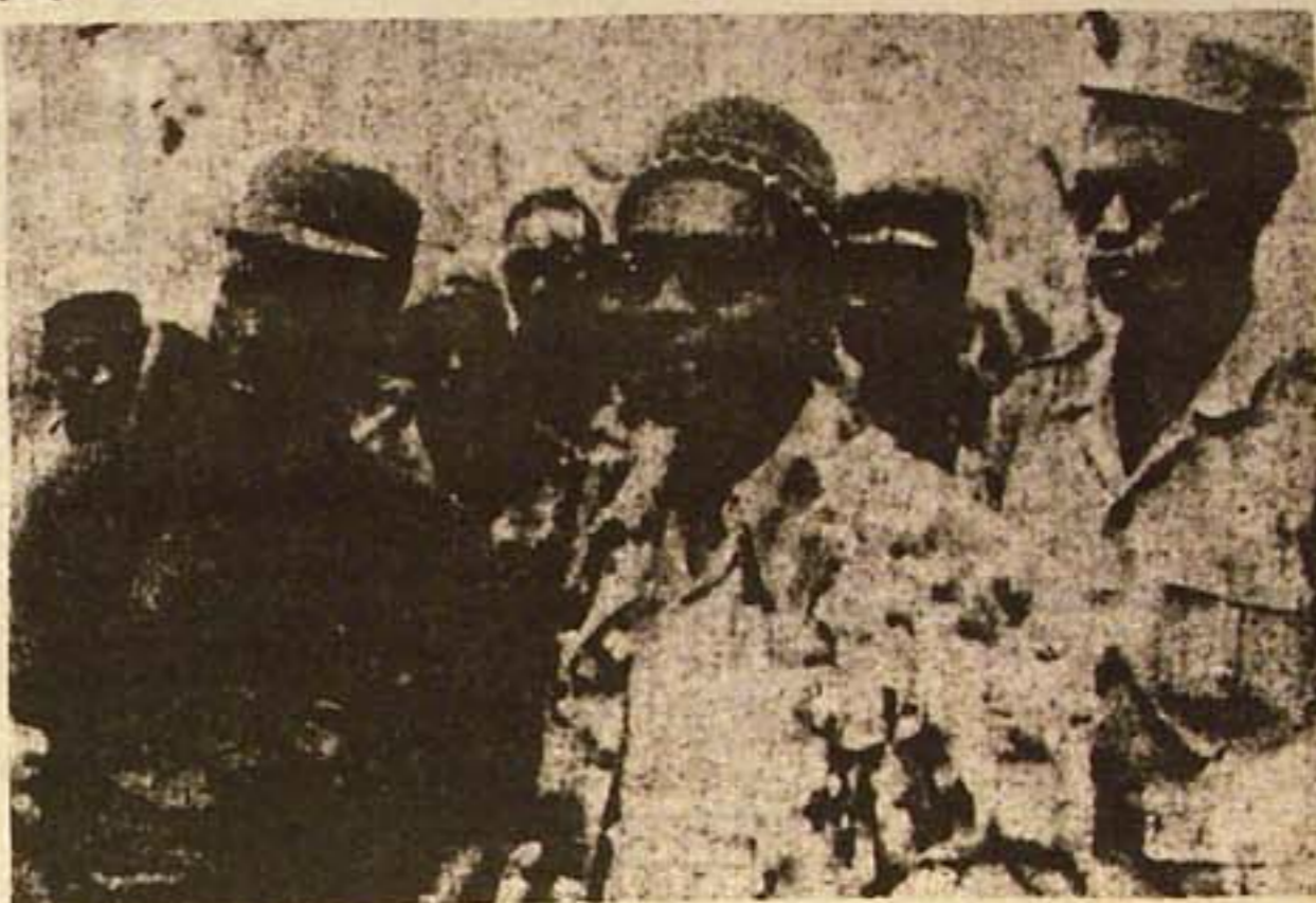
Amilcar Cabral, Secretary-General of the PAIGC, accompanied by Joao ("Nino") Vieira, member of the Council of War, reviews the guerrilla units operating in the Bolana and Gandembel zones.

the Assembly on November 27 demonstrates this. When a chief of government has to say that he is going to "defend a 'province' at any price," it is because he knows that