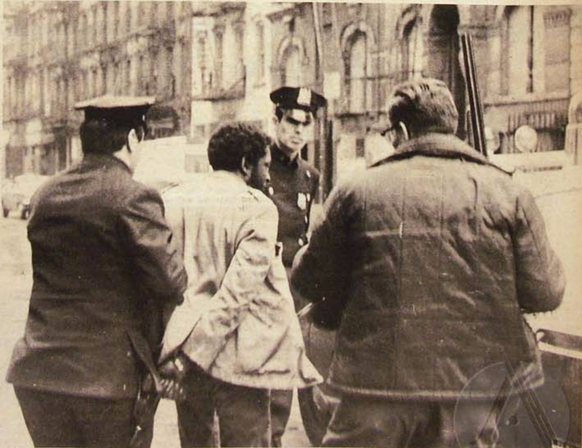
THE N. Y. 21, MICHELL'S HANDYWORK

It is clear from the prominent position of Mitchell & Co. in governmental strategy that the ruling class hopes to rely heavily on the police and courts to solve their growing problems. As Mitchell put it, the Justice Department "is an institution for law enforcement, not social improvement." But no police terror ever solved the problems of racism, war and poverty in capitalist society, and no court flunkies ever stopped a revolution!