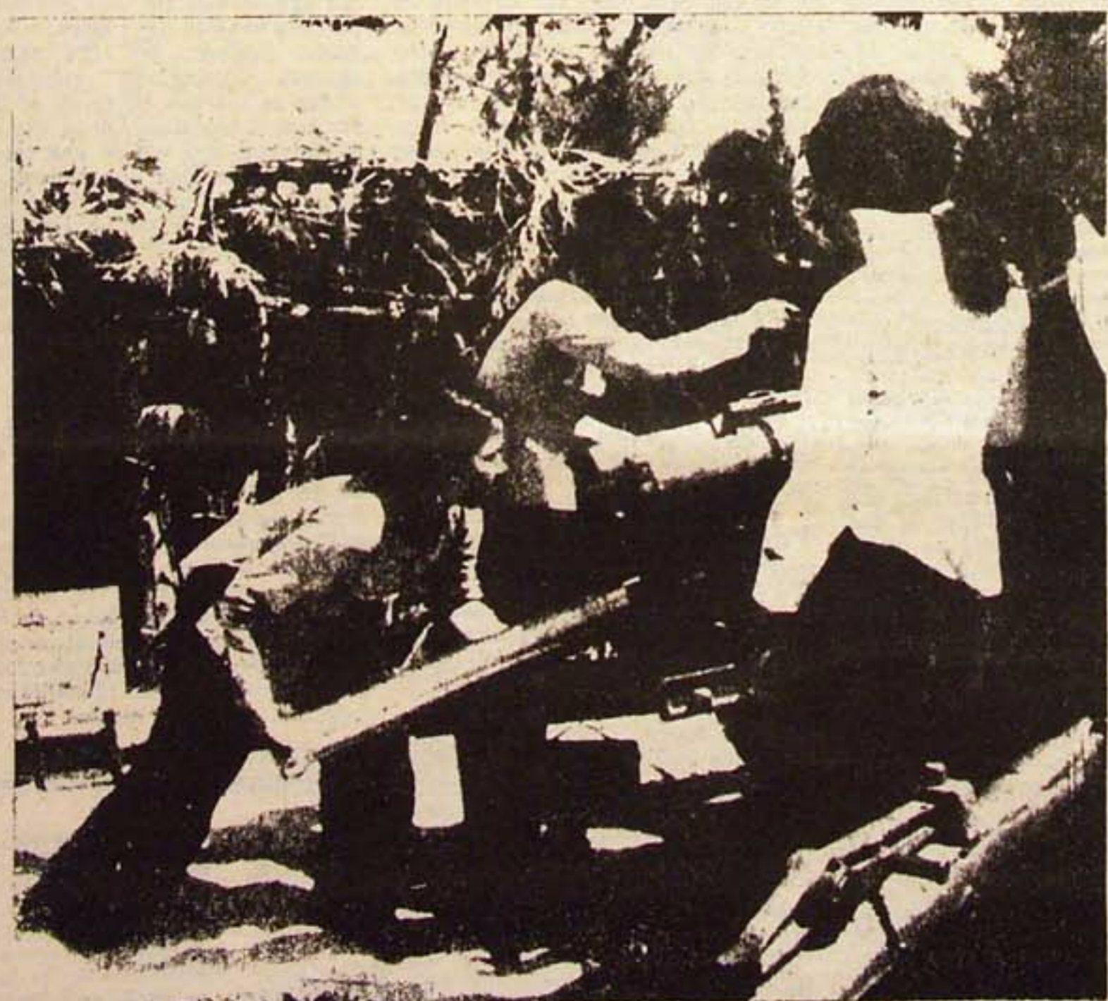
VIETNAMESE MILITIA WOMEN, PRACTICE FOR FURTHER DUELS WITH U.S. SEVENTH FLEET

Since 1947 the intelligence services of many countries have actively engaged in refining and distributing narcotics. The U.S. buys uncured opium in Laos and transports it by plane through Thailand into Vietnam where it is used as currency.