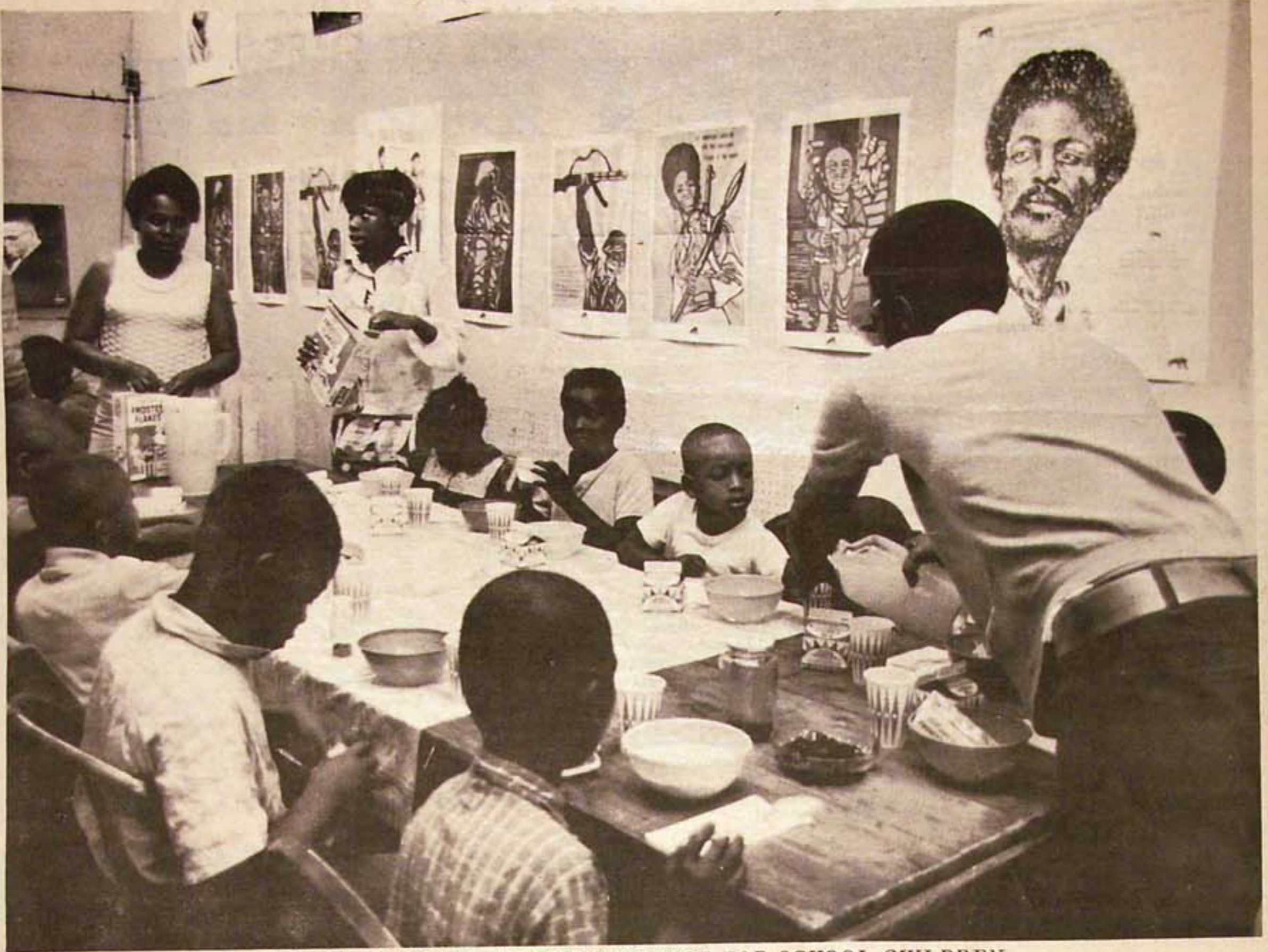
PHILADELPHIA FREE BREAKFAST FOR SCHOOL CHILDREN