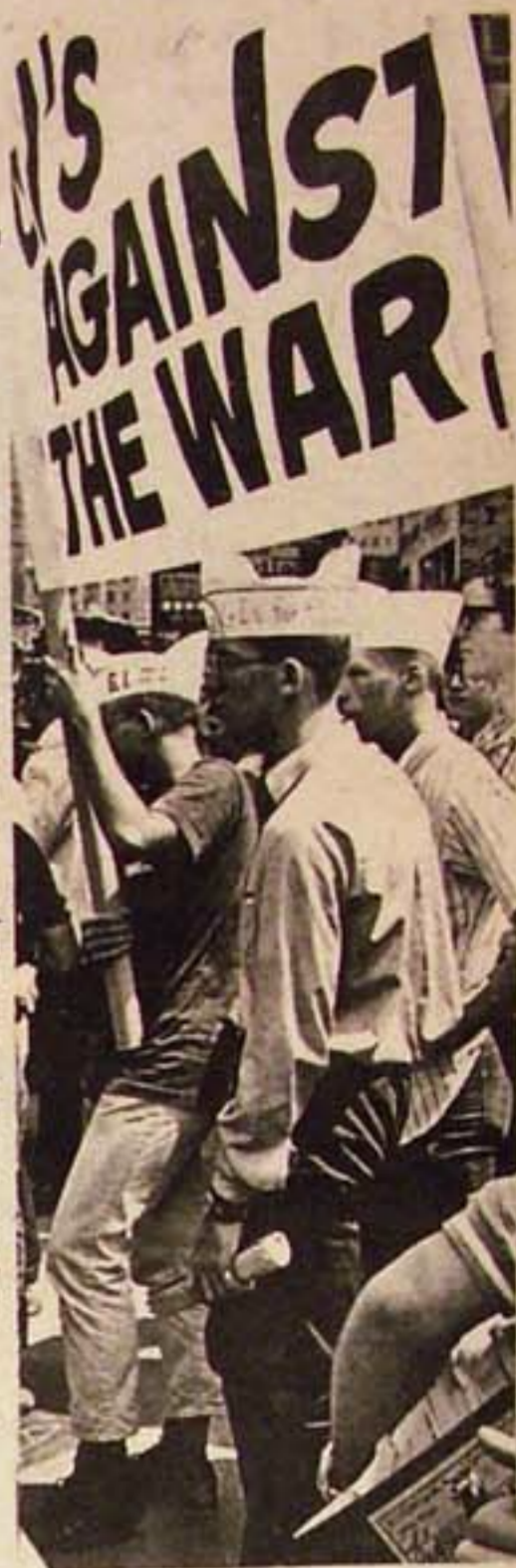
GIs lead New York demonstration.