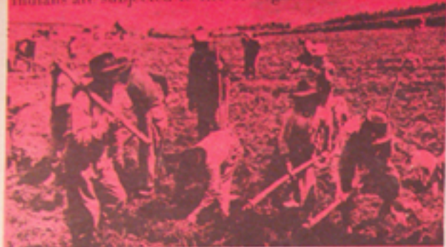
Indians toil daily on the large haciendas, rearing only a small portion of rice, beans and enough maize flour to keep them decent and healthy.