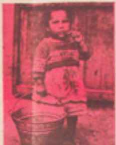
This orphan will live the pain of childhood. As was in the world with, she was forced to work.

It all began in the sixteenth century, with the conquest of the New Empire by the Spanish Conquistadors, who mercilessly enslaved tens of thousands of the natives in their quest for gold and precious minerals. But the Spaniards were not alone in their quest. They were joined by a host of other nations, including the Dutch, the English, the French, the Portuguese, the Americans, and the Germans. Each nation brought with it its own methods of enslavement, and each nation brought with it its own methods of exploitation.