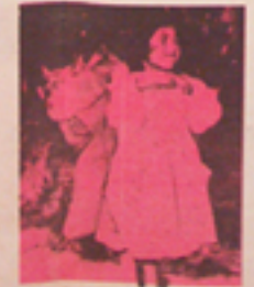
No happiness for this child like to be sold in the market here every day.

A century later, the Dutch East India Company turned back the European governments a concession to do for all as a 10,000 square mile tract of land in the dense jungle east of the Andes and the ancestral home of the Arawak Indians. Dutchmen of avaricious ambition to enter the fabulous terrain, but were turned back by the fierce Indians after word-of-mouth warnings.