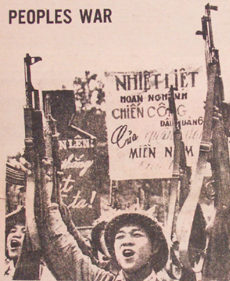
North Vietnamese soldiers express solidarity with the NLF.