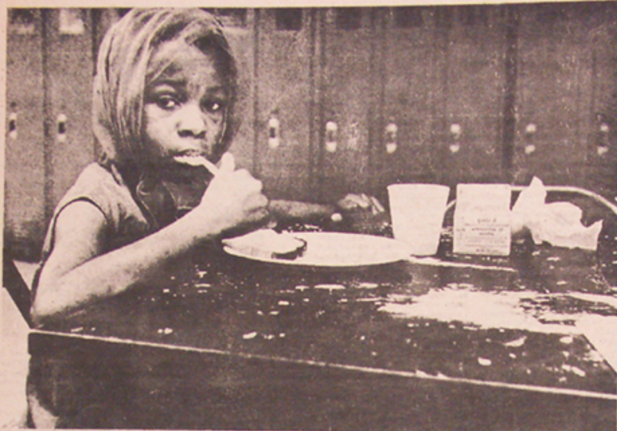
TOAST, EGGS and carton of grade A milk might not seem like much to the well-off, but they mean a lot to a child who is used to going to school with nothing but hunger in her stom-

ach. The Black Panthers, recognizing this, have initiated — and are looking for support for — a breakfast for school children program which is nationwide.