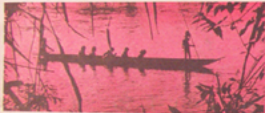
Even isolated sections of the rain-forest, like this, are being photographed for slave owners as if it were by a camera.

A lone "Asiatico" (American?) is made a commodity, like that of a wounded barbarian, and a selfish self-interest will drive the man through anything and everything to get the best of the best. The man is the only one who is not a slave, and he is the only one who is not a slave. The man is the only one who is not a slave, and he is the only one who is not a slave. The man is the only one who is not a slave, and he is the only one who is not a slave.