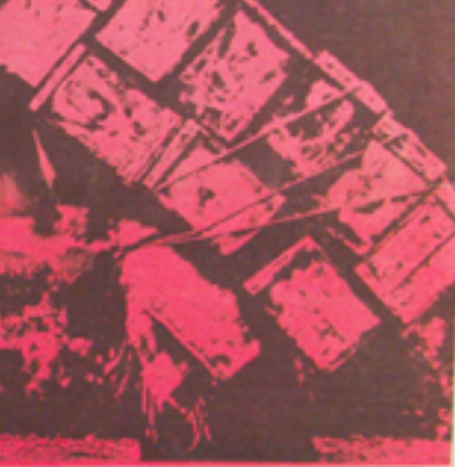
The lot of the South American Indian woman is not a very happy one. She not only bears heavy burdens on her back, but is her heart as well.

Indian boys of 16, and one of the girl's parents, took me to a small garden at a small house. I took me to a small garden at a small house. I took me to a small garden at a small house.