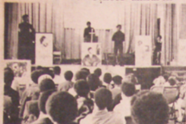
BREAKFAST Sponsored by Black Panther Party New Haven Chapter

The movie, "Off The Pigs", was shown and the "Eulogy of A Black Man" by Father Earl A. Neil, "Black Mother" by Bunchy Carter and "Affidavit of Eldridge Cleaver" were read. Also read was "Executive Mandate". The audience also heard a rundown of "Breakfast For Children". Actors from the Children's School performed "Black Capitalism". The Panthers also gave a breakdown of some contradictions between the "enemy and ourselves". A sales table included papers, posters and literature.