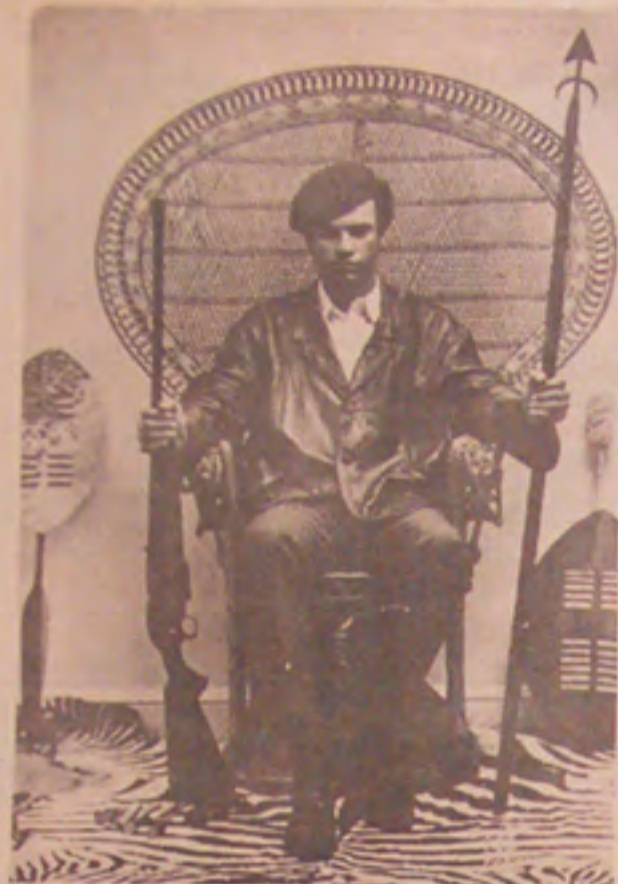
HUEY NEWTON MINISTER OF DEFENSE BLACK PANTHER PARTY