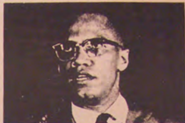
Assassinated, Feb. 21, 1965