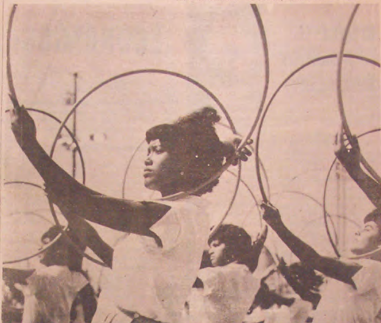
YOUNG CUBAN PEOPLE PRACTICE GYMNASTICS

The Black Panther Party which is still making every effort possible to secure freedom for Huey P. Newton, now gives its support to another revolutionary group, the Oakland Seven. As Chairman Bobby Seale said, "We must give the Black community awareness that there are a few John Browns still around." The Black Panther Party now says "Free Huey" and "Support the Seven."