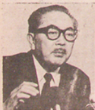
DR. S. I. HAYAKAWA, acting president of strike-torn San Francisco State College, whose outlook on Black students is under scrutiny.