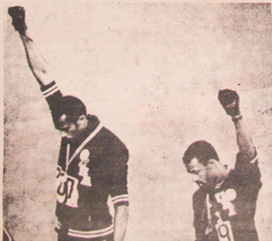
HEROES: TOMMIE SMITH AND JOHN CARLOS