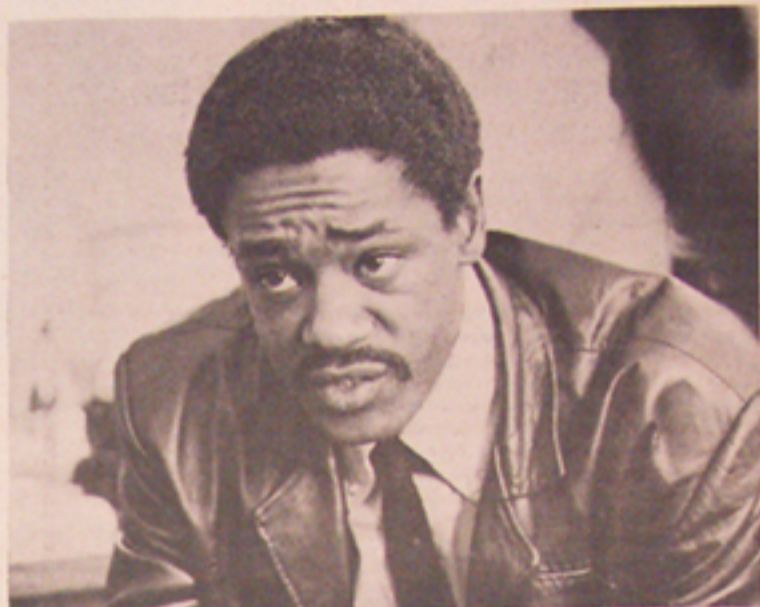
BOBBY SEALE, CHAIRMAN OF B.P.P.

"We will take any steps," Bobby Seale emphasized, "to eliminate the problem."