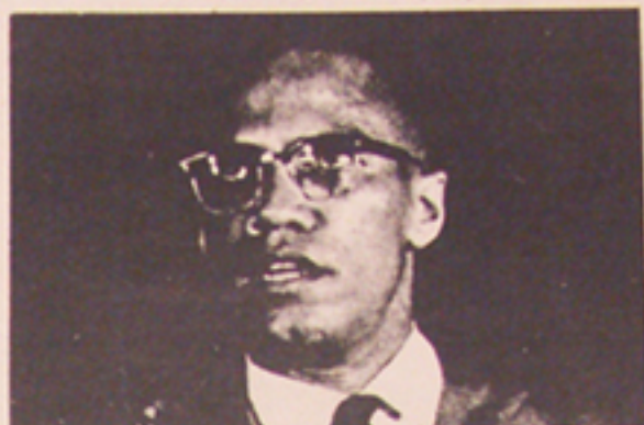
Assassinated, Feb. 21, 1965

REMEMBER BROTHER MALCOM Born, May 19, 1925