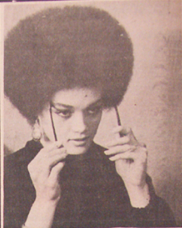
KATHLEEN CLEAVER COMMUNICATION SECRETARY BLACK PANTHER PARTY