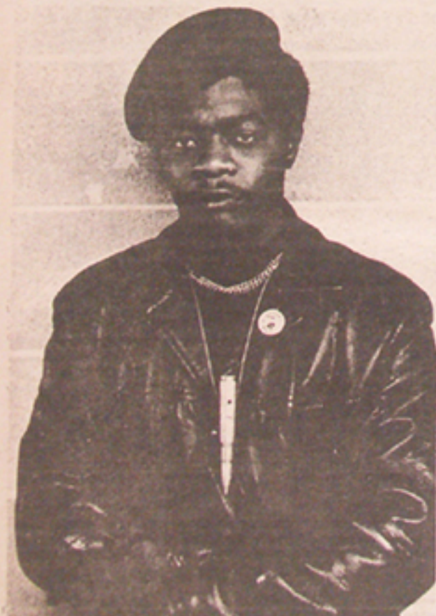
BALTIMORE BLACK leader Elijah C. Boyd, Jr. verbalized no nonsense stance of Blacks—Third World caucus who demanded conference focus support on liberation struggles throughout the world—including South Africa, Mozambique, Rhodesia, Latin America, the Middle East, South East Asia, and the ghettos of America.