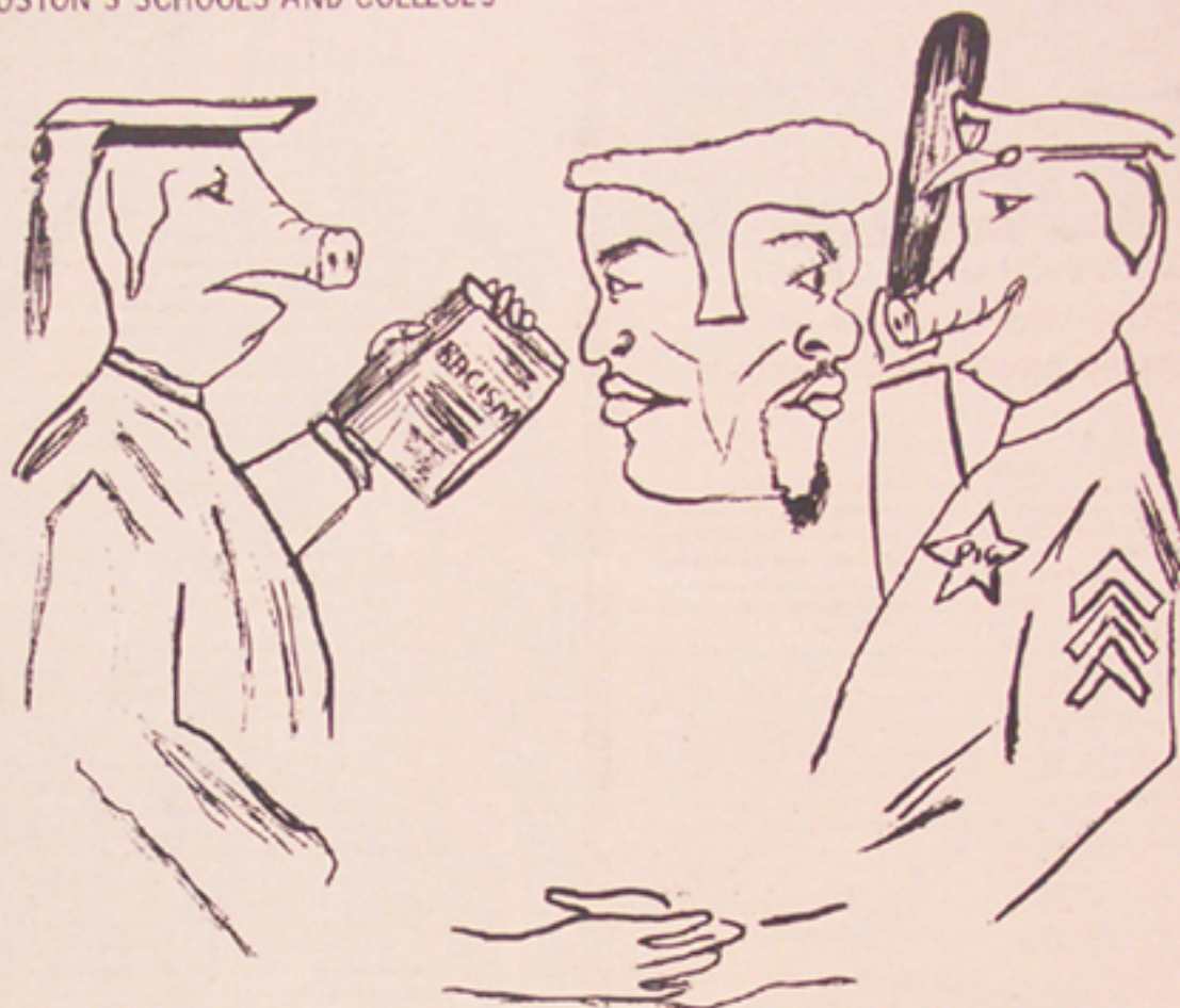
DEAN OF RACISM