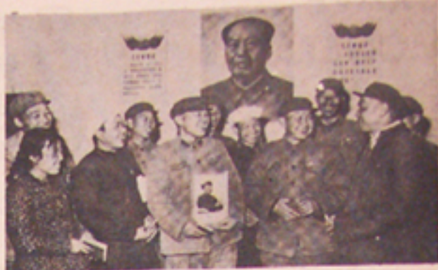
The people in Yenan, cradle of the Chinese revolution, who have stood on the side of Chairman Mao's revolutionary line and waged a heroic struggle against the class enemy are talking about their gains in studying and applying Chairman Mao's writings creatively in struggle.

Armagh is a city some 80 kilometers from Belfast, capital of Northern Ireland.