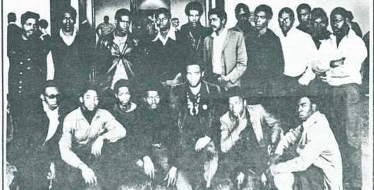
THESE COURAGEOUS BLACK BROTHERS, THE HEROES OF MAY 2 BLACK PANTHER DAY, UNDERSTOOD THE SIGNIFICANCE OF GOING TO THE CAPITOL, ARMED TO THE GILL, TO DELIVER A MESSAGE TO THE BLACK WORLD ON WHITE RACISM.