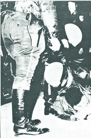
THE POLICE ACTION IN VIETNAM IS NO DIFFERENT FROM THE POLICE ACTION IN THE BLACK QUARTERS OF AMERICA. THE POLICE OCCUPY OUR BLACK COMMUNITIES LIKE A FOREIGN TROOP OCCUPIED TERRITORY.