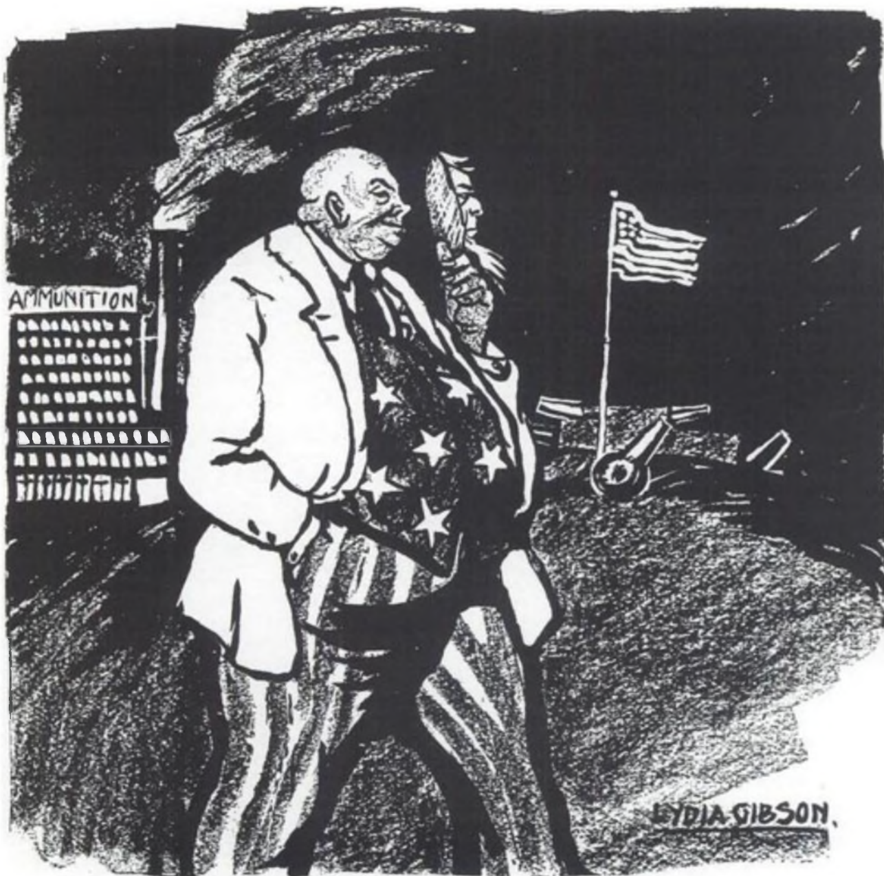
THE MASK OF PATRIOTISM