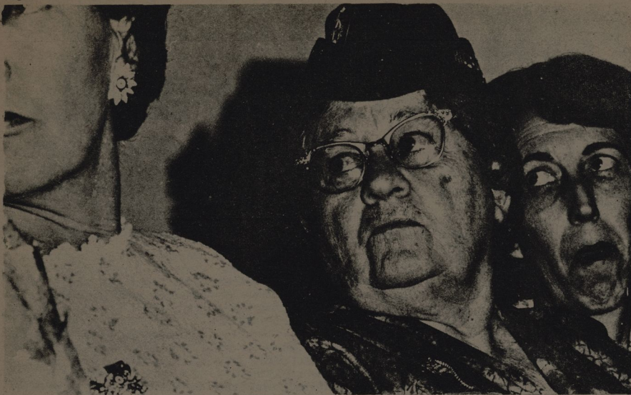
The Ladies' Auxiliary of the American Legion "CITIZENS MEETING"