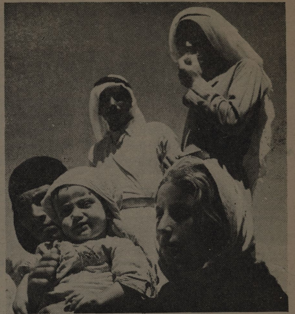
DRIVEN OUT OF COUNTY. Arab refugees forced out of Palestine during 1948 war remain exiles to this date. The Militant