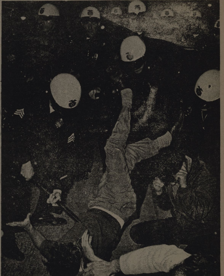
rebellious members of America's black community.

The press is to work on behalf of the cops, establishing their control over the