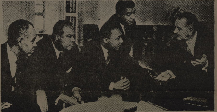
MARTIN LUTHER KING at home in the White House, with BOY WILKINS, FARMER JAMES, WHITEY YOUNG, and the chief of the old plantation, LYNCEM JOHNSON. from SPARK -- a photo and a point of view on "intended victims."

The Beats are reassembling and their striking force increasing until now it has mainly been in the form of passive resistance. The question now is will it continue so also in the future?