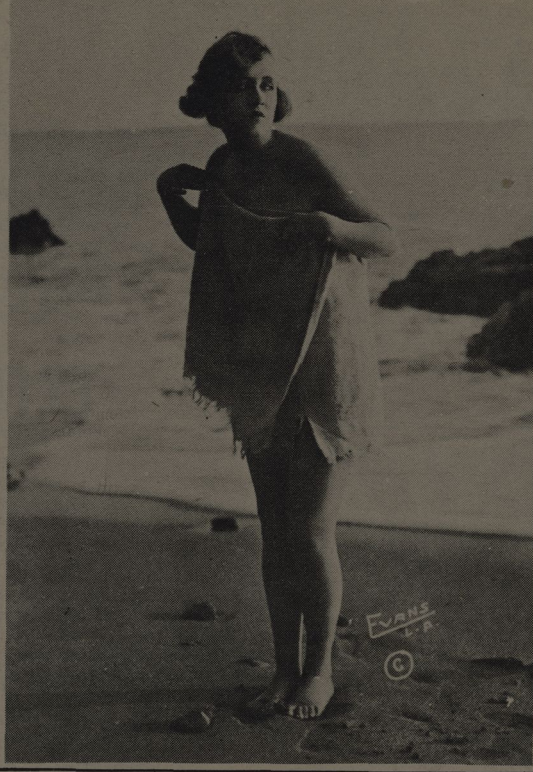
FREE ON THE BEACH