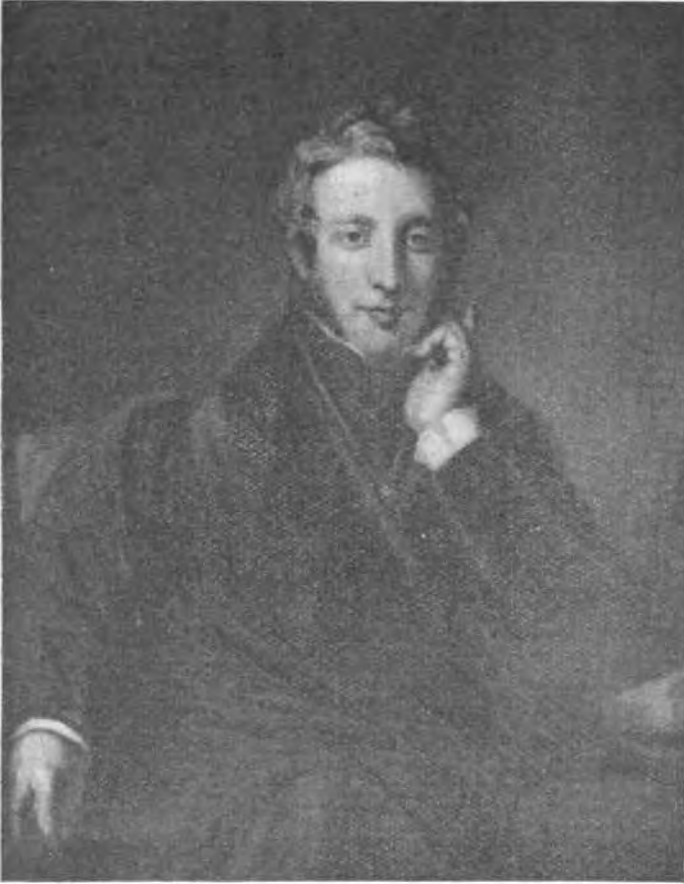
EDWARD BULWER (AFTERWARDS LORD LYTTON). (From the painting in the National Portrait Gallery.)

think, escaped his biographer's notice. The most renowned occultist of his day was the Abbé Constant, generally known under the pseudonym of Eliphas Levi, author of L'Histoire de la Magic, Dogme et Rituel de l'Haute Magic , etc., etc. Now not only was Lord Lytton Grand Patron, as already stated, of the Rosicrucian Order, but there is strong reason to believe