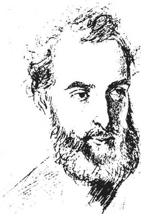
LORD LYTTON (1860).

(Reproduced by kind permission of Messrs. Macmillan.)