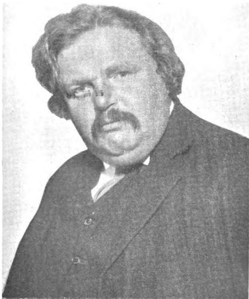
MR. G. K. CHESTERTON.

burning, crimson flame of passion into the cool, white light of faith, and kisses her gently on the forehead. He is in no sense a bad husband, nor wanting in kindness, but that gentle kiss on the forehead may be taken as symbolical of his whole attitude to-