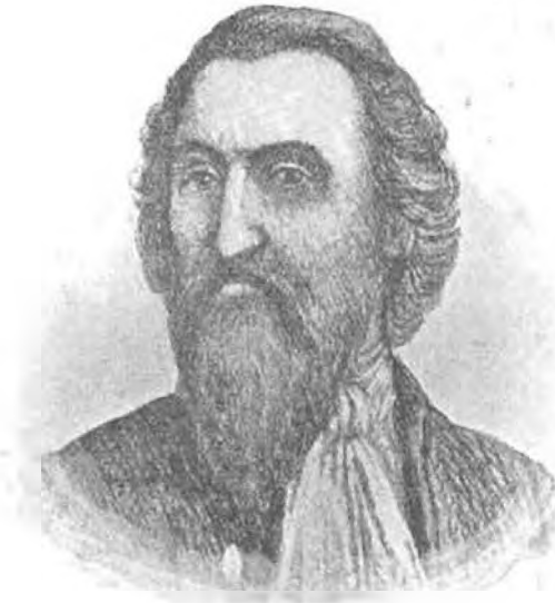
MARTINES DE PASQUALLY.

So far I have been creating what may be termed a distinction only between two personalities of a period, both of whom were remarkable and both attractive in their way. It was in the great and spacious days of a thousand activities in France prior to the French Revolution. Martines de Pasqually was travelling with a Masonic Rite from a place beyond the Pyrenees, or perhaps further, he being presumably of Spanish origin, though it is not certain. Saint-Martin was a gentleman of Touraine, somewhat over thirty years when the instructor and pupil met. Let us take from another witness a short account of the one that we may the