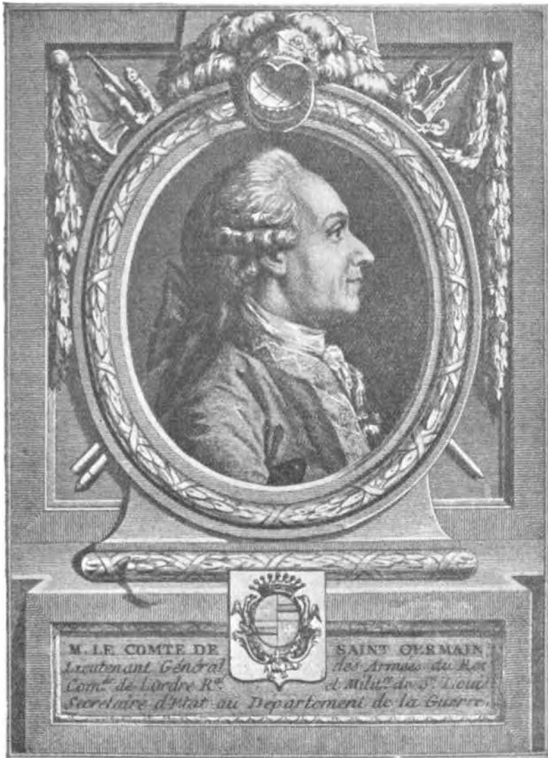
THE COMTE DE SAINT GERMAIN.

On the side of philosophy Saint-Martin connects with Pasqually, in the sense that the teachings of the latter passed through the alembic of the mystic's mind, issuing under I know not what transmuted forms, but in a way that made them his own after a