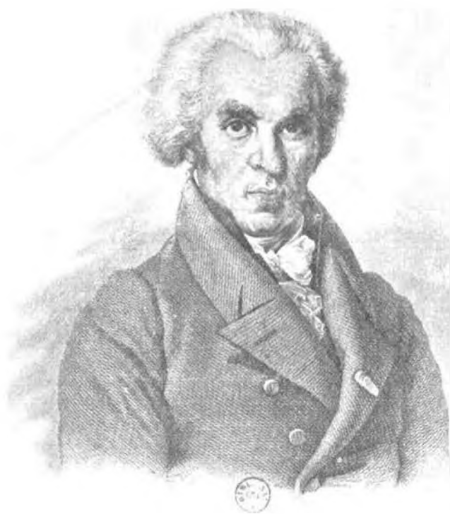
THE COMTE D'HAUTERIVE.

another ; and Saint-Martin is the sole instance on record of a great mystic who began his career amidst occult and magical practices. This is the first point, and the second is, that albeit he saw the dangers, uncertainties and manifold deceptions of the phenomenal