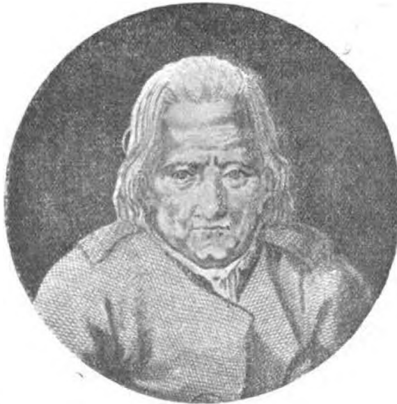
JACQUES CAZOTTE, THE AUTHOR OF Le Diable Amoureux .

visible universe." In the belief of the brotherhood, success attended the project, and long years after Saint-Martin had detached himself from all such ways and processes, he bore testimony to a correspondent that he had been present at communications where "every sign indicative of the 'Repairer' was present." I need only add that for Saint-Martin the Repairer signified Christ. The question which arises is how in the face of such testimony came he who bore it to choose another path, more especially when he put on record the fact that he and his teacher were only "beginning to walk together" when death removed the latter. What must be called an answer to the question is found