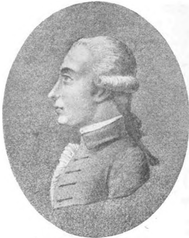
LOUIS CLAUDE DE SAINT-MARTIN.

the hypothesis, between the earth-bound man, living in the light of the material sun, and this paradise of Dante, place of Beatific Vision and heaven of thrones and palaces, he was planning an impossible journey, because consciousness, as here ensphered, does not reach other worlds by travelling through an intermediate space. But if the throne of God is in our consciousness, then the journey is in ourselves only and not through stellar distances. It is a travel undertaken in the region of realization—that great of all mystery words. We hear much at this day of unexplored fields