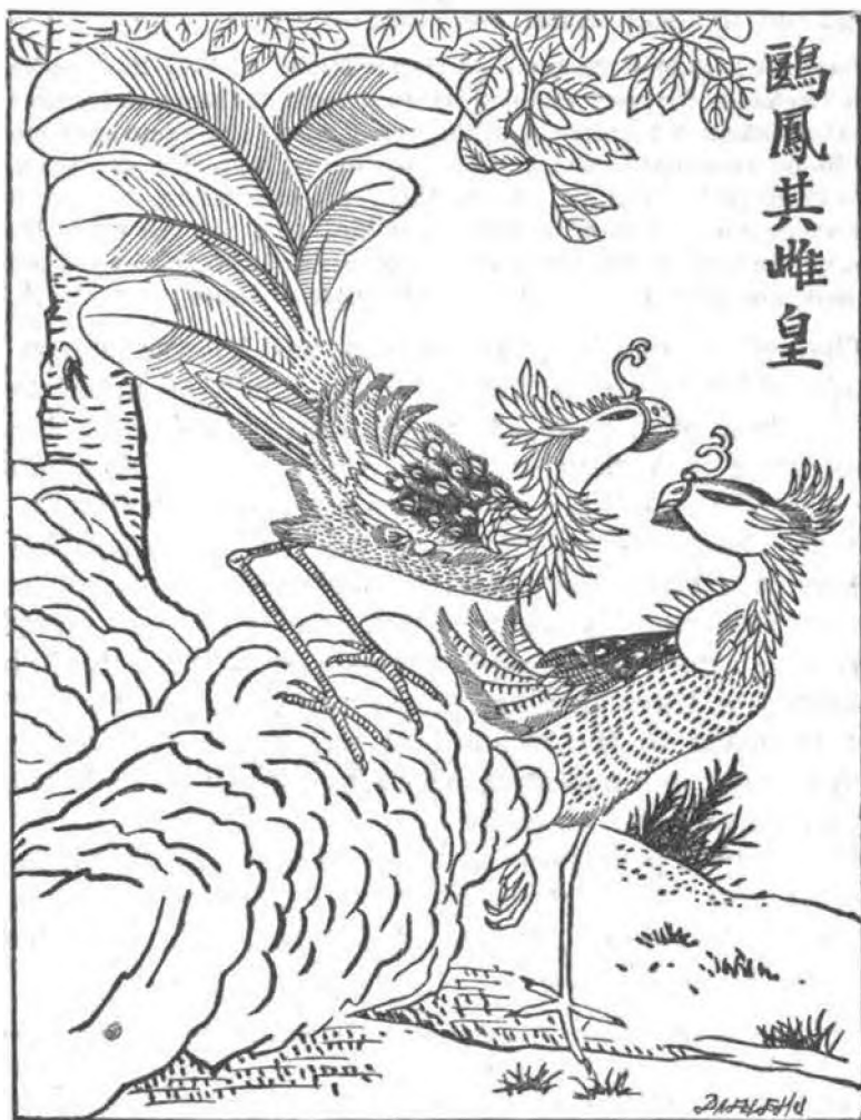
THE FUNG HWANG.

In other parts, however, the wren is (or at least was) cruelly hunted on certain days. In the Isle of Man the wren-hunt took place on Christmas Eve and St. Stephen's Day, and is accounted for by a legend concerning an evil fairy who lured many men