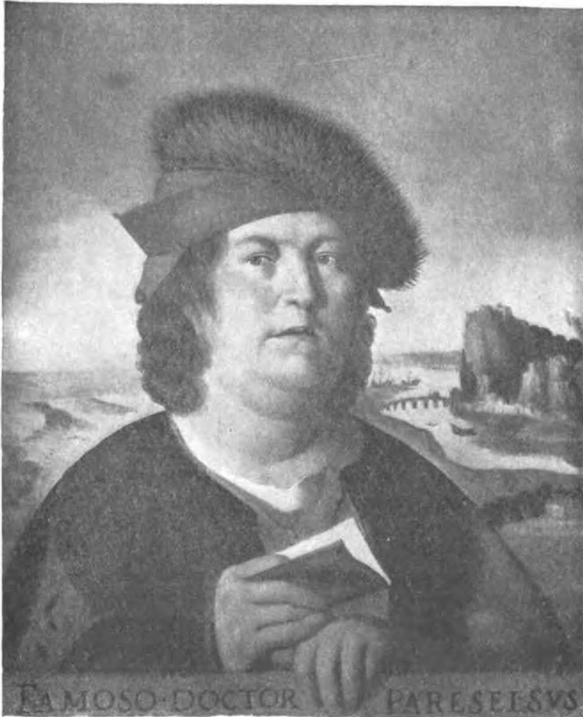
PARACELSUS, AGE 24.

The period of Paracelsus's career coincided with the Reformation of Luther, and with the wider and more general Renaissance movement. This latter movement had brought back in its train