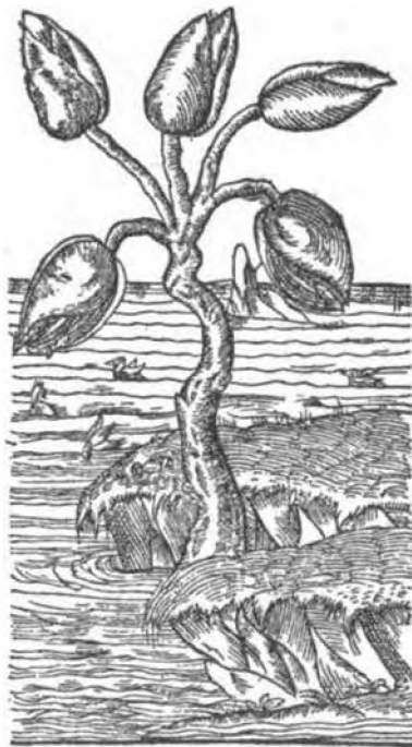
BARNACLE GESE. From Gerarde's Herball .

(By kind permission of the authorities of the British Museum. Photo by D. Macbeth, London.)