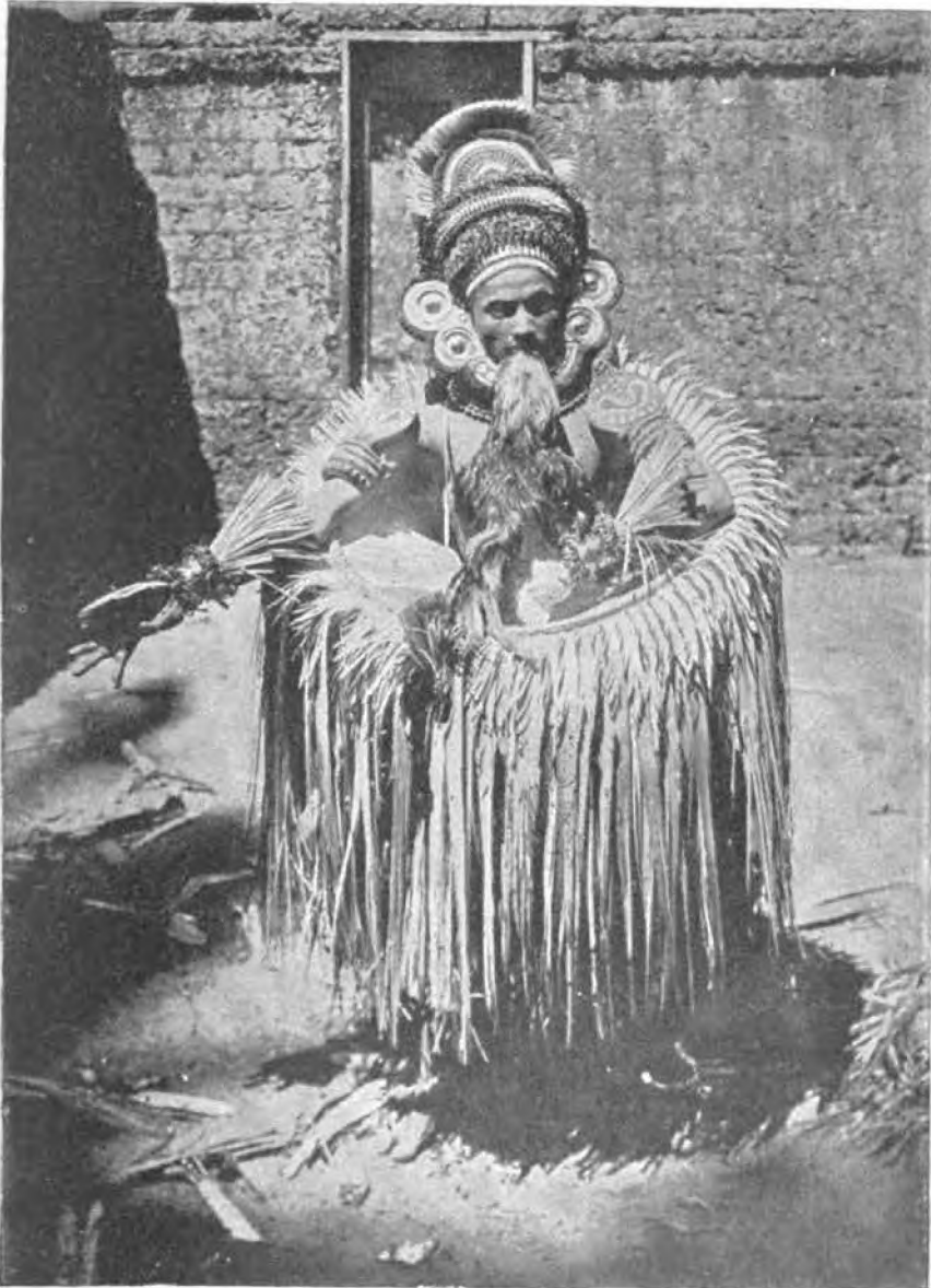
MALAYAN EXORCIST WITH FOWL IN HIS MOUTH.

soever, the Brahman believes in the efficacy of the Evil Eye and goes a long way about to secure immunity from its ill effects. It is nevertheless a fact that the Hindus believe in