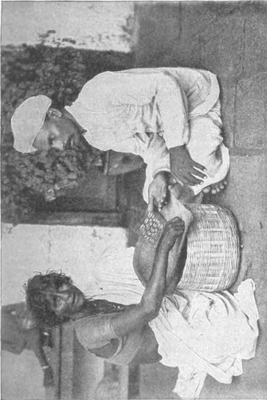
KORAVA WOMAN TELLING FORTUNES WITH COWRIE SHELLS IN TRAY.

was recited and the devil departed, its return being prevented by the wearing of a yantram. Another case was that of a boy