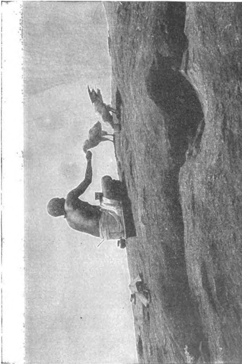
SACRED VULTURES, TIRUKAZHUKUNRAM.

the other to Rāmēs'vara. It is also said that the pair will never come together if sinners are present in the temple.