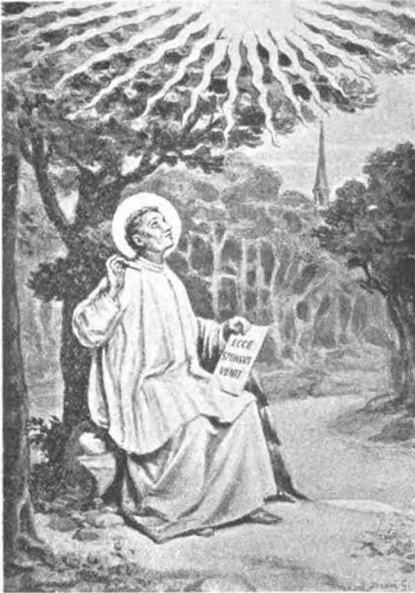
THE BLESSED JOHN RUYSBROECK.

And, by God's grace, this reminds me that as there are sheep which are not of this fold, so there are lights of Christian Mysti-