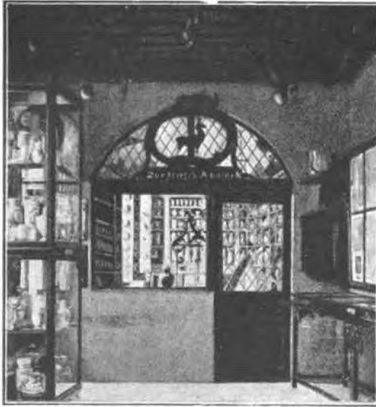
THE REPRODUCTION OF A SIXTEENTH-CENTURY PHARMACY IN THE GERMANIC MUSEUM AT NUREMBERG.

argued, are of efficacy in the curing of disease, according as they possess one or more of these so-called fundamental properties, hotness, dryness, coldness and moistness, whereby it was considered that an excess of any humour might be counteracted; moreover, it was further assumed that four degrees of each property exist, and that only those drugs are of use in curing a disease which contain the necessary property or properties in the degree proportionate to that in which the opposite humour or humours are in excess in the patient's system.