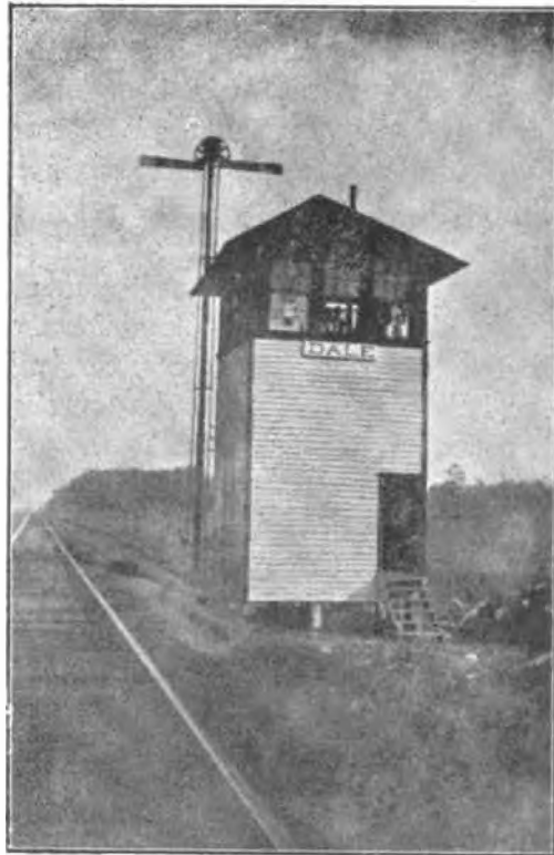
DALE TELEGRAPH TOWER.