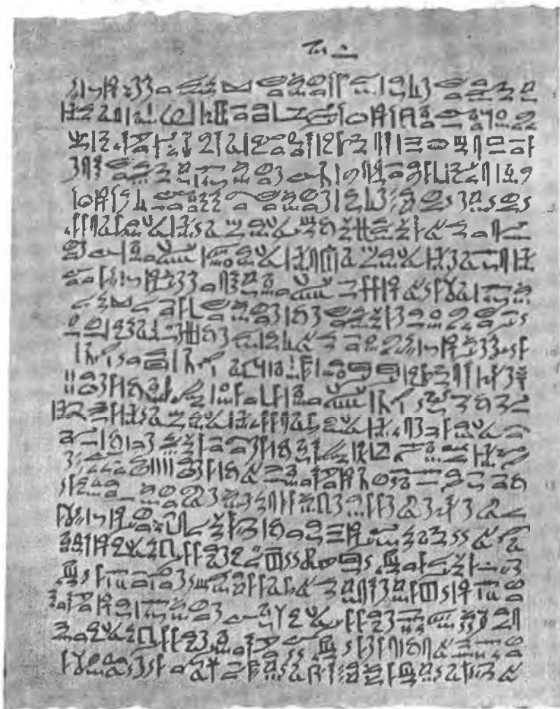
REDUCED FACSIMILE OF A PAGE OF THE PAPYRUS EBERS.

enhanced by a number of excellent illustrations in the text, including portraits of many famous men who have contributed to the building up of Pharmacy.