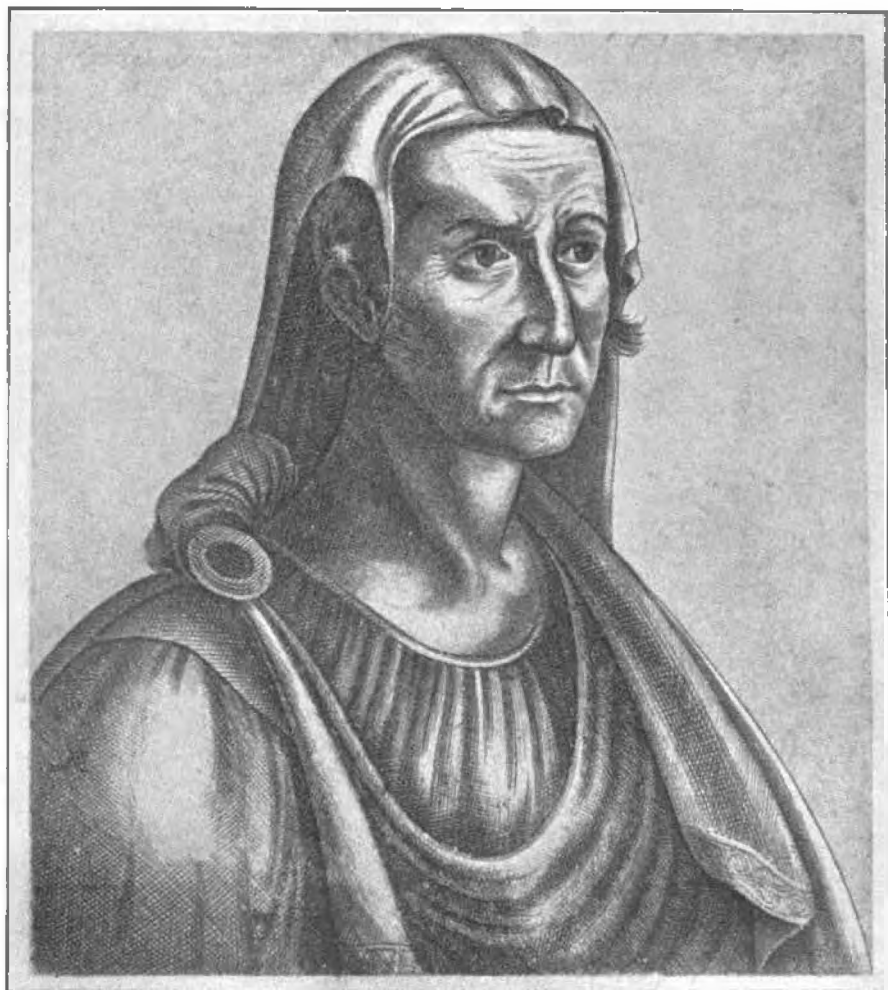
CLAUDIUS GALEN (?)

which were regarded as related to (but not identical with) the four elements—fire, air, water, and earth,—being supposed to have characters similar to these. Thus, to bile, as to fire, were attributed the properties of hotness and dryness ; to blood and air those of hotness and moistness ; to phlegm and water those