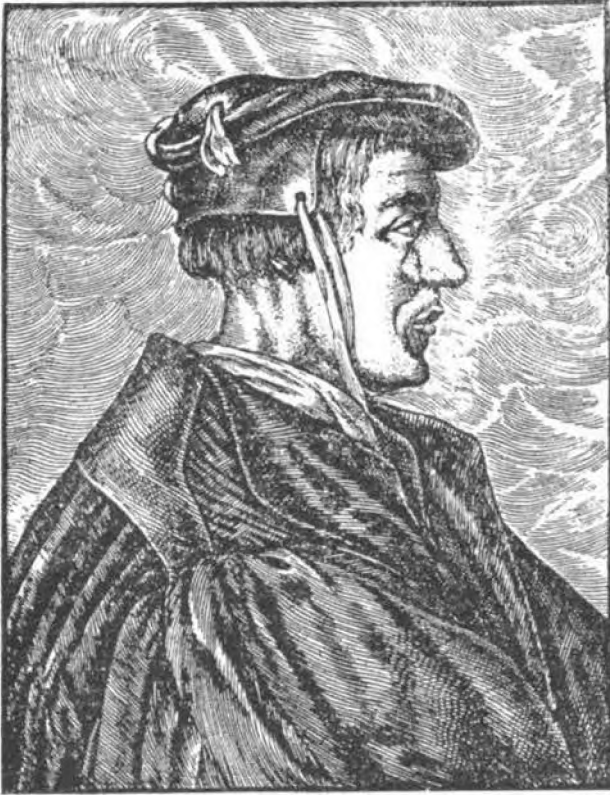
HENRY CORNELIUS AGRIPPA VON NETTESHEIM. (1486-1535.)

of the solar system (including sun and moon) and the days of the week, birds and beasts, colours, herbs and precious stones—all, according to old-time occult philosophy, are connected by the sympathetic relation running through all creation, the knowledge of which was essential to the magician ;—as well, also, the chief portions of the human body, for the old transcendentalists, especially Paracelsus, taught that man is a microcosm