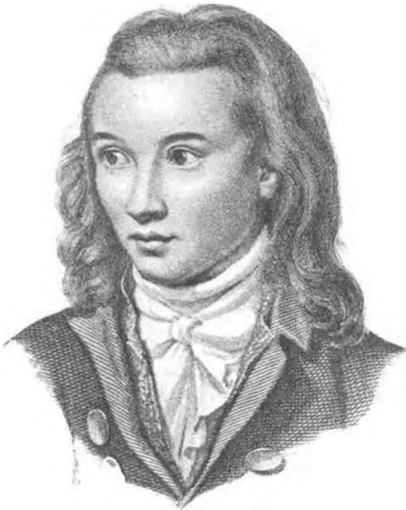
NOVALIS (FRIEDERICH VON HARDENBERG). (1772-1801.)

youngster his desire for chocolate has reference entirely to the pleasant sensations arising when the confection is eaten. Then, consciousness is an essential factor in the satisfaction of his desire, and we cannot avoid the conclusion that what he really desires is the idea of chocolate, or, to speak more precisely, the idea of eating chocolate. True, by the power of his imagination he can conjure up in his mind this desired idea, without the aid of the external world; but the idea thus arising is vague, hazy, ill-defined, and does not bring satisfaction. Let him,