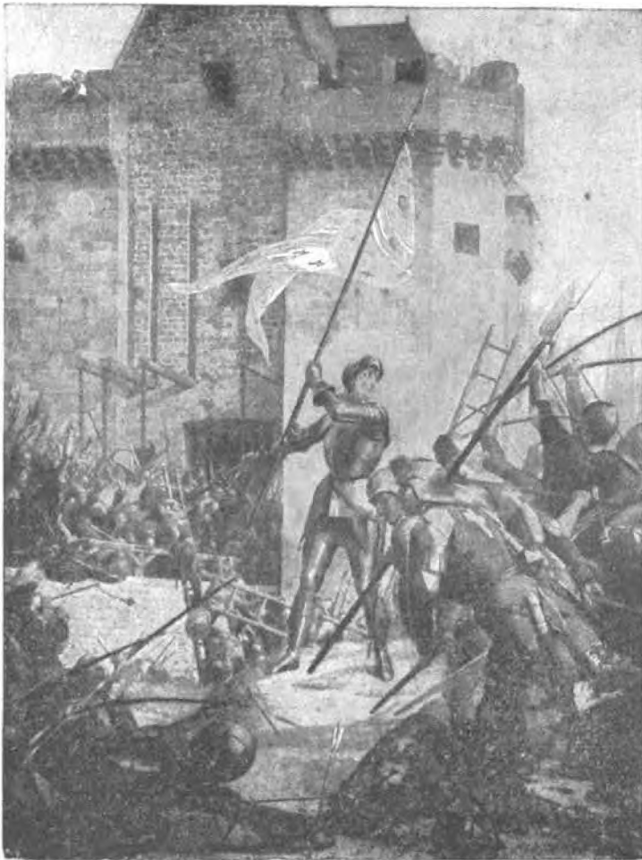
THE SIEGE OF ORLEANS.

for the incarnation of the Divine Feminine. Her character and her mission were adapted to the need of the hour, but they were not produced by it.