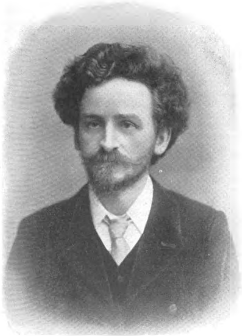
MR. JAMES ALLEN.

Mr. Allen's writings are steeped in Theosophical thought and