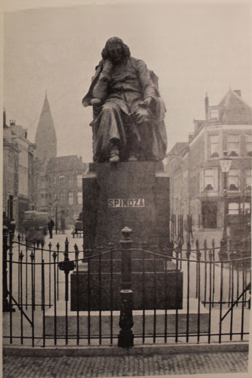
STATUE OF SPINOZA AT THE HAGUE.