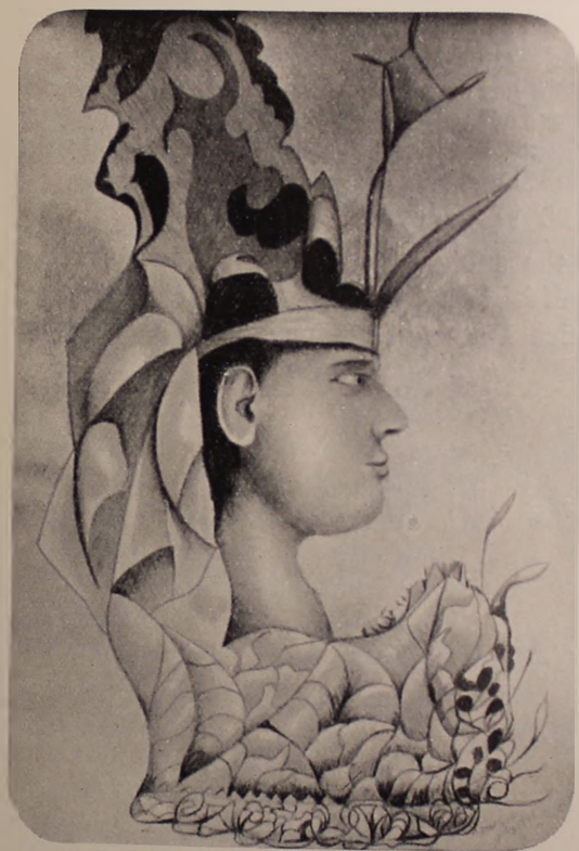
ANOTHER ILLUSTRATION BY "MENTHES."

"One morning during the fourth week I returned to lunch, and my wife having finished her seance had gone to the dining-room. On the table of the room in which I stood were the sheets of paper she had been using, and on one of them I saw what appeared to be an Oriental drawing resembling the carving on some ancient Indian or Maori temple. I thought some visitor had been at work, for I knew my wife could not draw at all.