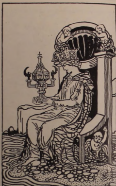
QUEEN of CUPS.