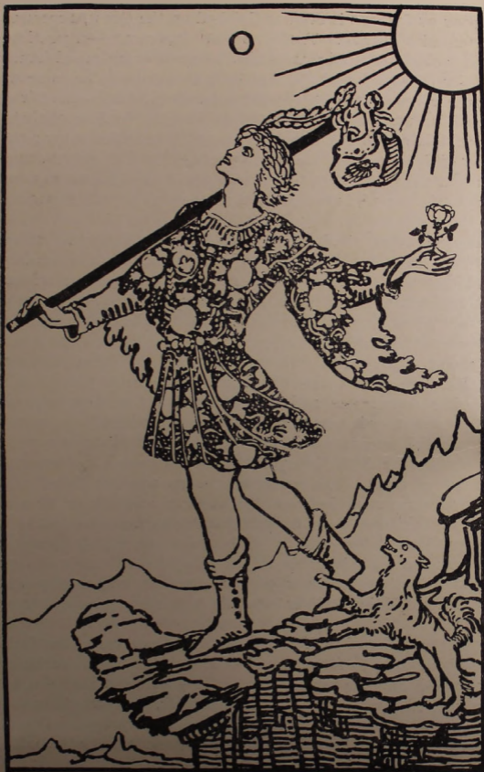
THE FOOL .