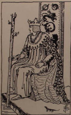
KING of WANDS.