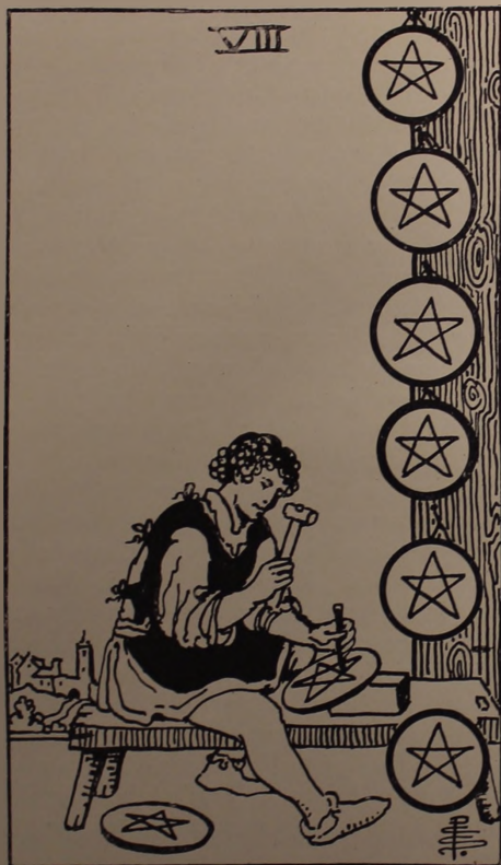
EIGHT OF PENTACLES. (Actual size of Cards.)

become scarce, and for which many have been looking there and here in the catalogues. It follows that the Tarot is, as people say, in the air ; but there is one difficulty with which we have had all to contend in England. It is easy to read about the subject, and if people have the mind they may become quite learned respecting it,