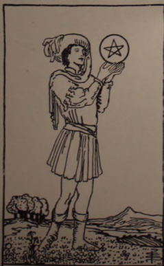
PAGE of PENTACLES.