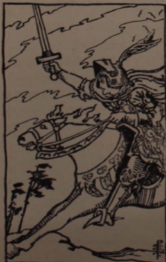
KNIGHT of SWORDS.