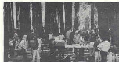
San Francisco Bay Area Picnic Scenes