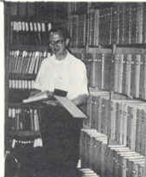
Student in Readings Alcove, A.R.E. Library.