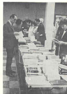
Conference book sales tables

You who are thinking in terms of A.R.E. Press publications and other books as gifts: we must have your order processed and shipped no later than December 1st for Christmas delivery. This means that your order should arrive at the Press no later than November 25th. Normal year-round postal delivery of Special Book Rate Fourth Class Mail is six days in our local area, on up to twenty-one days to the Pacific Coast states, two months to Hawaii.