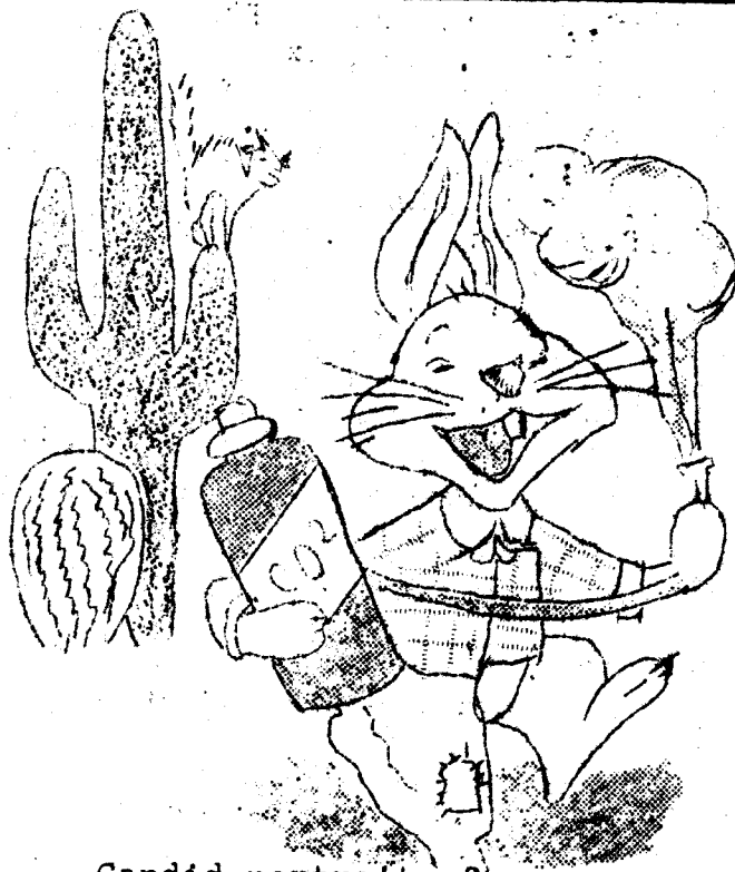
Candid portrait of a once Widely-known Dianeticist.

Undoubtedly, there are many things yet to be learned about man and the multitude of universes in which he has, does, or will exist--and we've probably only tapped the surface. It may be years before the infinity sign for the Eighth Dynamic--the Figure 8 lying on its side--will stand upright. At present, we accept the fact there is a Supreme Being, but no one yet has had the temerity to restrict him to a finite definition. Not in Scientology, anyway.