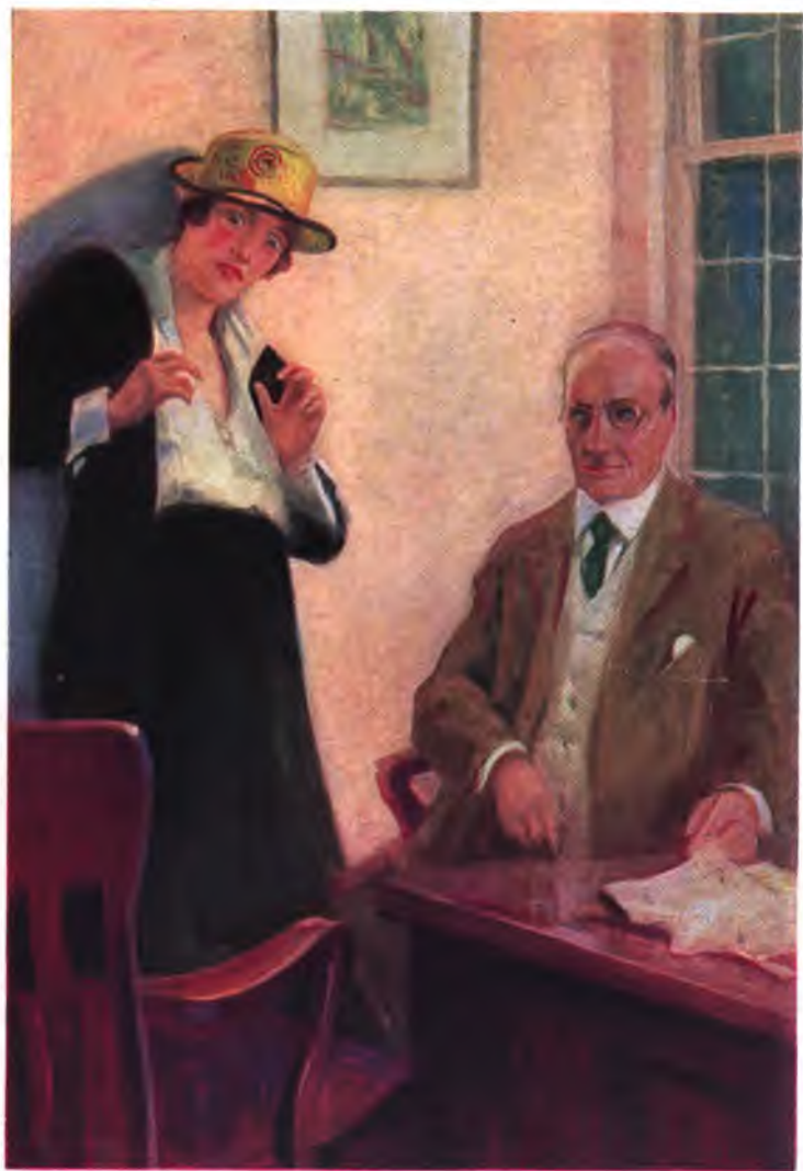
"The girl had risen to her feet and was shrinking back to the wall." See page 337.