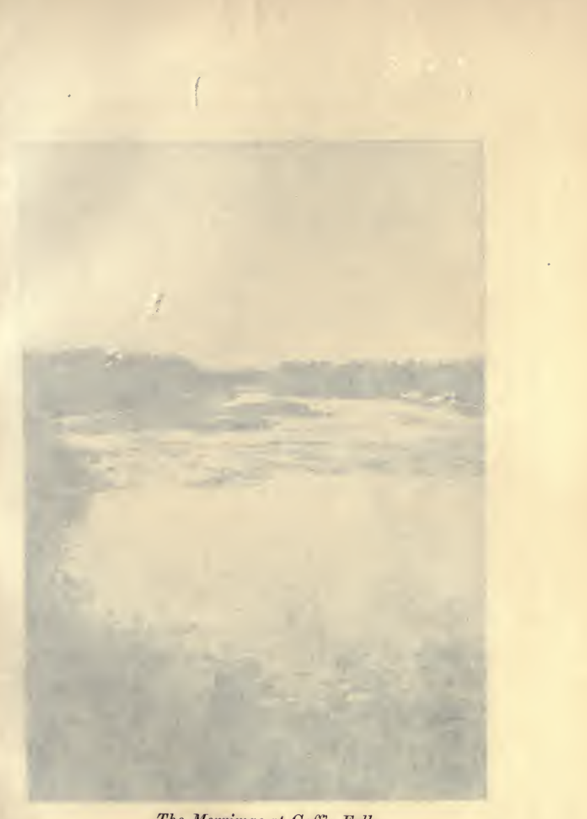
The Merrimac at Goff's Falls