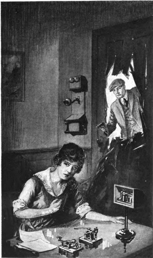
Quite motionless, waiting over the sounder, bent the woman