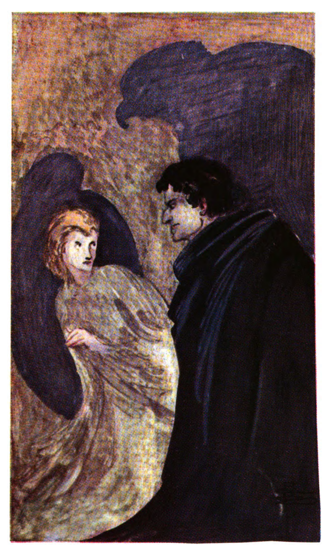
"He kept his eyes fixed on Lilla." [FACING PAGE 60.