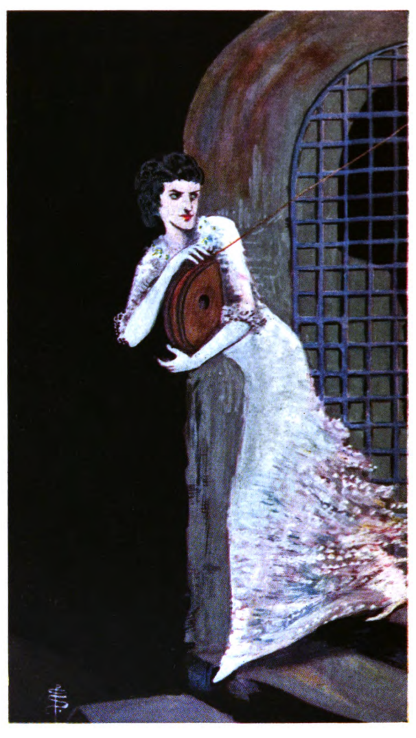
"Down the turret stair she flew quickly." [FACING PAGE 294.