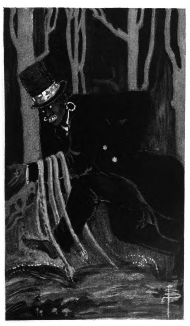
"Oolanga's black face... peering out from a clump of evergreens." [FACING PAGE 148.