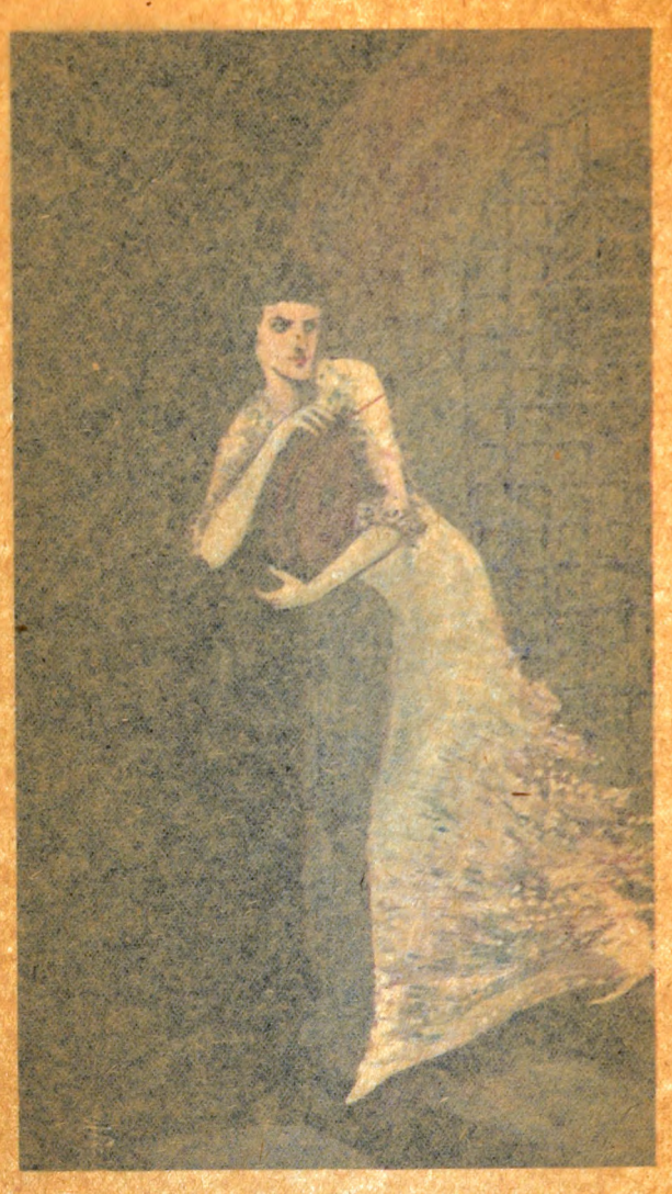
"Down the turret stair she flew quickly," [FACING PAGE 294]