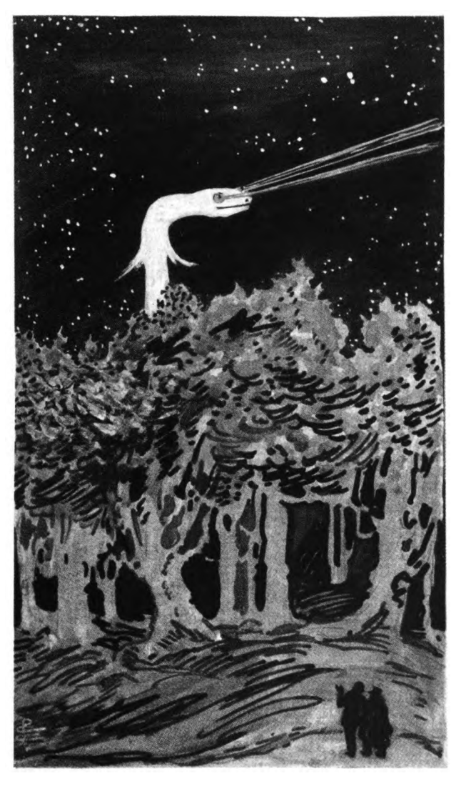
"They could follow the tall white shaft." [FACING PAGE 222.