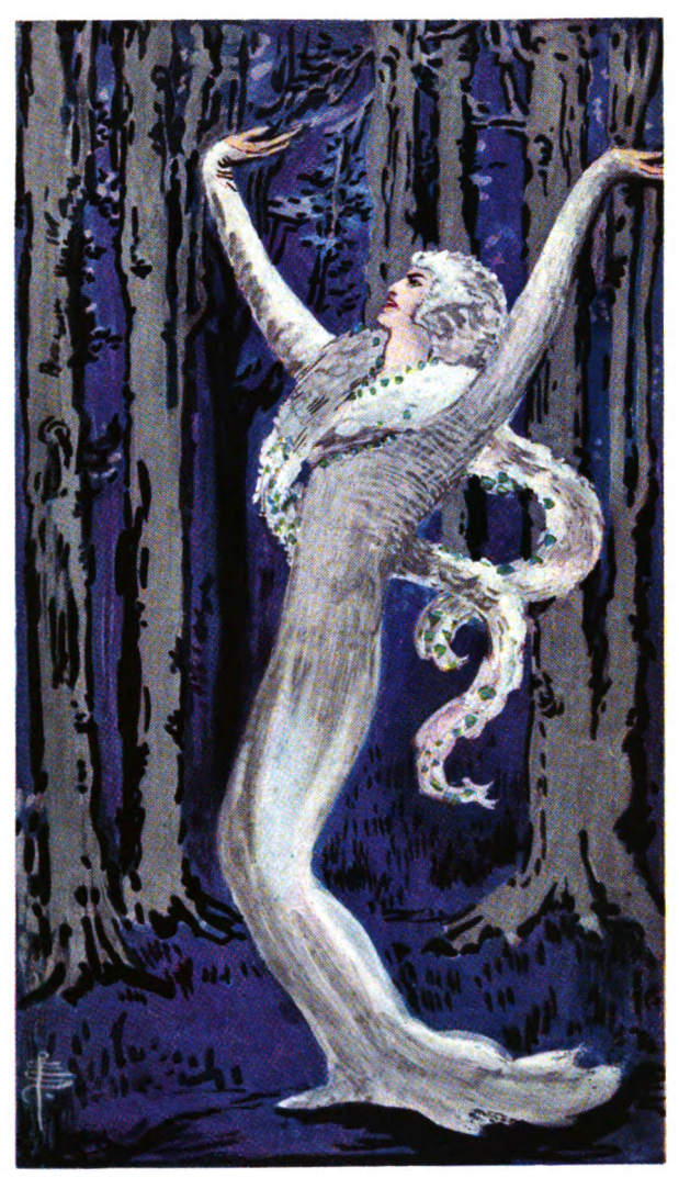
"Lady Arabella was dancing in a fantastic sort of way." [FACING PAGE 86