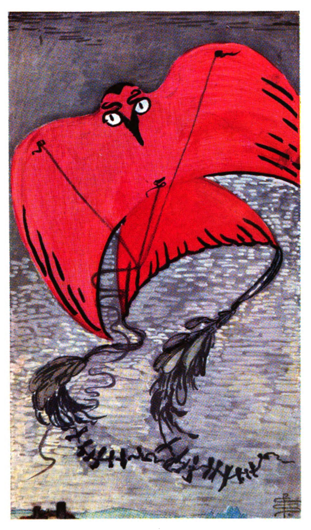
"The kite was shaped like a great hawk." [FACING PAGE 100.