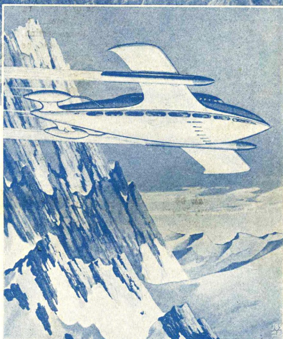
This fictional jet-propelled ship is the invention of James B. Settles (artist) and Henry Gade (author). Note '42 date.

In the cut above is shown the new P-80, the Shooting Star, manufactured by Lockheed. It is propellerless and travels solely