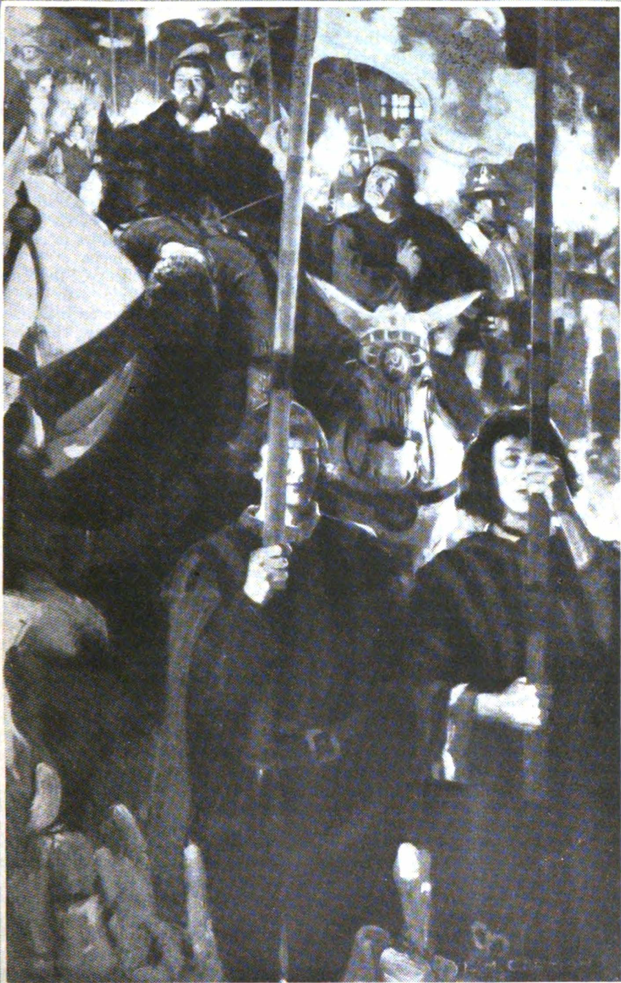
The cavalier in the tiger-skin cloak was suddenly seen to crumple forward upon the neck of his charger.