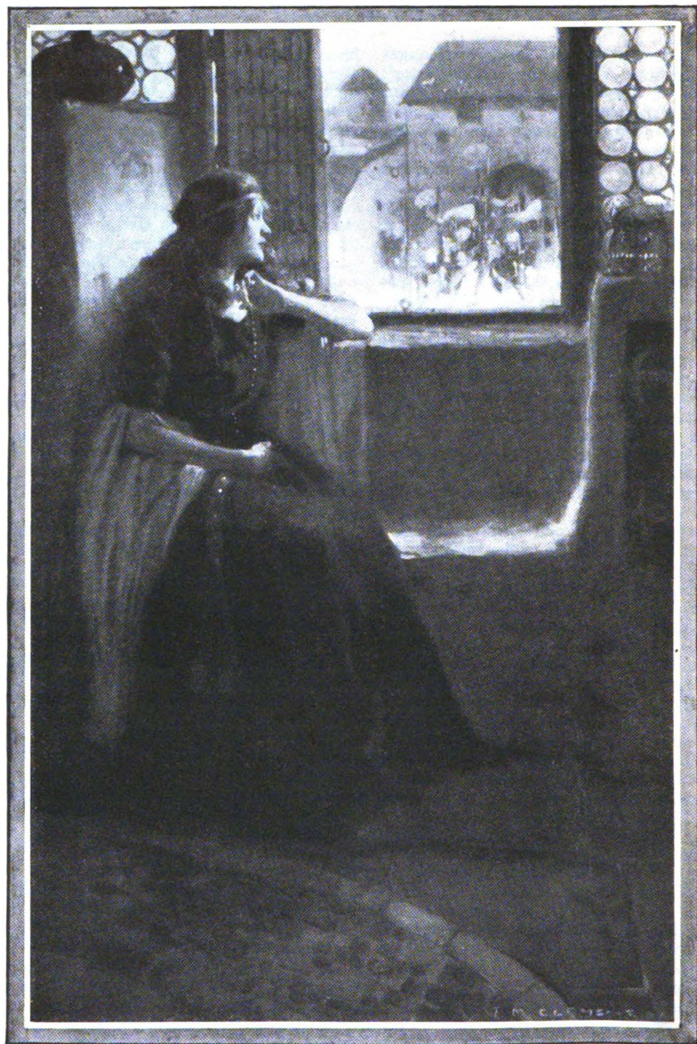
She sat by the window, and toward evening she saw the duke returning with his gay cavalcade.