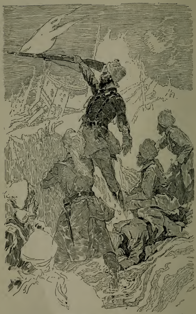
The Germans cheered and laughed, but we made never a sound