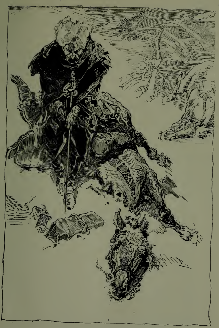
"I would rather see the end!" said he