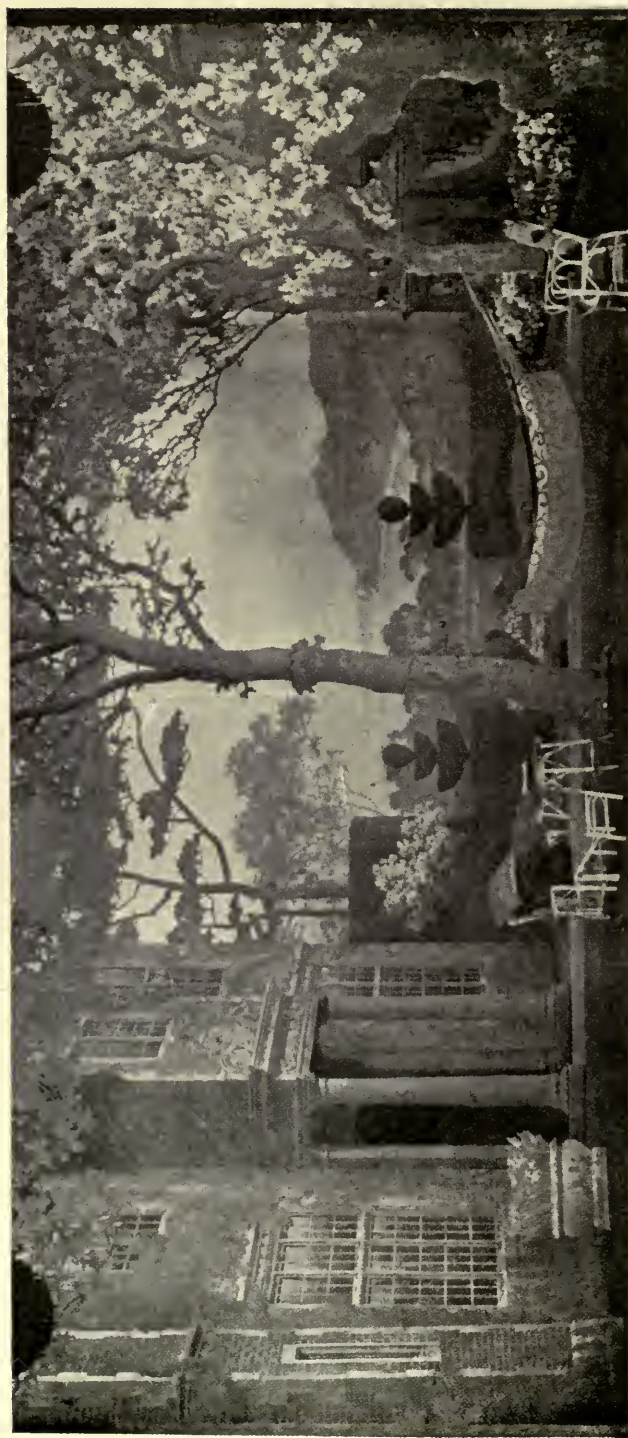
[To face page 7.]