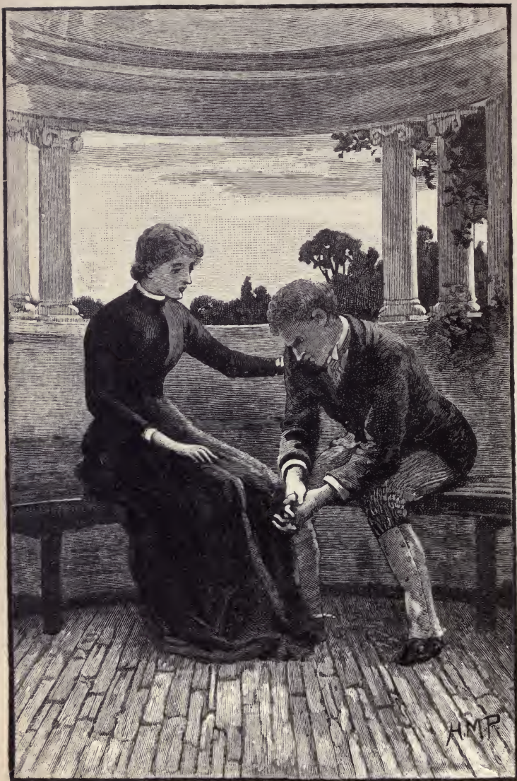
IN THE SUMMER HOUSE.