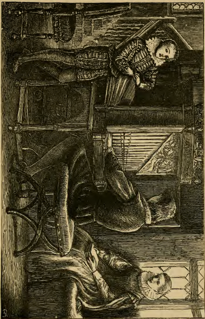
His volant touch Fled and pursued transverse the resonant fugue.