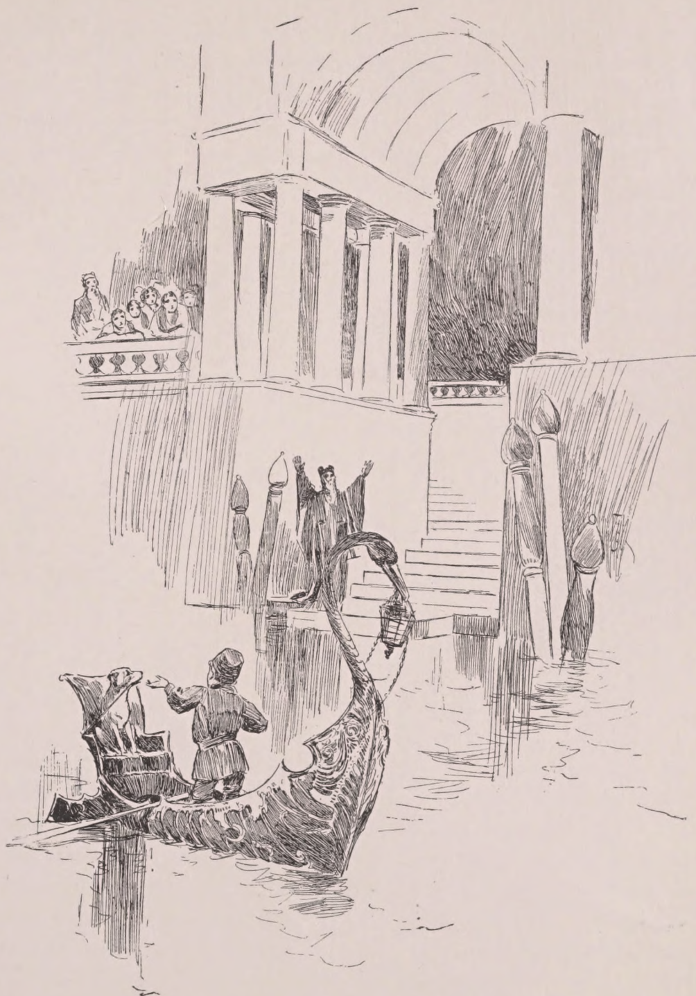
SAILING AWAY FROM THE LAND OF THE SOODOPSIES.