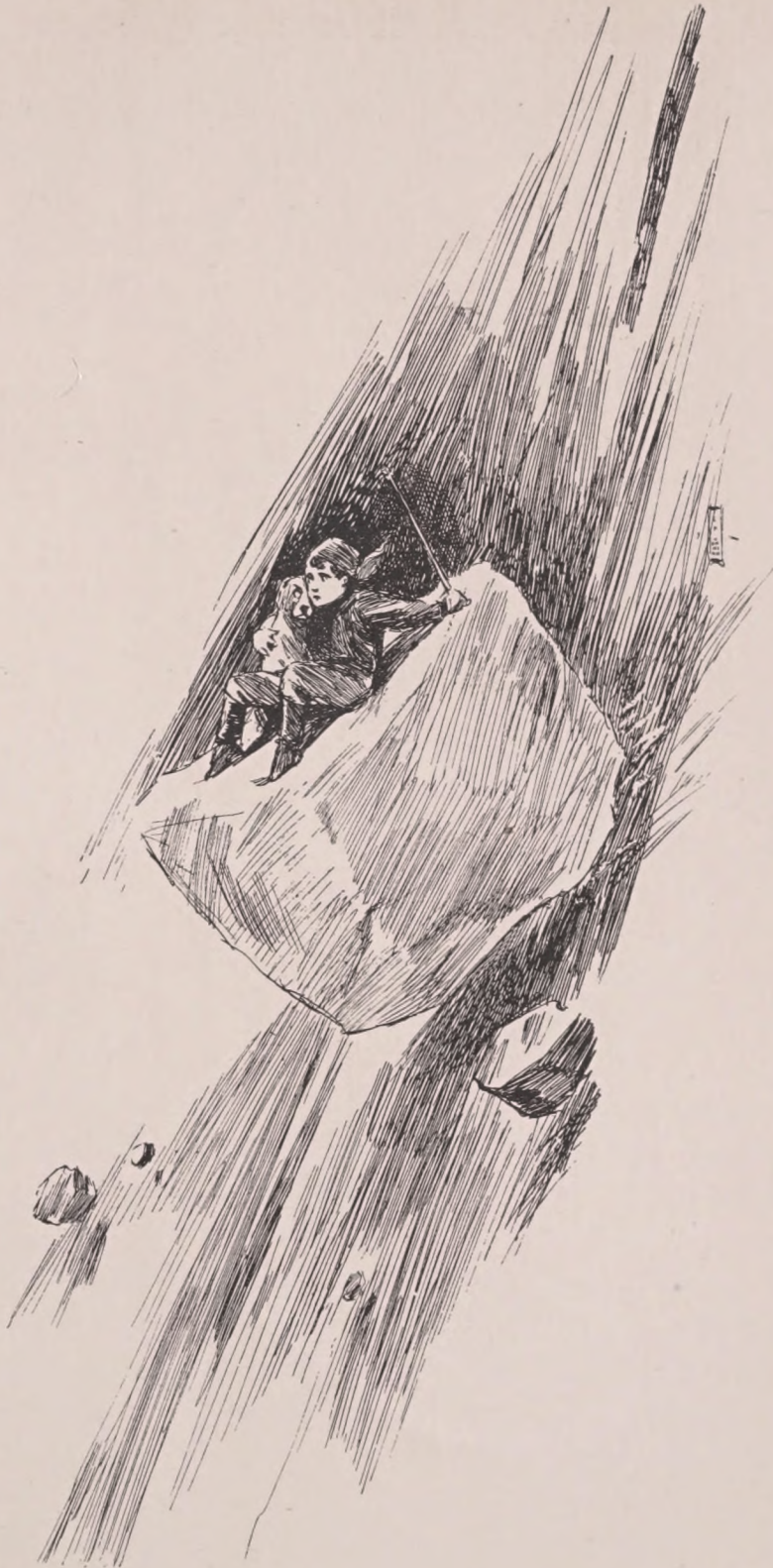
THE WONDERFUL RIDE ON THE BLOCK OF ICE.