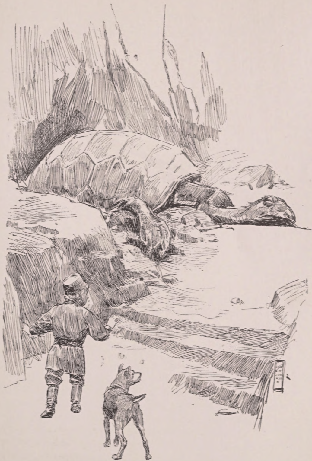
THE GIGANTIC TORTOISE THAT DEVOURED POUTING LIP.