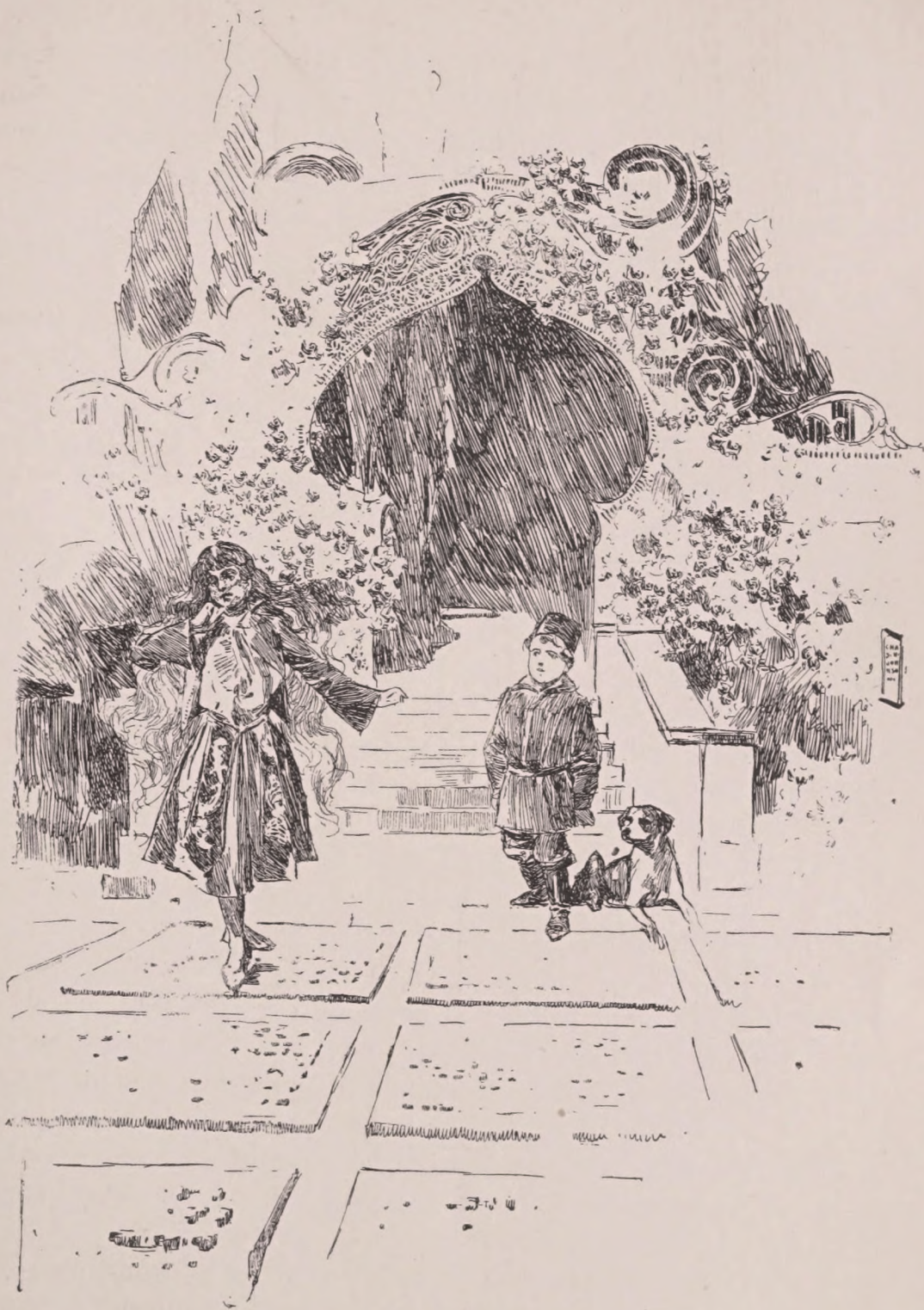
A SOODOPSY MAIDEN READING HER FAVORITE POET