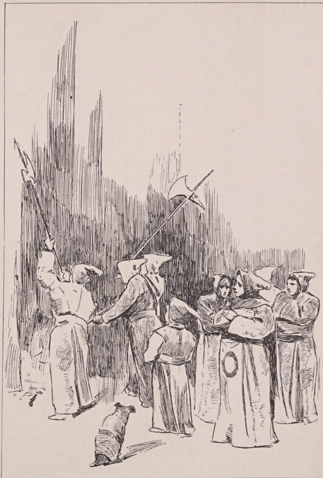
KOLTYKWERPIAN QUARRYMEN HEWING A PASSAGE THROUGH THE WALL OF ICE.