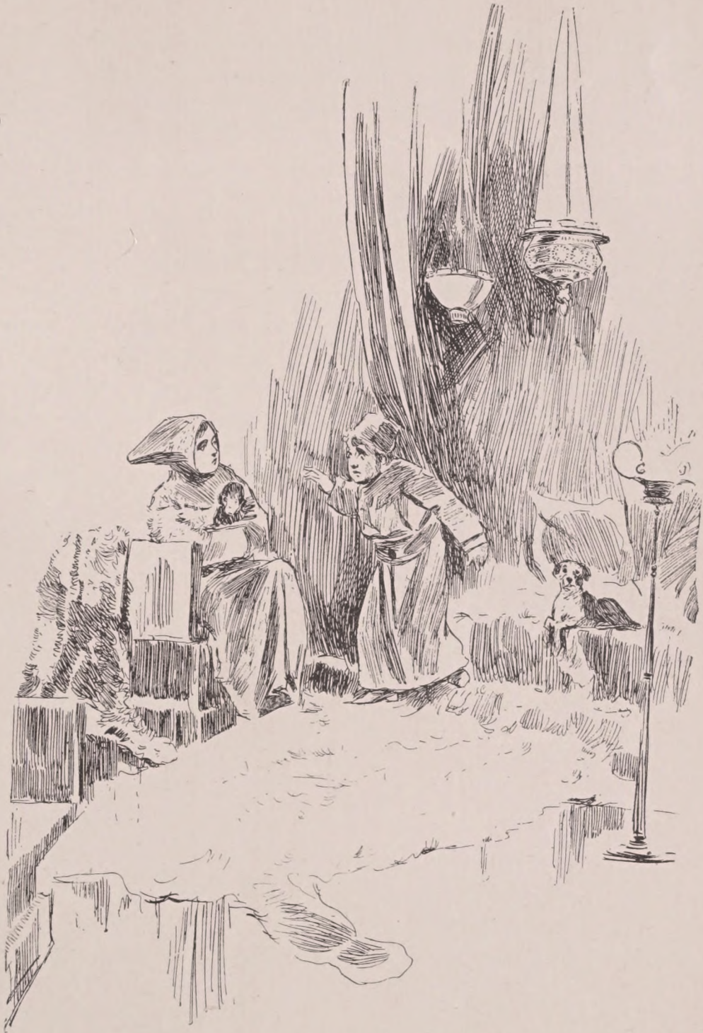
DEATH OF FUFFCOOJAH.