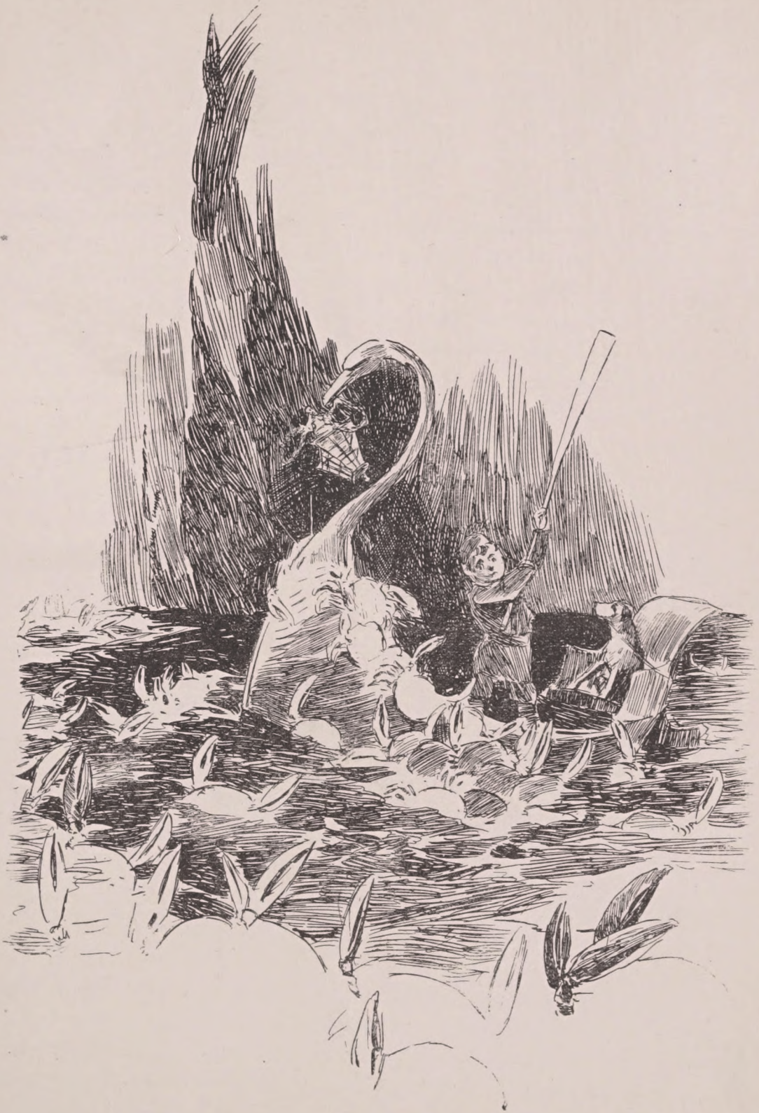
THE BATTLE FOR LIFE WITH THE WHITE CRABS.