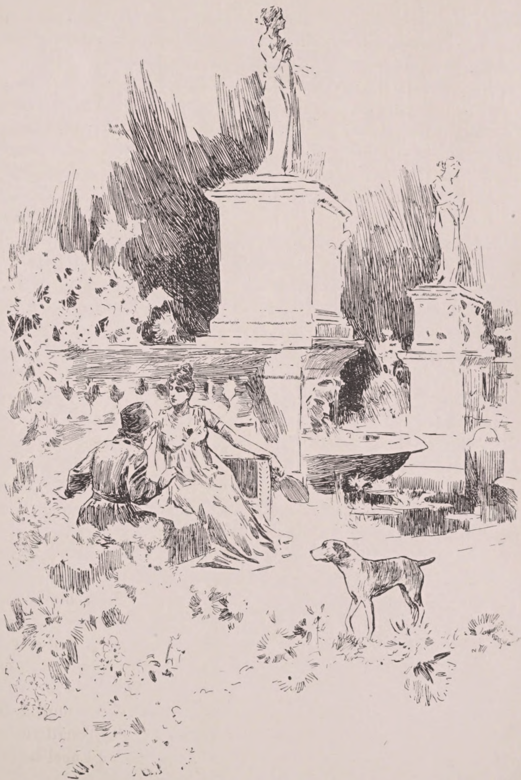
PRINCESS CRYSTALLINA UNCOVERS HER HEART.