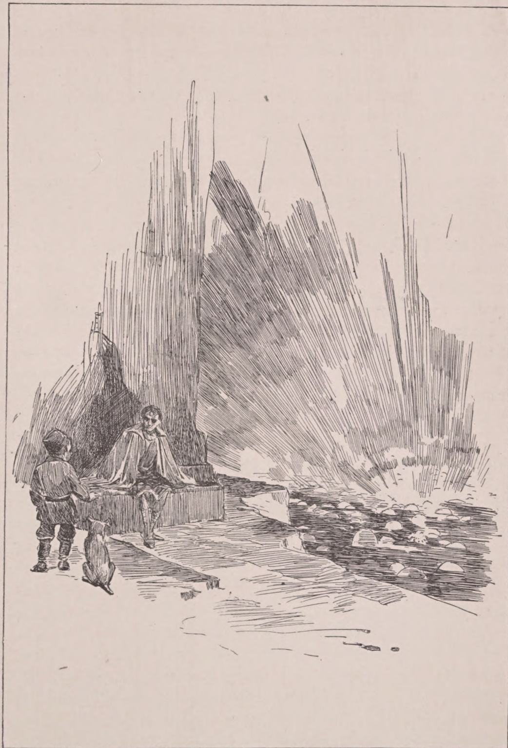
THE TROPICS OF THE UNDER WORLD.