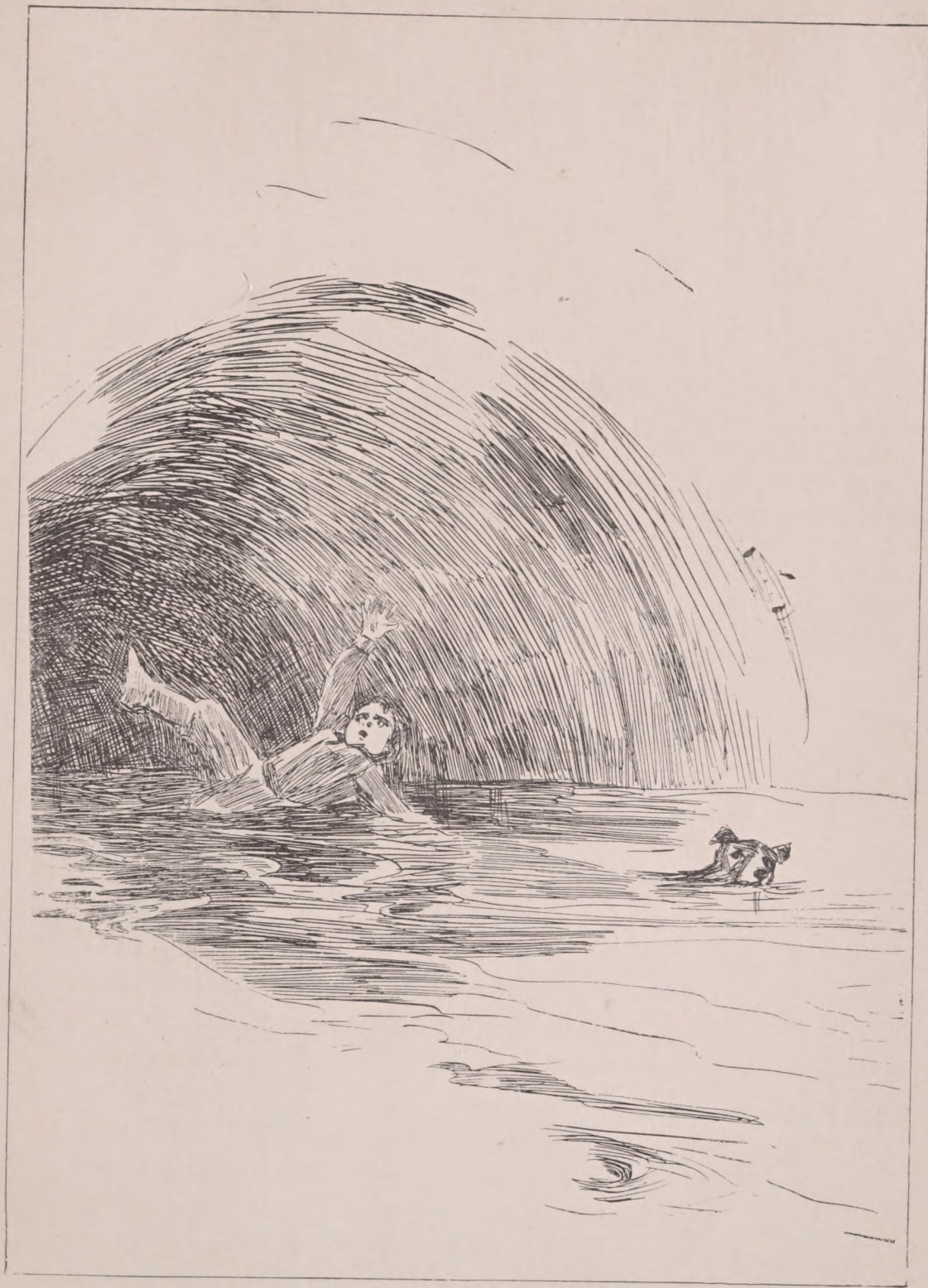
CAUGHT UP IN THE ARMS OF THE TORRENT.