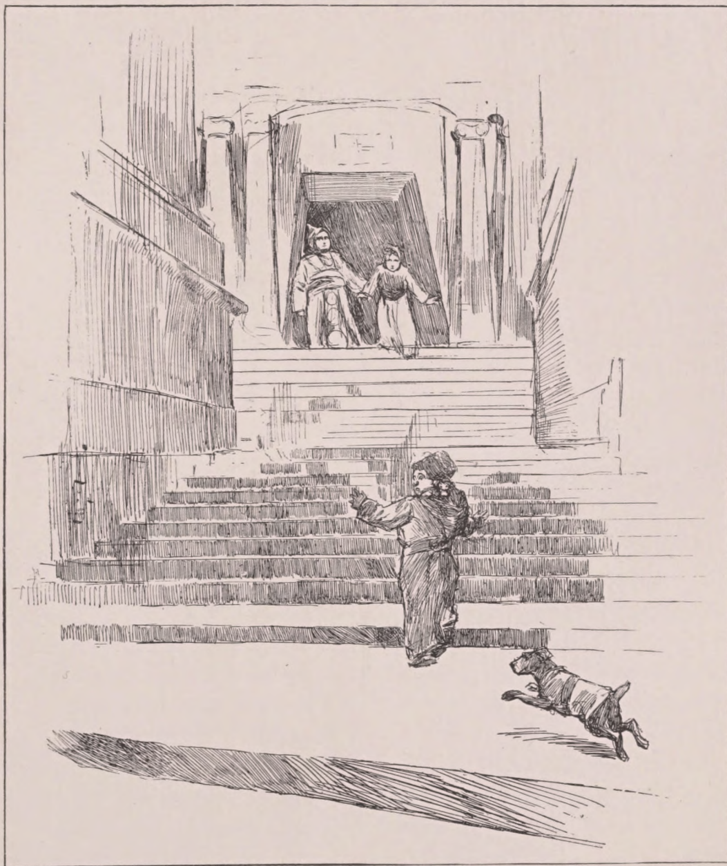
THE BARON'S FLIGHT TO THE ICE PALACE.