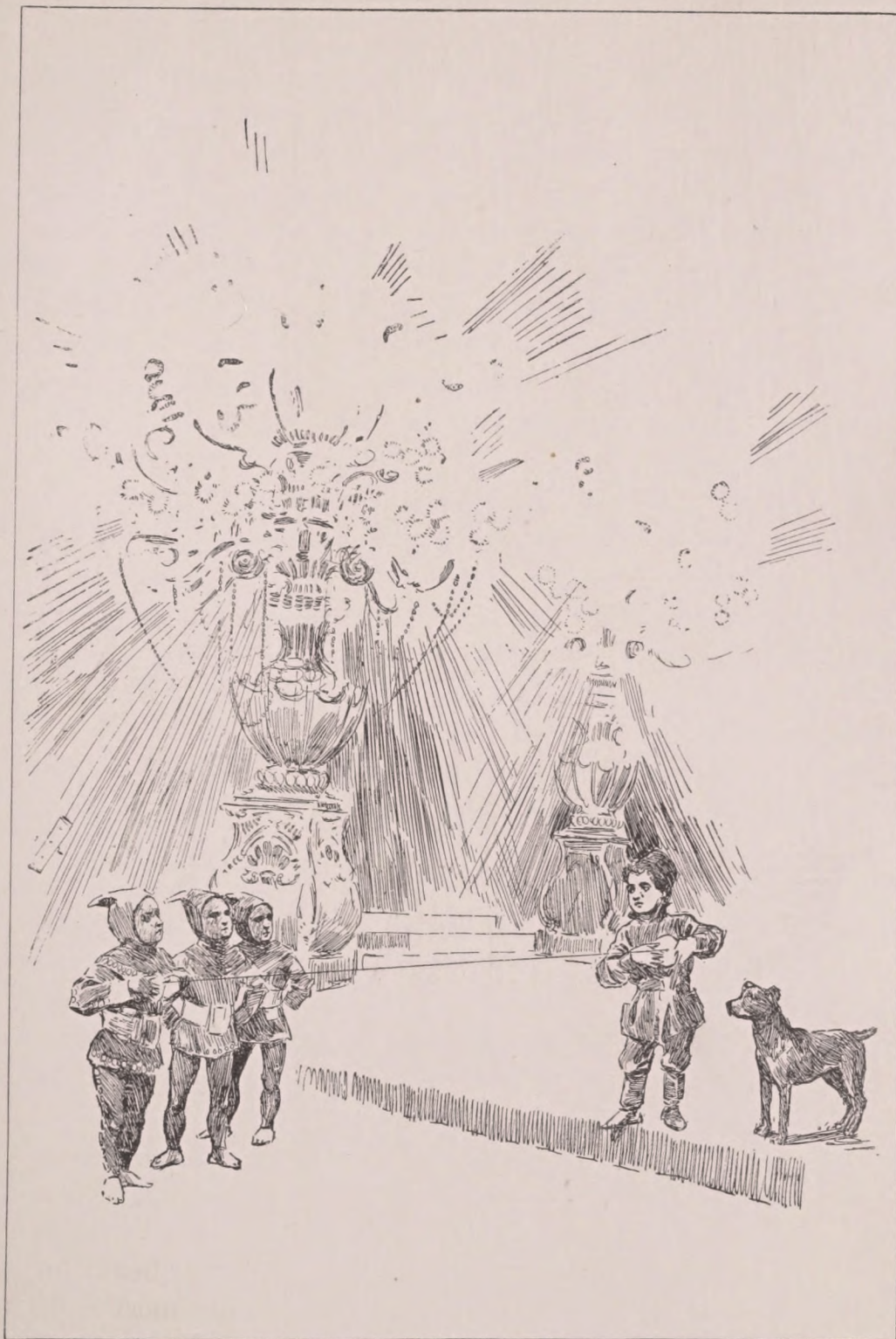
THE FORMIFOLK TRY THE BEAT OF THE BARON'S HEART BY TELEPHONE.