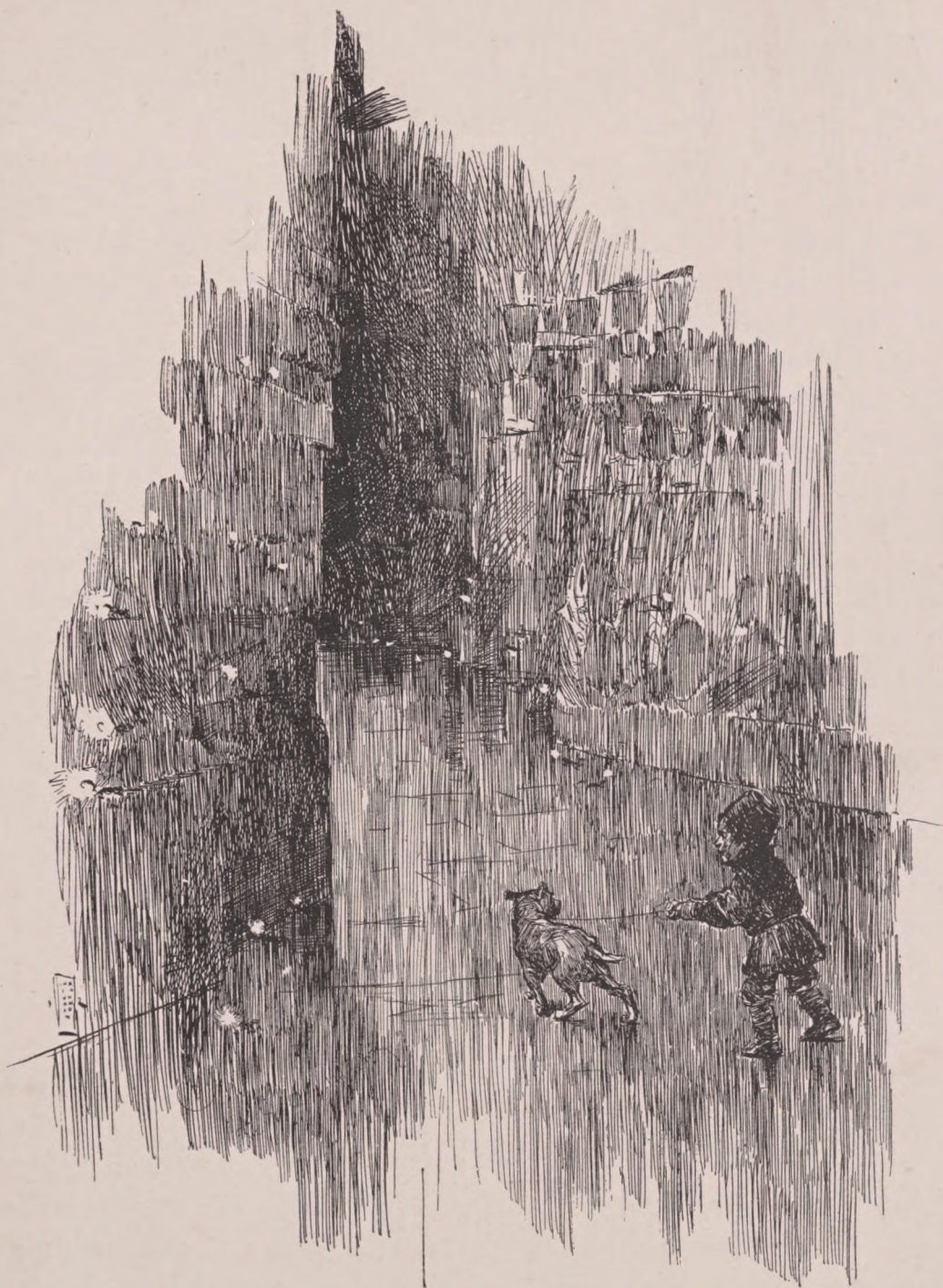
ALONG A HIGHWAY OF THE UNDER WORLD.