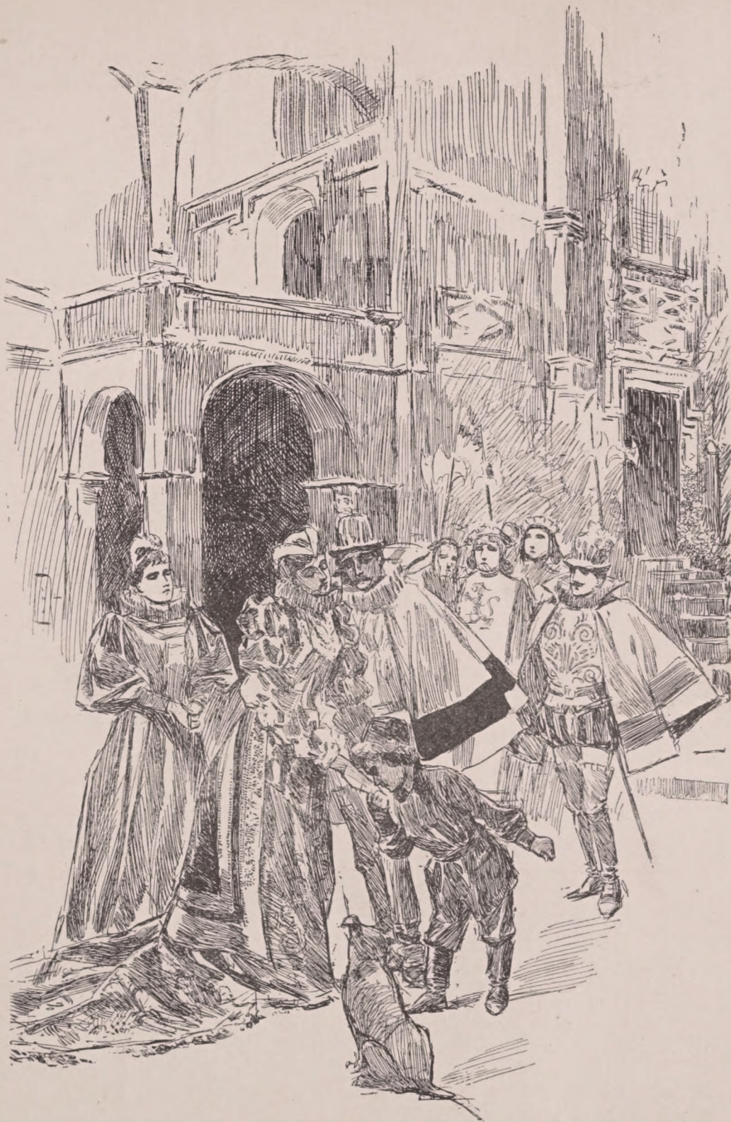
DEPARTURE FROM CASTLE TRUMP.