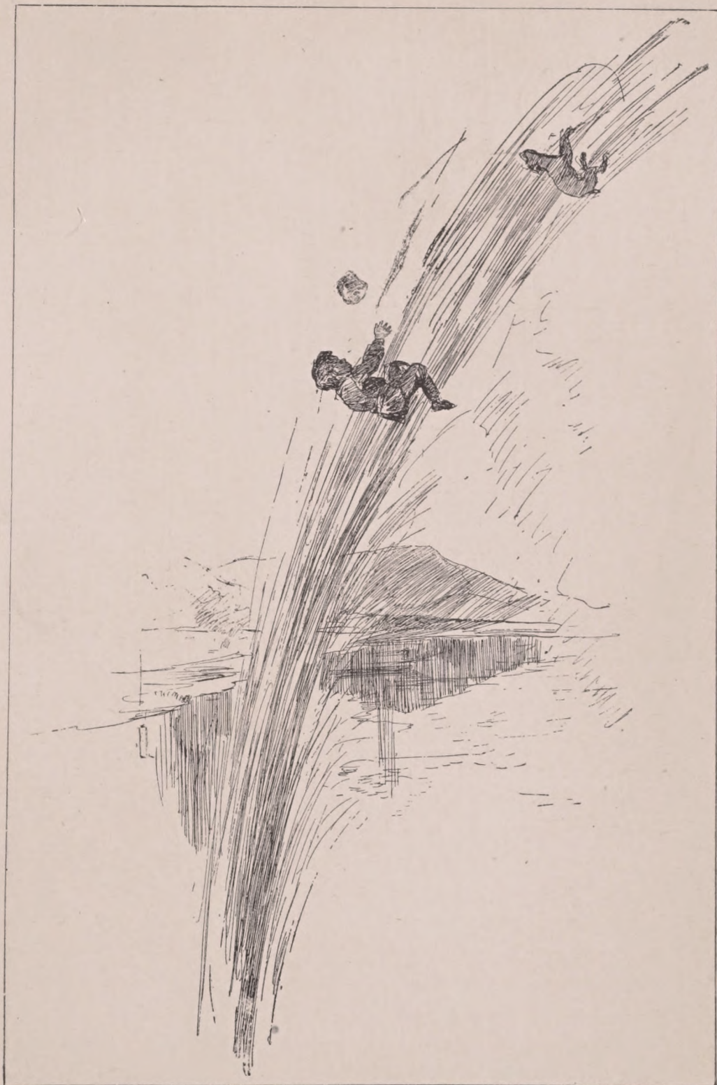
HURLED OUT IN THE SUNSHINE.