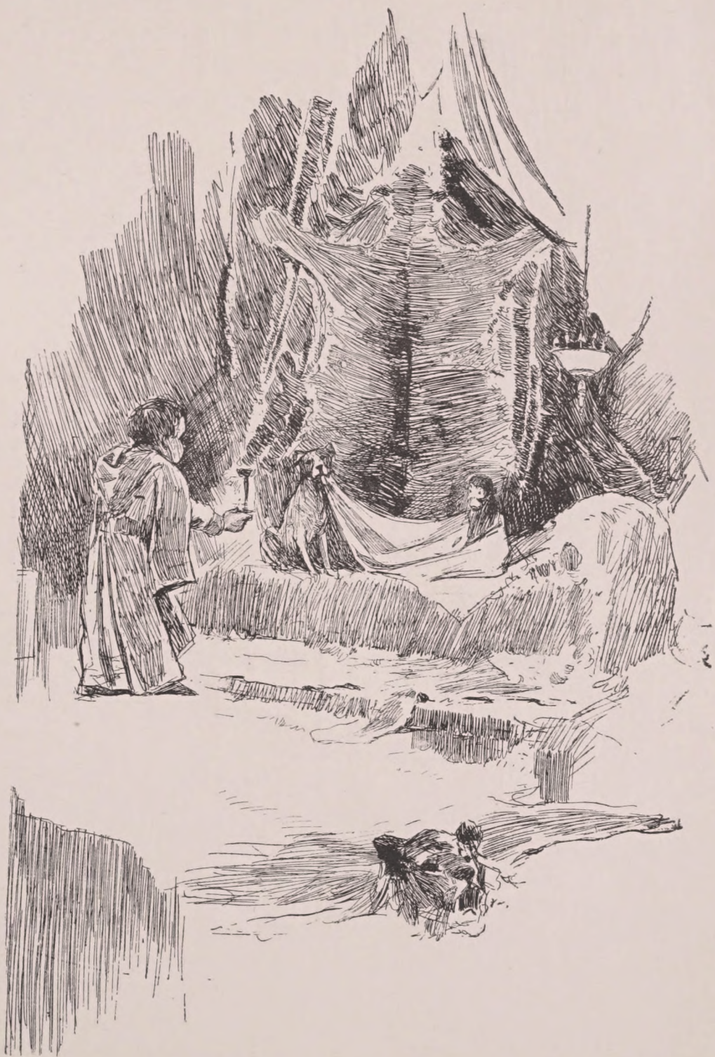
BULGER SHOWS THE BARON SOMETHING WONDERFUL.