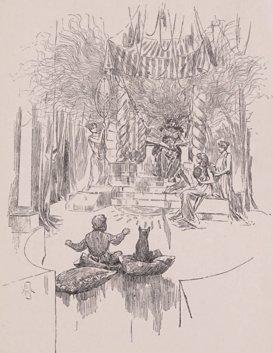
BEFORE HER MAJESTY GALAXA, QUEEN OF THE MIKKAMENKIES.