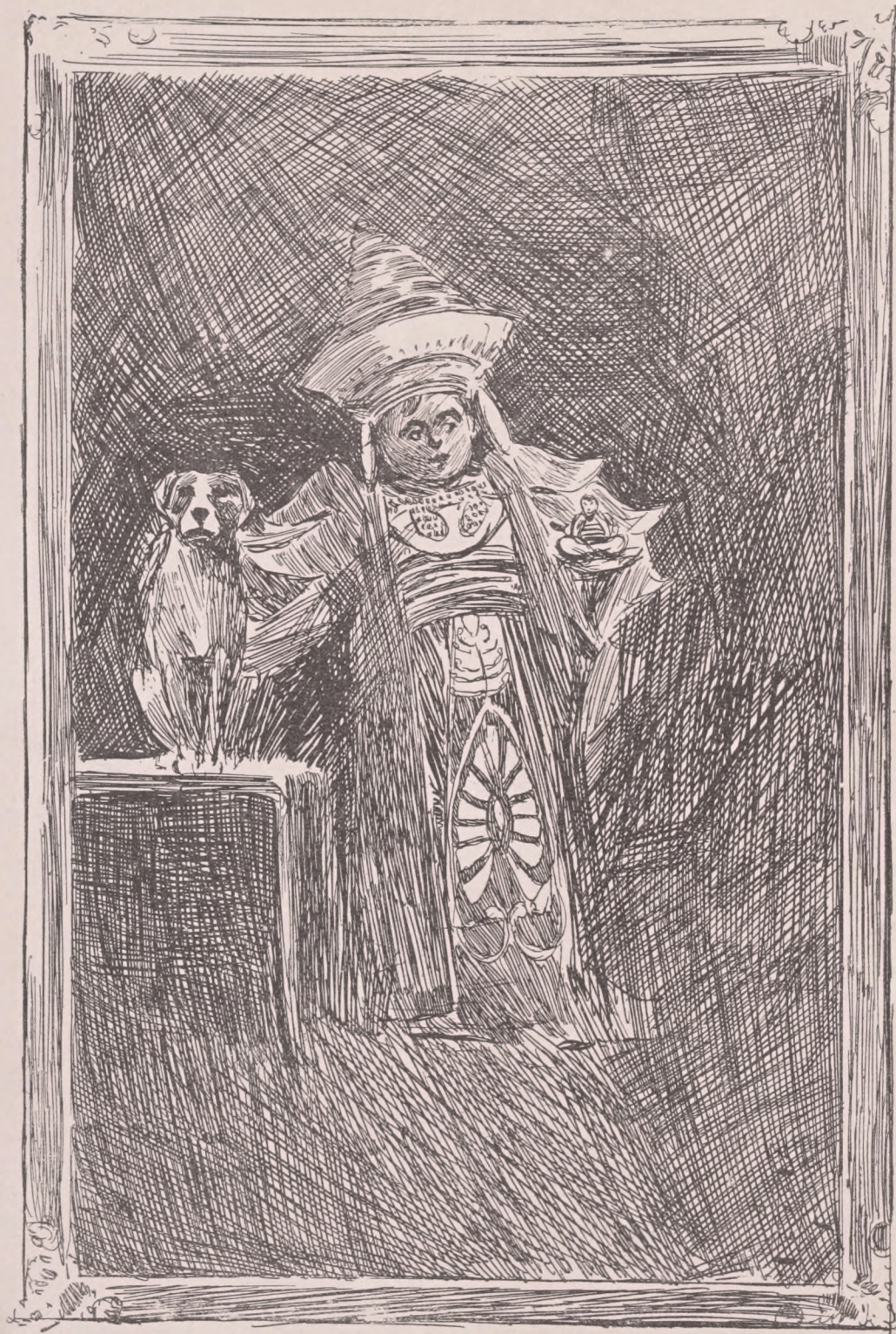
ONLY AUTHENTIC PORTRAIT OF WILHELM HEINRICH SEBASTIAN VON TROOMP (FROM THE OIL PAINTING).