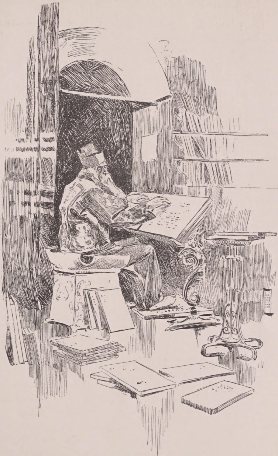
BARREL BROW ENGAGED IN READING FOUR BOOKS AT ONCE.