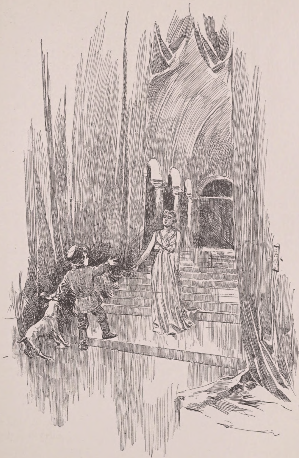
BULGER PARTS HIS MASTER FROM PRINCESS CRYSTALLINA.