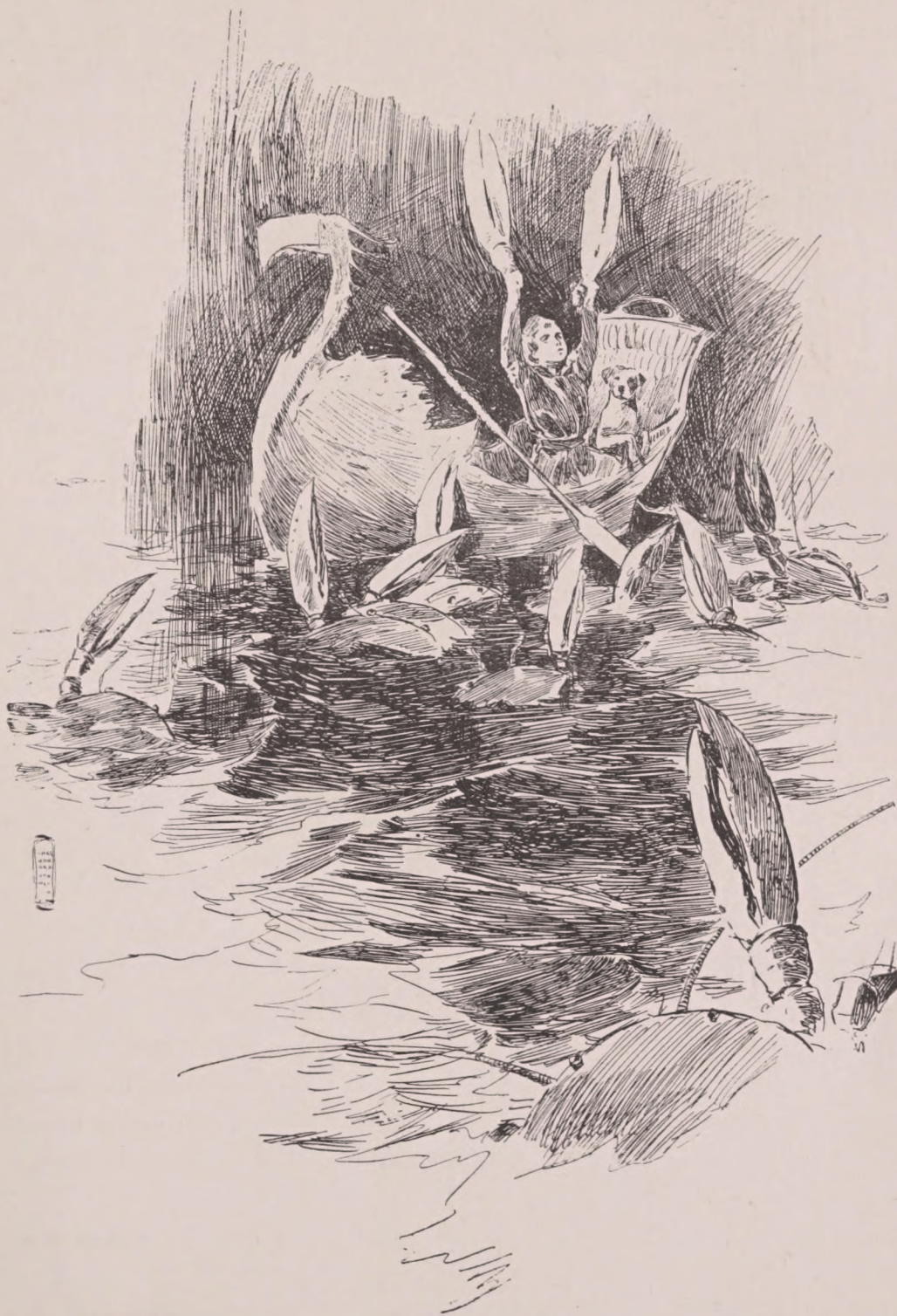
A DINNER EASILY PROVIDED FOR.