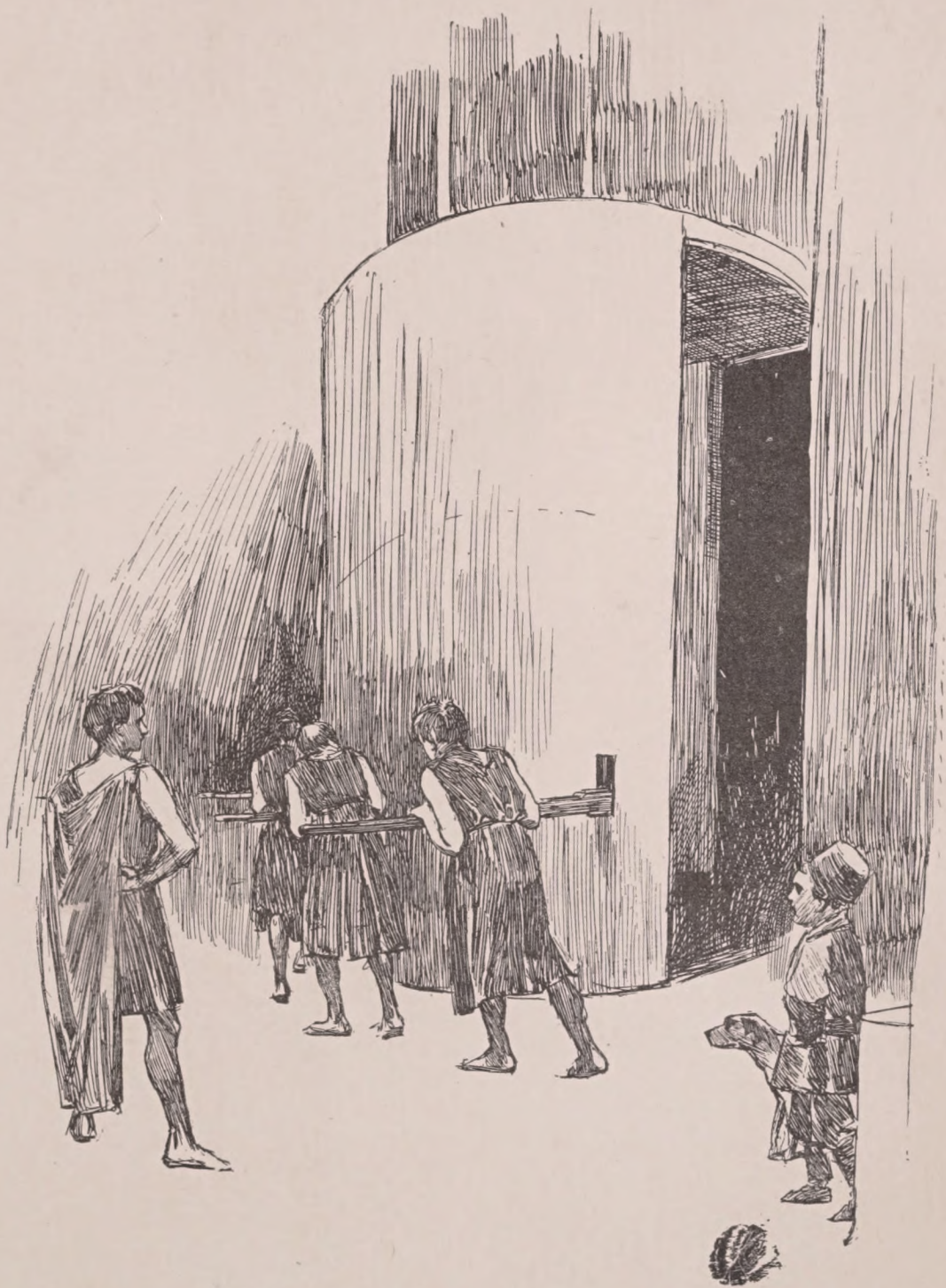
THROUGH THE REVOLVING DOOR.