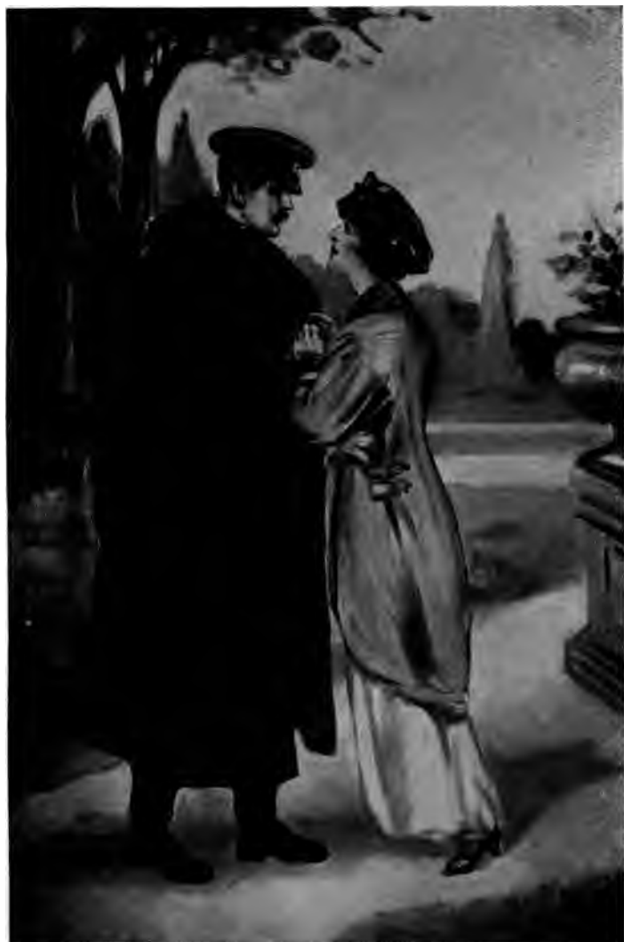
THE YOUNG MAN COULD NOT RESIST THE SWEETNESS OF HER VOICE