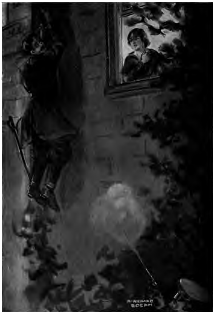
A POLICEMAN FIRED AND MISSED HIM